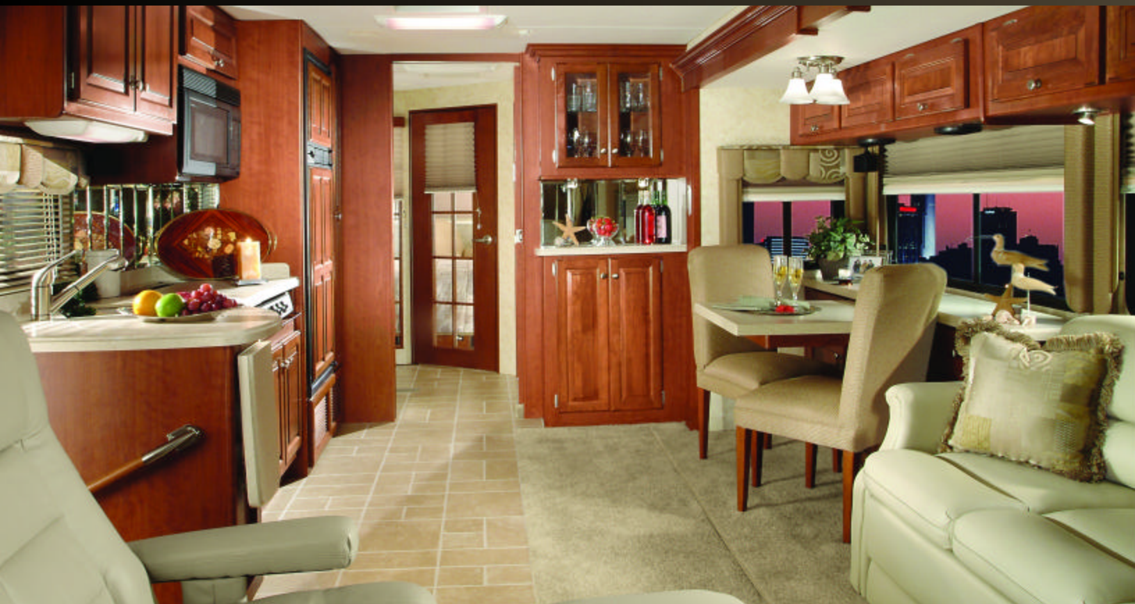
Shown with Santissima Taupe interior, Mushroom carpet, Cherry cabinetry option, and optional UltraLeather™ sofa and Euro recliner with ottoman.

E xtraordinary. That sums up the Infinity Class A motorhome. With exceptional quality.