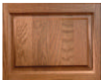
Hunt Club Oak