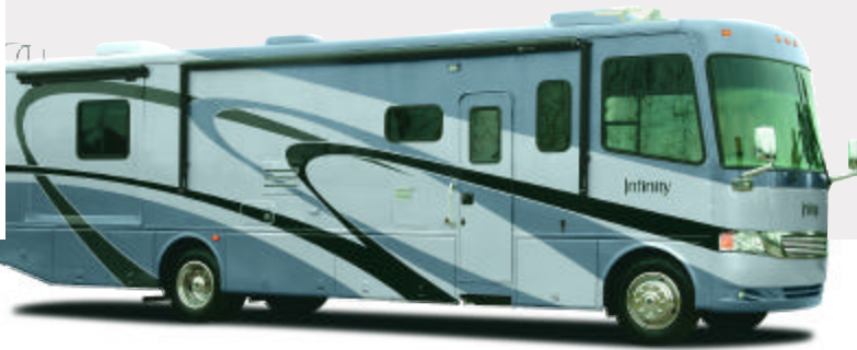
Shown with Titanium exterior paint option.