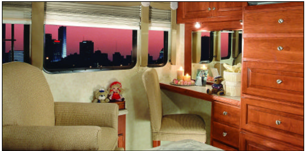
Model 36A features a smart-looking vanity with mirror and chair, plus a comfortable upholstered lounge chair. There is also plenty of cabinet and wardrobe storage to accommodate your personal belongings.

The spacious bedroom can provide an escape from a busy day—with all the amenities for you to relax in comfort and privacy. You can enjoy your favorite programs on the 20" flat screen television, or just curl up with a good book before bed. Attractive bedroom appointments include a queen-size bed, inner spring mattress and color-coordinated bedspread and pillow shams.