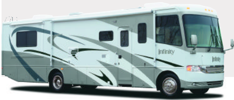
Shown with standard Desert Sand exterior graphics/paint package.