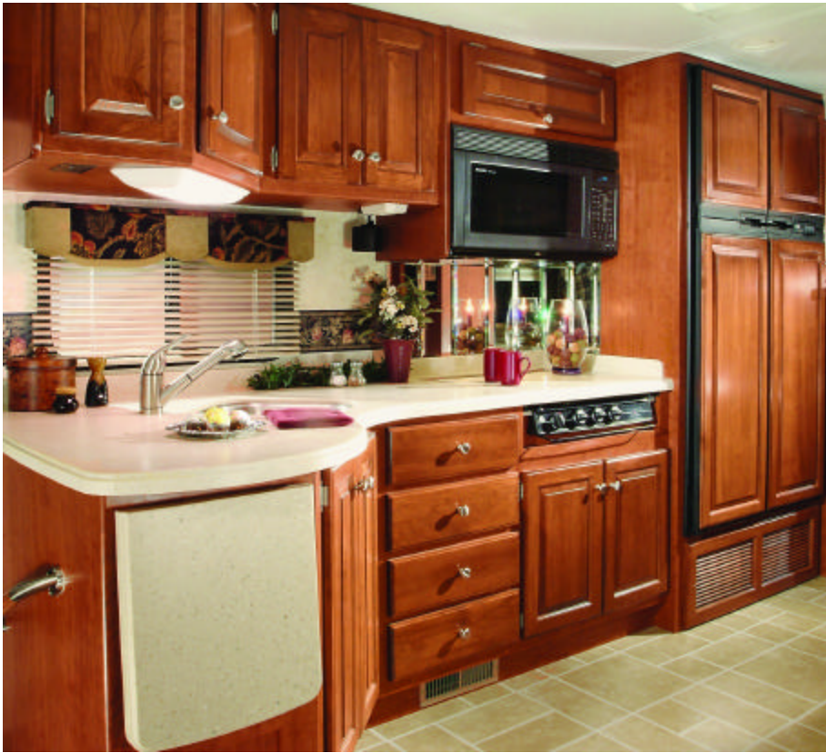
Shown with Hearthstone Raven interior, Wheat carpet, Cherry cabinetry option and optional side-by-side refrigerator with raised panel inserts.

The kitchen is equipped with high-quality appliances such as a spacious 8-cubic-foot refrigerator and 30" convection microwave oven with three-burner gas range top.