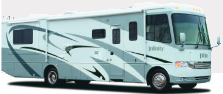
Shown with standard Pewter Metallic exterior graphics/paint package.