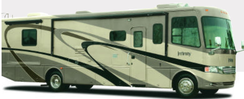
Shown with Topaz exterior paint option.