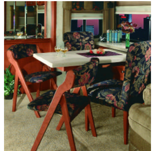
Shown with Hearthstone Raven interior, Wheat carpet and Cherry cabinetry option. The optional legless dinette features a beautiful laminate tabletop with Corian® edge, two beautifully upholstered chairs and two folding chairs. The decorative buffet provides added countertop space when entertaining and cabinet storage underneath.

With a great combination of exquisite styling, plush furnishings and ergonomic design, the Infinity surrounds you in a magnificent environment of comfort and world-class luxury. Standard features include a premium quality laminate flooring in the galley, bathroom and step well; plush wall-to-wall carpeting in the living area and bedroom; and contemporary beveled mirrors in the living area.