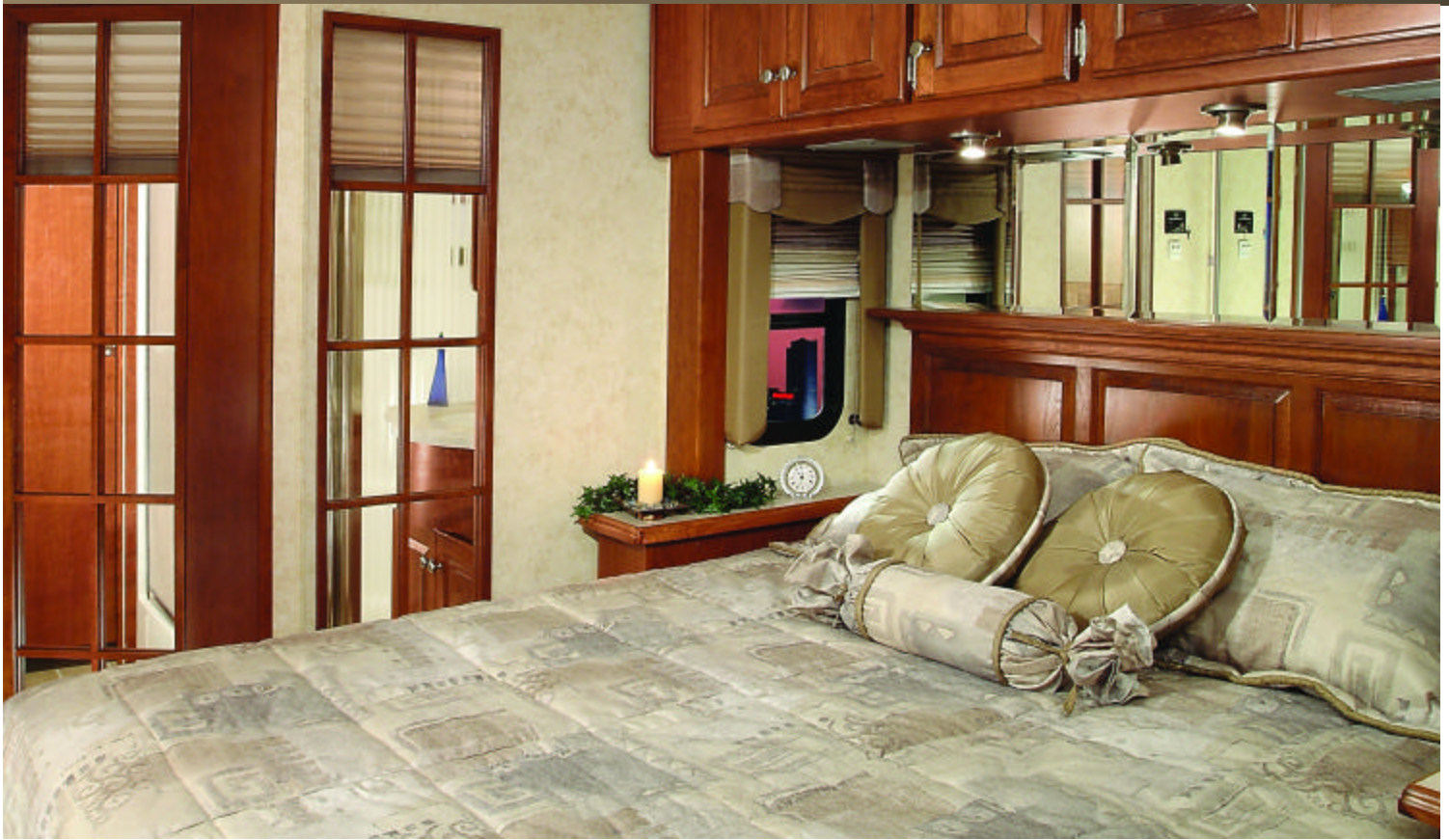
Shown with Santissima Taupe interior, Wheat carpet and Cherry cabinet option. Model 36A features a handsomely fashioned French door and window that add a touch of style, grace and beauty.