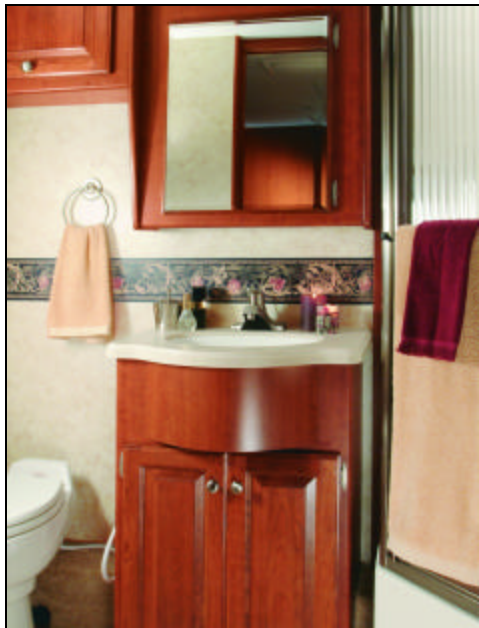
The full rear bath on Model 36Z is shown with Hearthstone Raven interior and Cherry cabinetry option. The standard residential height lavatory with decorative Corian® counter-top has added storage space for bathroom essentials.