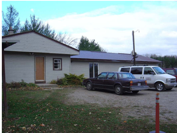
Wellington Sportsman's Club.