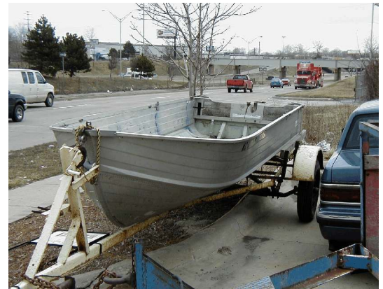
Bluefin needed too much work.

The second used boat found by Derek was a 16 foot Bluefin which ended up being passed on when it was found to be too expensive to restore.