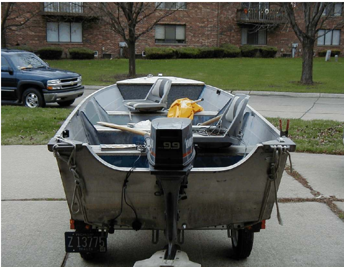
16 foot Grumman Before restoration.