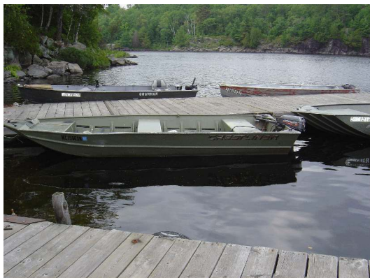
Docks unrepaired all season.

of 300 assorted sizes to ensure this would not happen again. By the end of their stay, the boys were down to only the Springbok working.