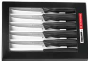
▶ 48792 6-Piece Set includes: 4½" Wavy Edge