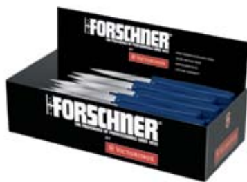
49624 Two dozen Victorinox Microban Knives (46600), Spear Point