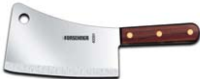
40091 1 lb., 7" x 3"