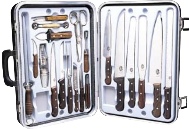
46052 24-Piece Set with Rosewood Handles