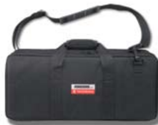
► 44959 Soft Chef's Executive Case