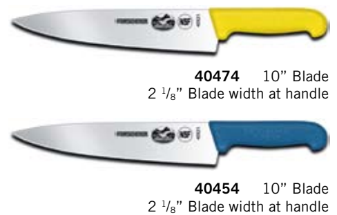
40474 10" Blade 2 1/8" Blade width at handle