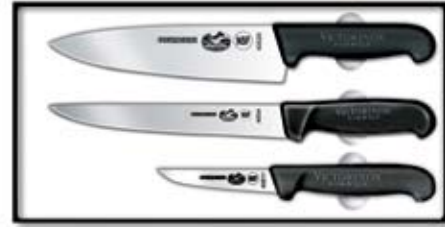
▶ 47892 3-Piece Set includes: ■ 40811 4" Parer ■ 40534 8" Slicer ■ 40520 8" Chef's