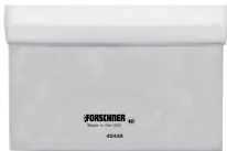
▶ 40448 3" x 6" Dough Scraper