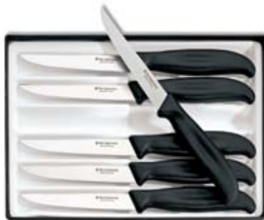
▶ 47650 6-Piece Set includes: ■ 40505 4 ½" Wavy Edge, Spear Point