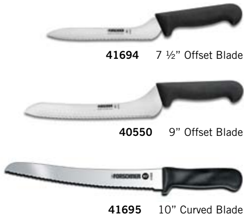
41694 7 1/2" Offset Blade