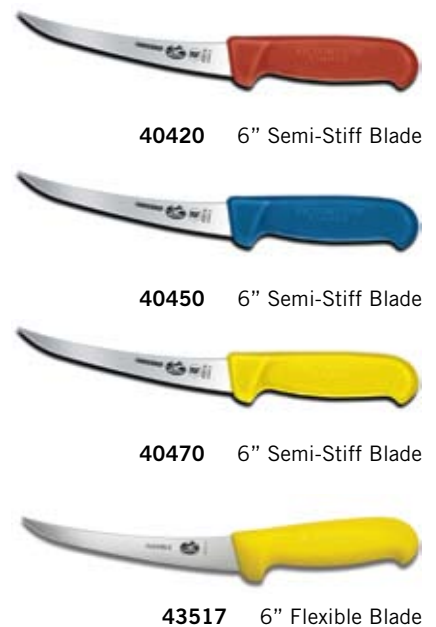
40420 6" Semi-Stiff Blade