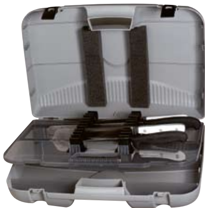
43960 Universal Victorinox Attache Case

Victorinox exclusive culinary hard case. Designed by the experts for safe knife storage. Multi-purpose, hard grey polypropylene shell with locking feature. Unique top tray system with flexible clips to safely hold a minimum of 10 knives, any shape, style or size. The tray lifts to store additional tools, gloves, books or gadgets, etc. in the base. A wonderful storage system for the working professional or student.