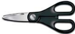
45898 3" Stainless Steel Blade, Rounded Safety Tip