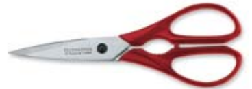
87770 4" Kitchen Shear with Bottle Opener