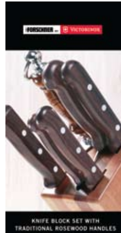
Rosewood Block Set Packaging