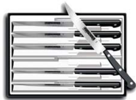
46799 6-Piece Set includes: ■ 41799 5" Wavy Edge, Spear Point