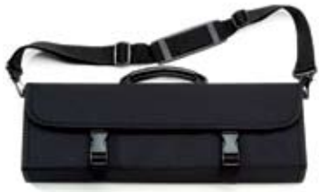
44902 Black polyester hard tri-fold case holds 10 knives up to 12" blade length. Additional pockets for extra accessories. Shoulder strap and business card holder included.