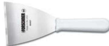
▶ 40457 4" x 5" Stiff Pan Scraper