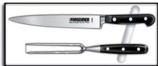
46891 2-Piece Set includes: ■ 41640 8" Slicer ■ 40594 11" Fork, 6" tines