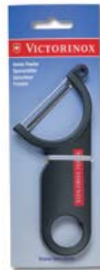
43793 Black Peeler