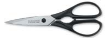
87771 4" Kitchen Shear with Bottle Opener