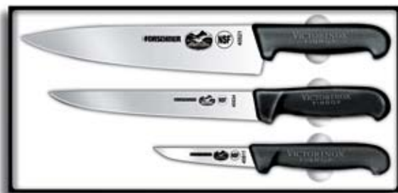
46892 3-Piece Set includes: ■ 40811 4" Parer ■ 40534 8" Slicer ■ 40521 10" Chef's