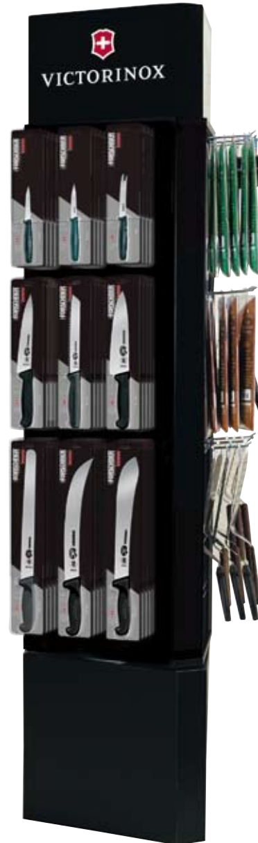
10003 Victorinox – spinning 3-sided floor display with base 17 ½"W x 63"H x 17 ½"D (add additional 12" with header)

Designed for maximum brand exposure of our line of carded/peggable items. See price list for complete item offering (dimensions below).