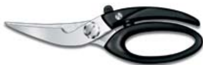
45899 4" Locking Blade 80003 Replacement Spring