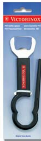
43790 Black Bottle Opener

Also Available in: 43795 ■ Red 43794 □ White