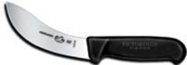
40535 5" Beef Skinning Blade