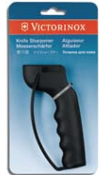
▶ 49012 Display with 12 of each Handheld Sharpener 8 1/2"H x 13 1/2"W x 8 1/2"D 49002 Handheld Sharpener