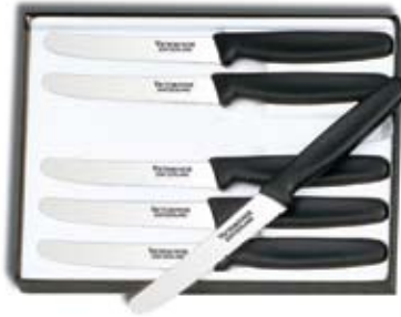
▶ 47558 6-Piece Set includes: ■ 40503 4 ½" Wavy Edge, Round Blunt Tip