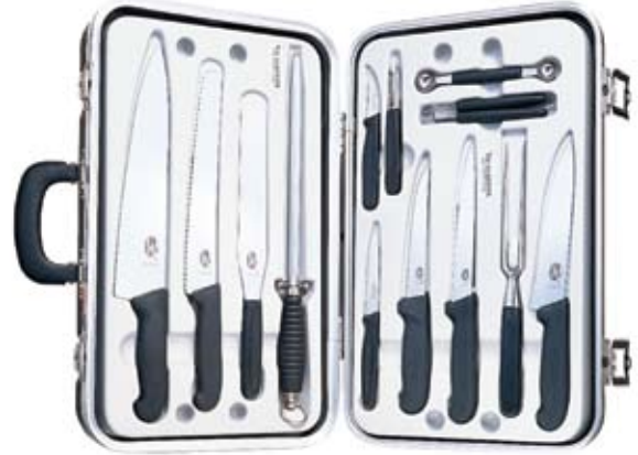
46552 14-Piece Set with Fibrox Handles