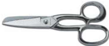
45904 Fish Shear, Nickel Plated, Serrated Edge