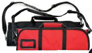
44956 Black polyester tri-fold roll holds 8 knives up to 12" blade length. Additional pockets for extra accessories. Shoulder strap and business card holder included.