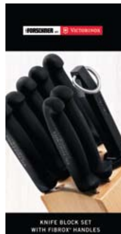
Fibrox Block Set Packaging