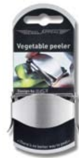
43788 Stainless steel Peeler

Also Available in: 43795 ■ Red 43794 □ White