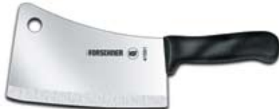
41591 15 oz., 7" x 3 ½"