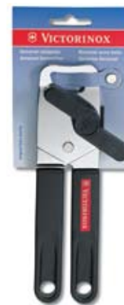
43798 Black Can Opener