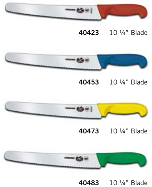
40423 10 1/4" Blade