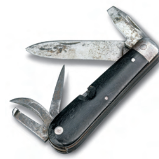
Soldiers' Knife 1891