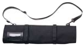
44904 Black polyester roll holds 13 knives/tools up to 14" blade. Velcro straps. Shoulder strap and business card holder included.