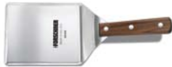
▶ 40408 5" x 6" Hamburger Turner, Stiff, 3 Sided Beveled