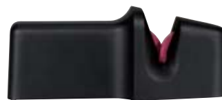
49001 Ruby Sharpening Wheels