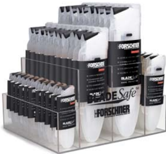
48300 Display with 12 of each BladeSafe size 12"W x 8"H x 10"D