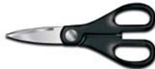
45896 3" Stainless Steel Blade