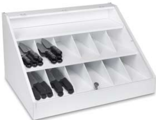
10007 Lockable stocking display case base 29 ¼"W x 22 ¼"H x 18 ½"D