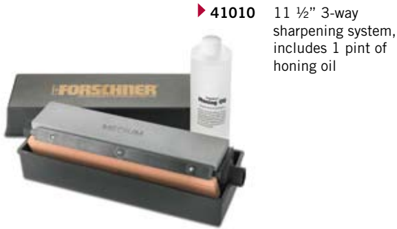
▶ 41010 11 1/2" 3-way sharpening system, includes 1 pint of honing oil