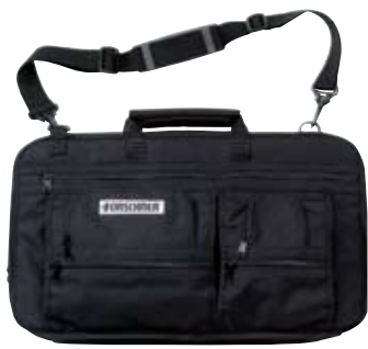
44953 Black polyester executive knife case holds 12 knives up to 12" blade length. Extra pockets for additional accessories and additional slots for your small garnishing tools. Shoulder strap and business card holder included.