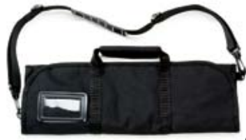
44955 Black polyester tri-fold roll holds 12 knives up to 12" blade length. Additional pockets for extra accessories. Shoulder strap and business card holder included.