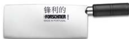
41589 Chinese, Curved, 8" x 3"