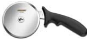
41594 4" Pizza Wheel, Polypropylene Handle