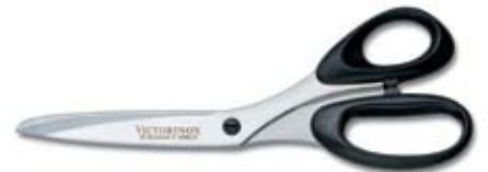
▶ 87779 8 1/2" Bent Shear, Stainless Steel