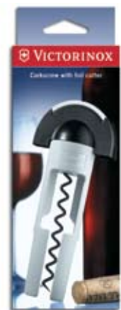
43796 Black Corkscrew

Also Available in: 43792 ■ Red 43791 □ White