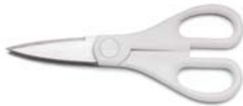
45889 3" S/S Kitchen Shear Stainless Steel