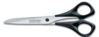
▶ 87777 6" ClipPoint