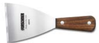
▶ 40414 4" x 5" Stiff Pan Scraper