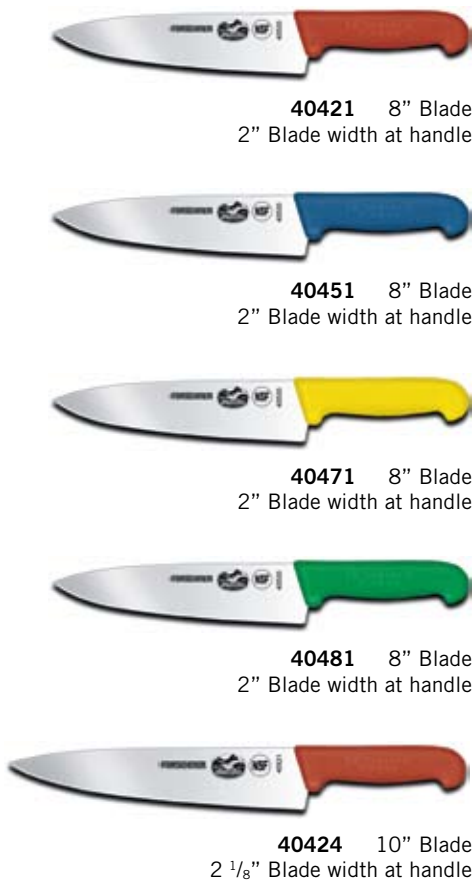
40421 8" Blade 2" Blade width at handle