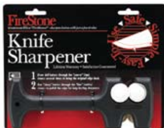
49000 Firestorm Ceramic Manual, Two Stage Sharpening Tool