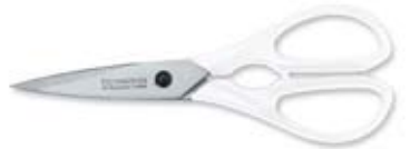
87772 4" Kitchen Shear with Bottle Opener