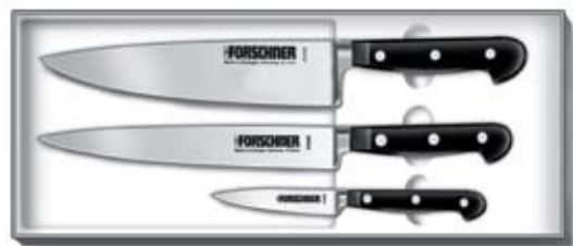
46890 3-Piece Set includes: ■ 41603 ¾" Parer ■ 41640 8" Slicer ■ 41620 8" Chef's