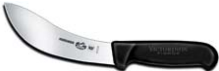
40536 6" Beef Skinning Blade