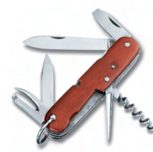
Officers' Knife 1897