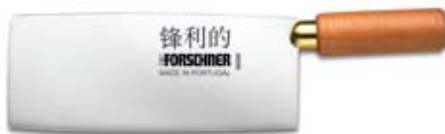
40090 Chinese, Curved, 8" x 3"