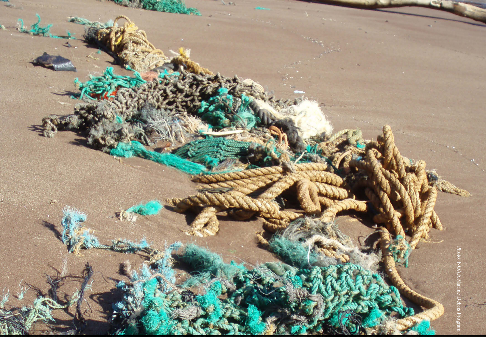
The Hawaiian Islands are a hotspot for marine debris accumulation due to their location within the North Pacific oceanic currents. Derelict fishing gear and assorted debris from distant locations frequently wash ashore and impact the native habitats and organisms of Hawaii.