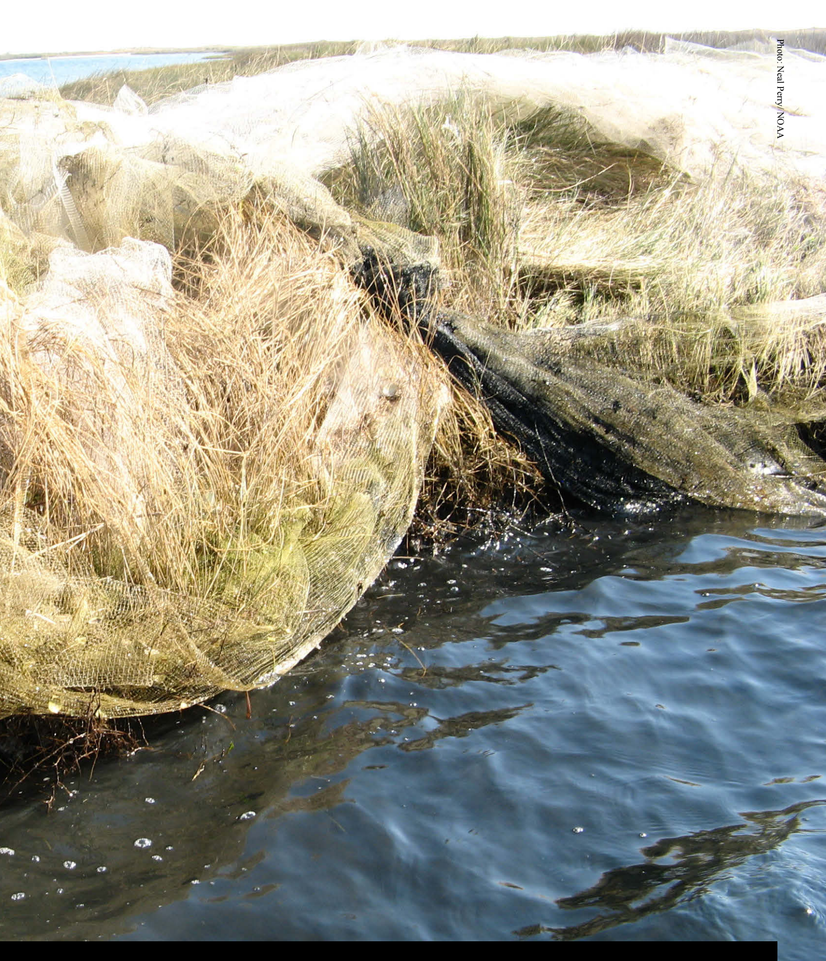
Nets, fishing line, crab pots, and lobster traps are types of derelict fishing gear that can negatively impact marine habitat and entangle marine life.