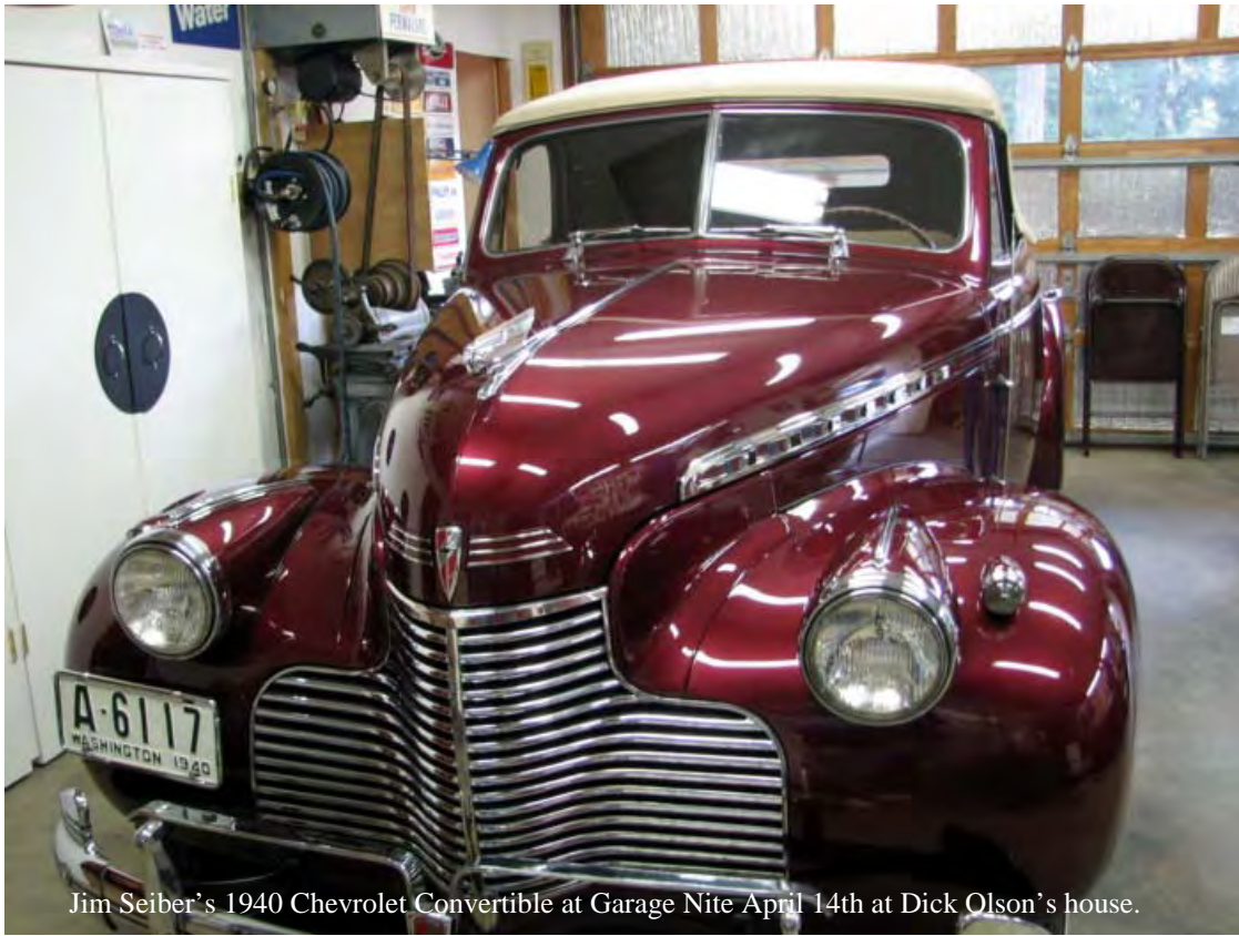
Jim Seiber's 1940 Chevrolet Convertible at Garage Nite April 14th at Dick Olson's house.