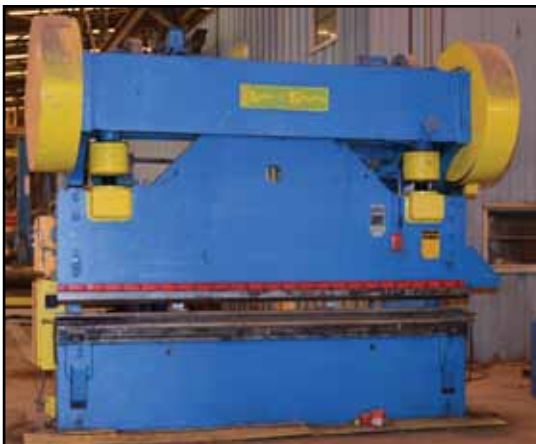
LODGE & SHIPLEY 375-Ton Mechanical Press Brake