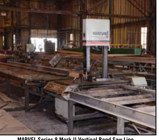
MARVEL Series 8 Mark II Vertical Band Saw Line