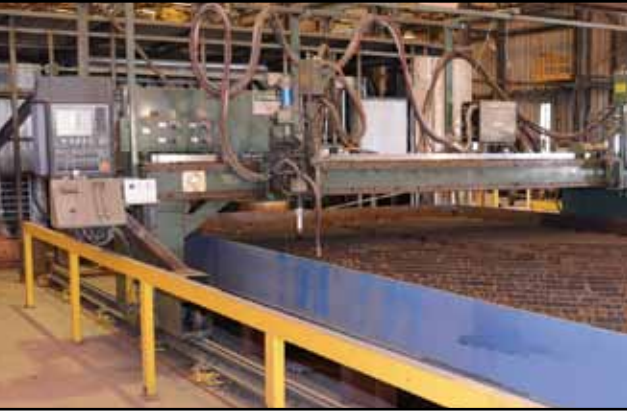
LTEC CM-360 CNC Plasma / Oxy Cutting Table