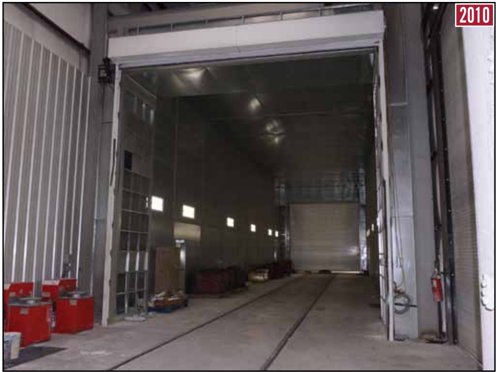
2010 GLOBAL FINISHING (GFS) 24' x 24' x 124' Drive Thru Oven Line