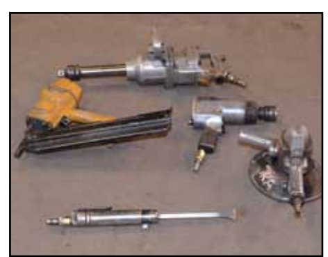
(200+) Pneumatic & Electric Hand Tools