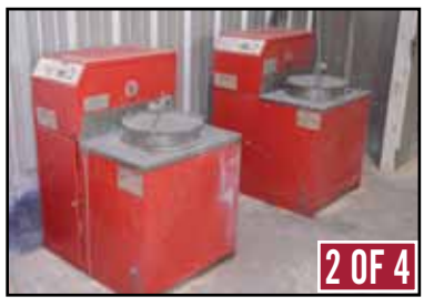
(4) TURBINAIR Becca Solvent Recyclers

24' x 124' Drive Thru, Low Temp Oven, Model LTOE-424-PDT-124, Approx.