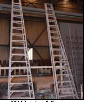
(25) Fiberglass & Aluminum Folding Ladders