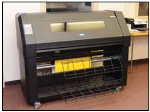
SUMMA DC4 Roll Printer