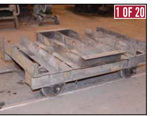
(20) 6' x 46" Rail-Mounted Transfer Carts