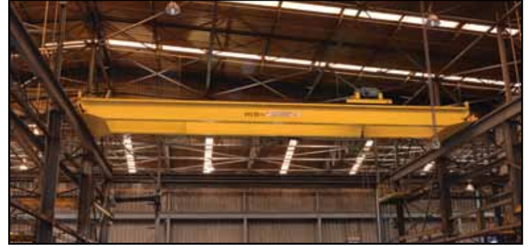
NORTH AMERICAN 20-Ton Bridge Crane