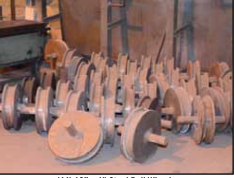
(44) 16" x 4" Steel Rail Wheels