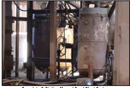
Complete 2-Station Manual Sand Blast System