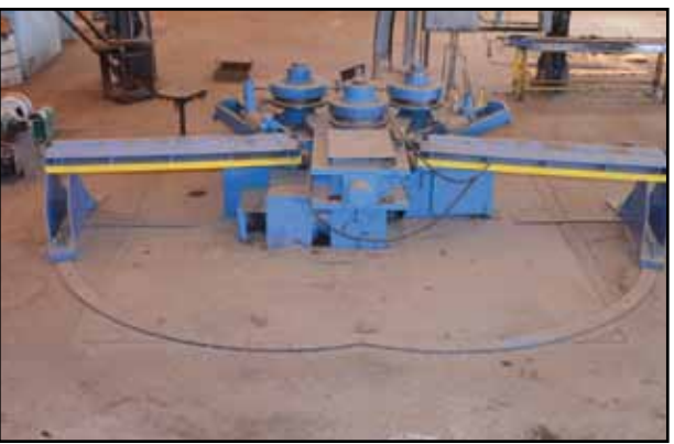
HAEUSLER 9.9" x 9.9" x 0.95" Horizontal Mechanical Angle Bending Rolls