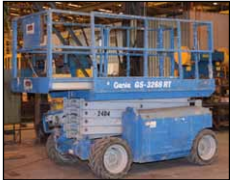
GENIE Platform Scissor Lift