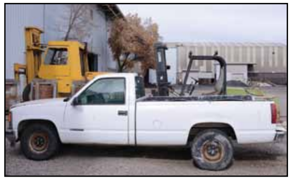
CHEVROLET 2500 P/U Truck