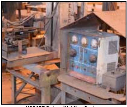
HOBART Rotary Welding System