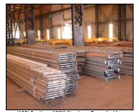
(100) Sections 18"W Aluminum Tower Ladder