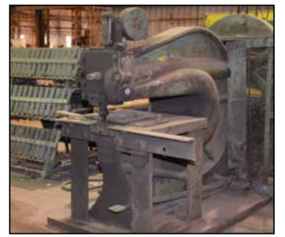
CLEVELAND Mechanical C-Frame Punch