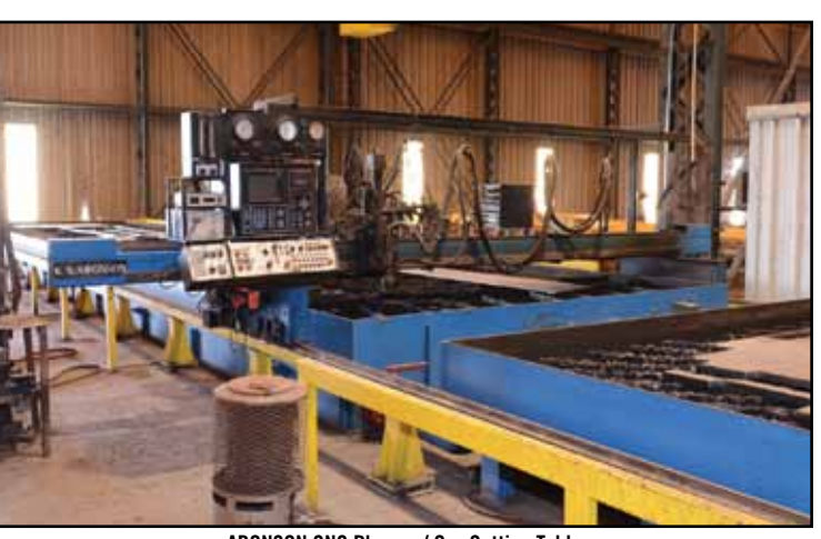
ARONSON CNC Plasma / Oxy Cutting Table