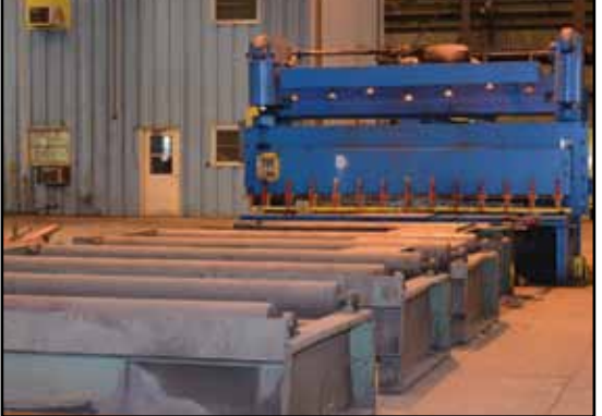
CINCINNATI 12' x 5/8" Hydraulic Power Squaring Shear