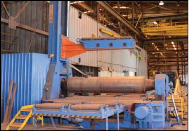
x 10' Hydraulic Plate Bending Rolls

Inspection: Day prior to auction from 9AM - 4PM