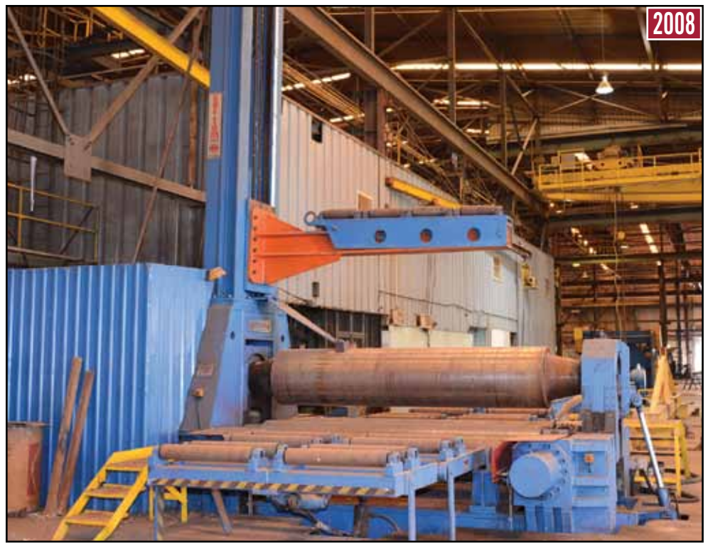
2008 SERTOM 2.75" x 10' Hydraulic Plate Bending Rolls