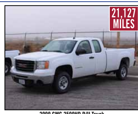
2009 GMC 2500HD P/U Truck