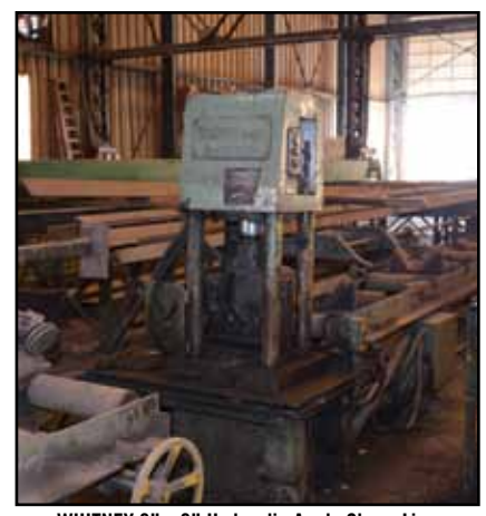
WHITNEY 6" x 6" Hydraulic Angle Shear Line