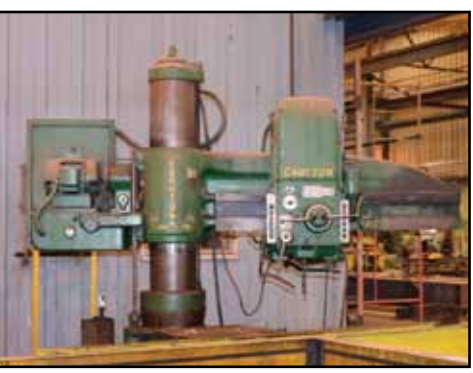
CARLTON 15" x 6' Radial Arm Drill