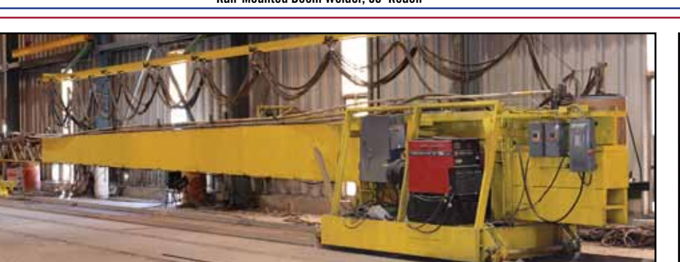
Boom Welder, 52' Reach