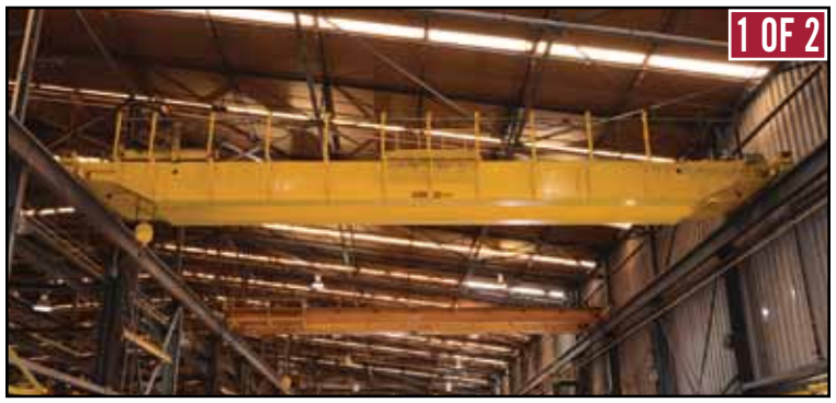
(2) WHITING & Other 20-Ton Bridge Cranes