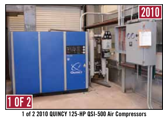
012 2010 QUINCI 123-NF Q31-300 All Complessors