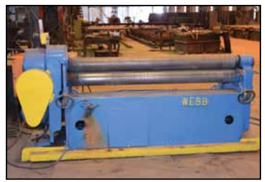
WEBB 6' Mechanical Plate Bending Rolls

2010 GLOBAL FINISHING SOLU-2010 GLOBAL FINISHING SOLU-TIONS (GFS) Paint Kitchen, Model PK-22, (2) GRACO Xtreme X90 • (6) GRACO Extreme • (5) GRACO Drum 2010 QUINCY 125-HP QSI-500 Air Compressor, Model PT35E-BC-5.22-12.00, S/N BU0903240001,