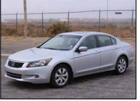
2008 HONDA ACCORD