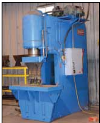
(3) PANDJIRIS & RANSOME Welding Manipulators