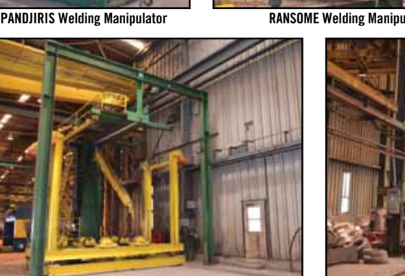
GOURAN Seam Welding Gantry

Welding Gantry System, 15' Be-tween Uprights, Elevating Platform, Lincoln Powerwave AC/DC-1000 Pow-er Supply, Lincoln Idealarc DC-1000 Power Supply, Lincoln Idealarc DC-1000 Power Supply, Lincoln Powerfeed 10A & NA-3S Wire Feeders, Flux Hopper