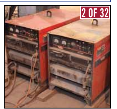
(32) LINCOLN DC-600 MIG Power Supplies