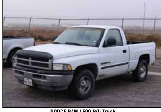
DODGE RAM 1500 P/U Truck