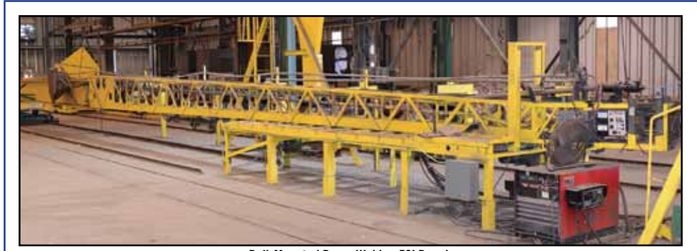
Rail-Mounted Boom Welder, 56' Reach