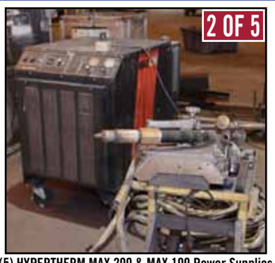
(5) HYPERTHERM MAX 200 & MAX 100 Power Supplies