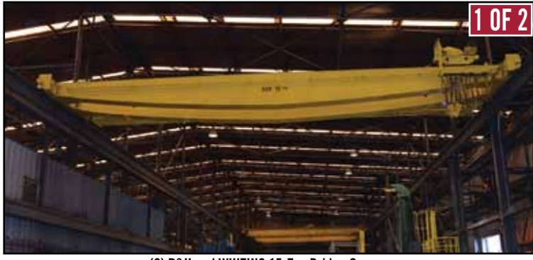
(2) P&H and WHITING 15-Ton Bridge Cranes

(2) 2009 NORTH AMERICAN / DELTA SERVICES 30-Ton Bridge Cranes, S/N DS121808KT02, DS121908KT01 (#25 & #26), Radio Remote Control, R&M Hoists, Purchased New 12/2008 at Cost of Approx. $175,000 Each (Not