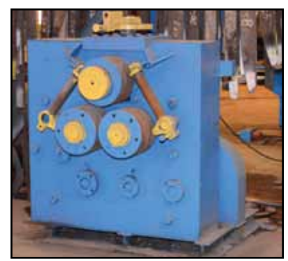
3" x 3" x 3/8" Approx. Capacity JPT Built Mechanical Power Horizontal Angle Bending Rolls