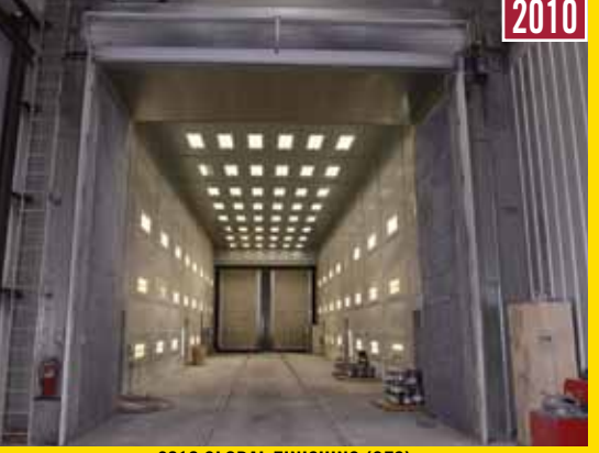
2010 GLOBAL FINISHING (GFS) 24' x 24' x 124' Drive Thru Paint Booth & Oven Line