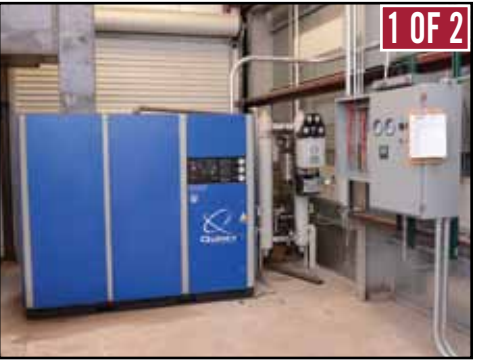
1 of 2 QUINCY QSI-500 Rotary Screw Type Air Compressors