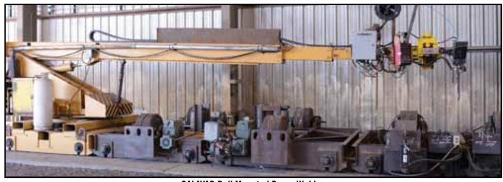
CALAVAR Rail Mounted Boom Welder