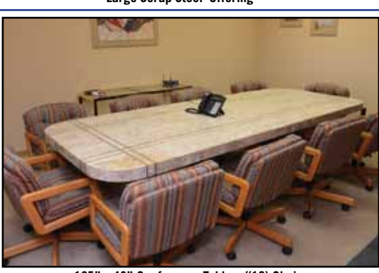
125" x 48" Conference Table w/(10) Chairs