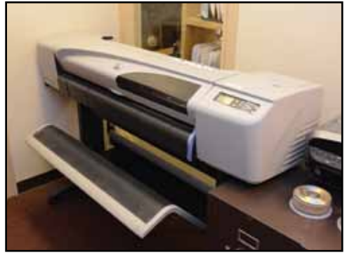
HP Designjet 500 Roll Printer