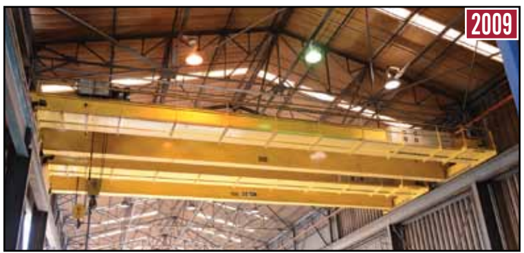
(2) 2009 NORTH AMERICAN / DELTA SERVICES 30-Ton Bridge Cranes