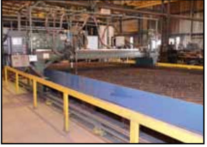
LTEC CM-360 CNC Plasma / Oxy Cutting Table