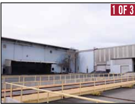
(3) Rail Transfer Tables