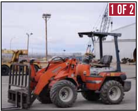
(2) KUBOTA R250 Articulating Wheel Loaders