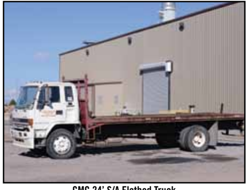
GMC 24' S/A Flatbed Truck