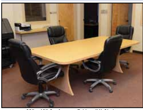
96" x 48" Conference Table w/(4) Chairs