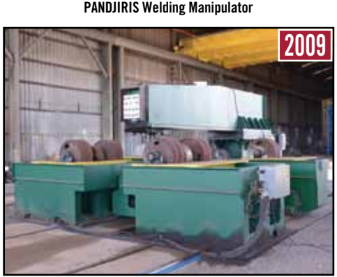
2009 JTP Built Tower Can Fit-Up Press

Welding Gantry System, 175" Between Uprights