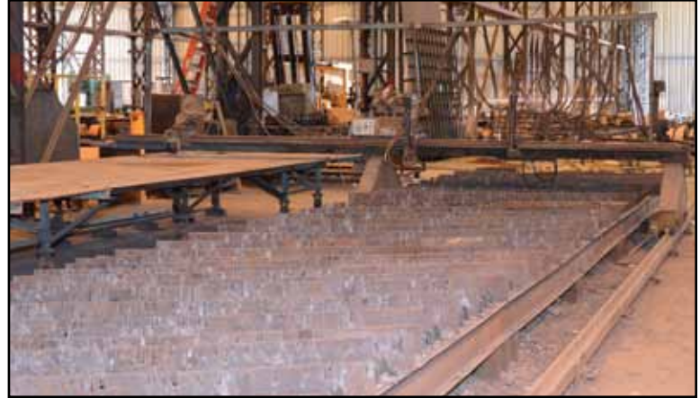
Oxy-Acetylene Shape Cutting Table