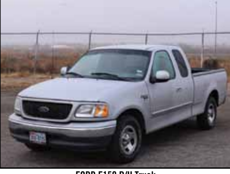
FORD F150 P/U Truck