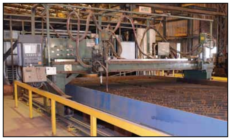
LTEC CM-360 CNC Plasma / Oxy Cutting Table