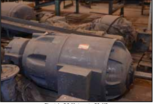
Electric DC Motors to 50-HP