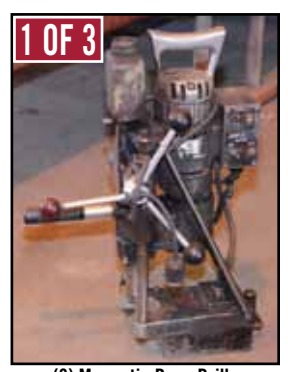
(3) Magnetic Base Drills