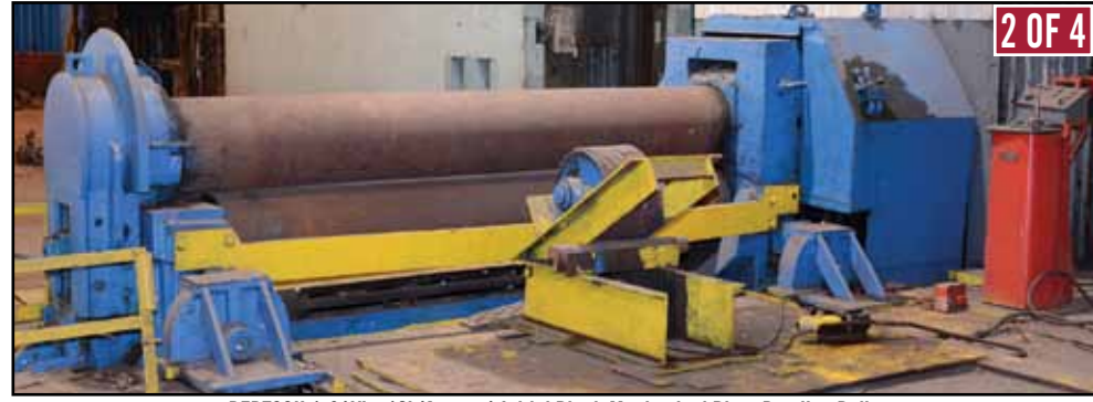
BERTSCH 1-3/4" x 10' (Approx.) Initial Pinch Mechanical Plate Bending Rolls