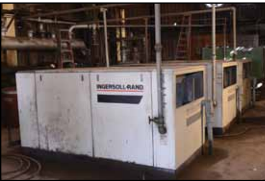
(3) INGERSOLL RAND SSR EP100 100-HP Air Compressors