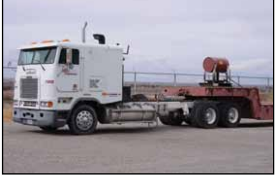
FREIGHTLINER T/A Cabover Truck Tractor