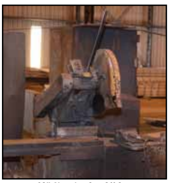
20" Abrasive Cut-Off Saw

CINCINNATI BICKFORD Super Service Radial Arm Drill