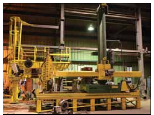
PANDJIRIS Welding Manipulator