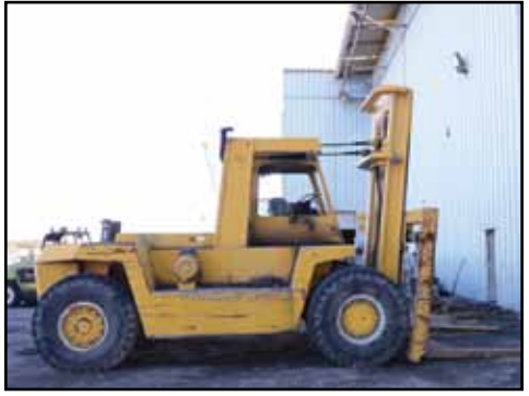
CLARK 52,500-lb. Forklift