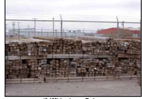
(2,400) Landscape Timbers