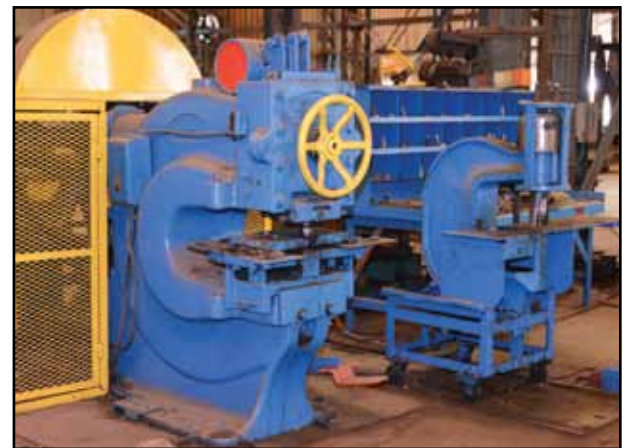
ROCKFORD 100-Ton (Est.) Hydraulic & CLEVELAND Mechanical C-Frame Punches