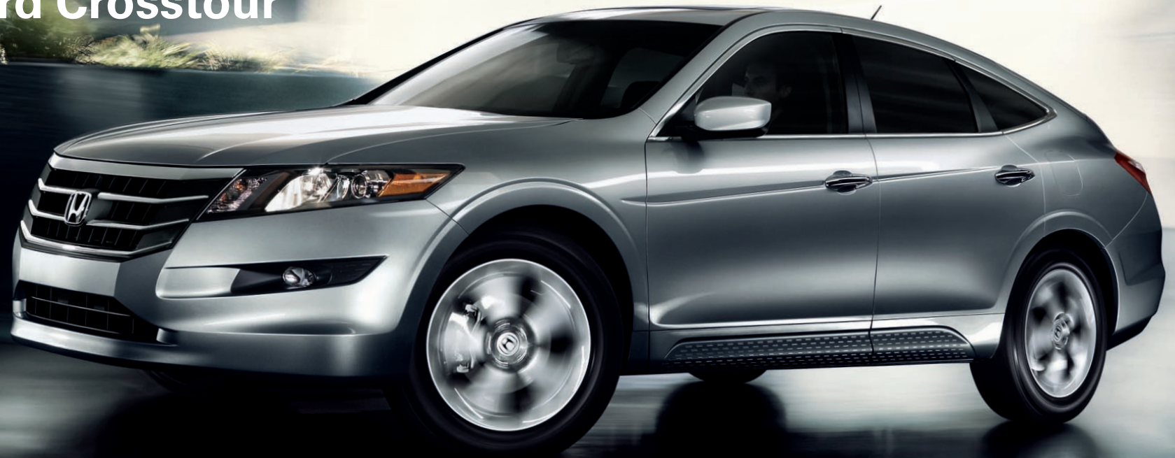
Accord Crosstour EX-L shown in Alabaster Silver Metallic.

Say hello to the modern vehicle. Smooth and sporty, with utility to spare, the all-new Accord Crosstour is a refreshingly new way to think about vehicles. The Crosstour offers a commanding view, and comfortable seating for five. The sloping rear tailgate opens to reveal a spacious cargo area. The 60/40 split rear seatback is spring-activated, and levers can be easily reached from the cabin or from the rear cargo area. 11 A removable, water-resistant under-floor utility box is just right for stashing gear. Plus, the carpeted rear floor panels can be flipped hard-side-up for durability. It's a whole new way to get ahead. crosstour.honda.com