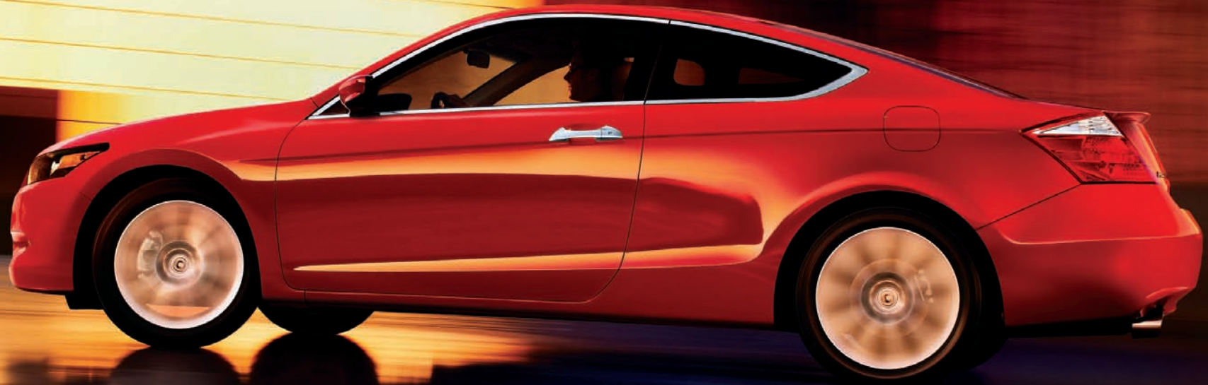
Accord EX-L V-6 Coupe shown in San Marino Red.

An icon of simplicity and style. More than just steel, aluminum, rubber and glass, the Honda Accord is a collection of ideas. Like the belief that being responsible and having fun are not mutually exclusive. Or that the proper hierarchy in automotive design is man first and machine second. Or that innovative engine technology can result in both power and efficiency. Ingeniously simple. Emphatically human. Fantastically fun. The Accord is not just a car, it's a mission statement. accord.honda.com