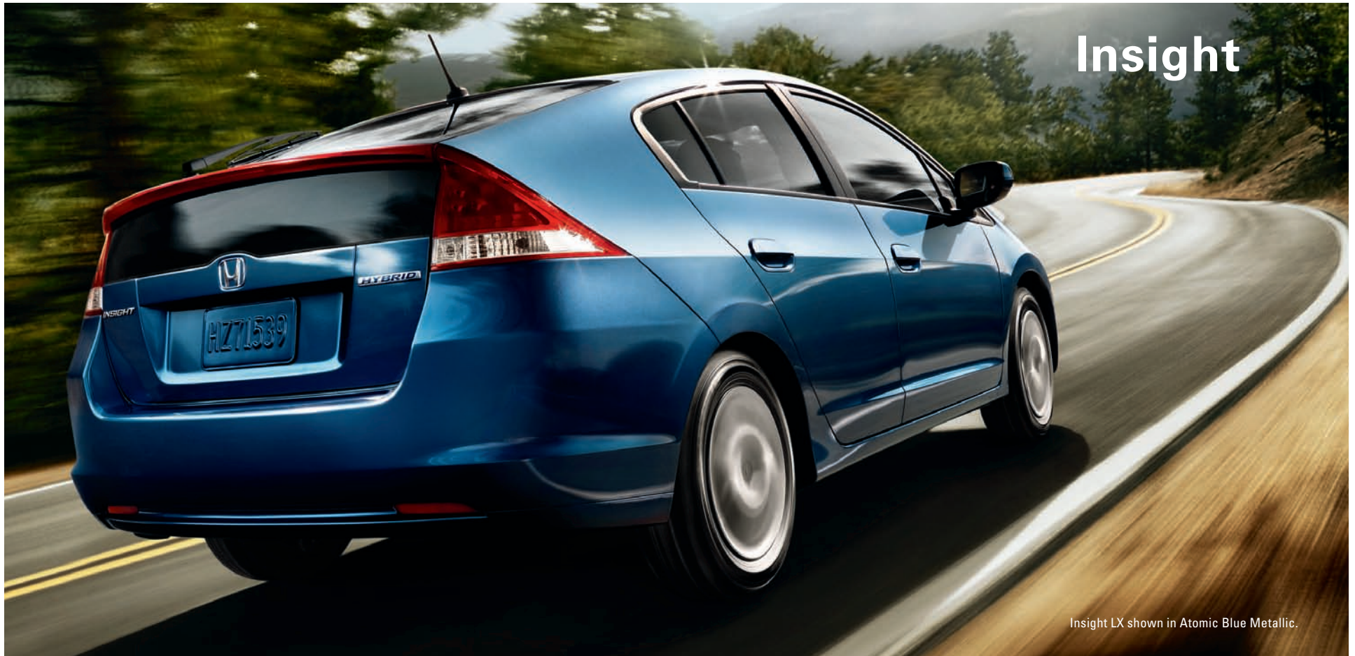
Insight LX shown in Atomic Blue Metallic.

The hybrid for everyone is here. Go on, take a closer look. Get personal with the car made with blue skies in mind. Inspect its affordable price tag, technological features like Eco Assist™ and impressive 43 mpg on the highway. 1 Just a moment with this feature-rich hybrid is all you need to understand how the greater good doesn't need to come at a greater sacrifice. Meet the Insight and see how affordability, fun and style come to life in the car designed and priced for us all. insight.honda.com