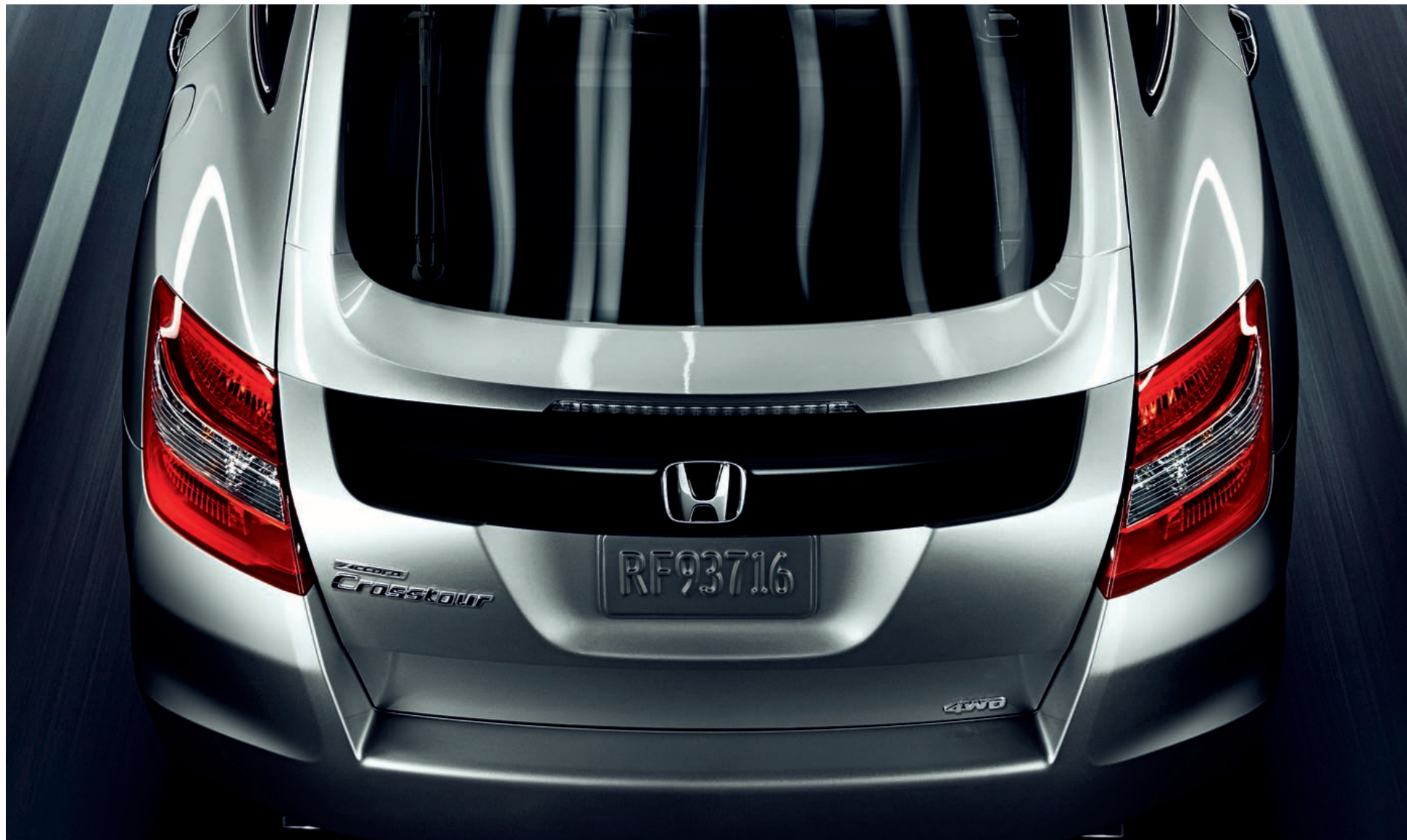
2010 Honda Cars and Trucks