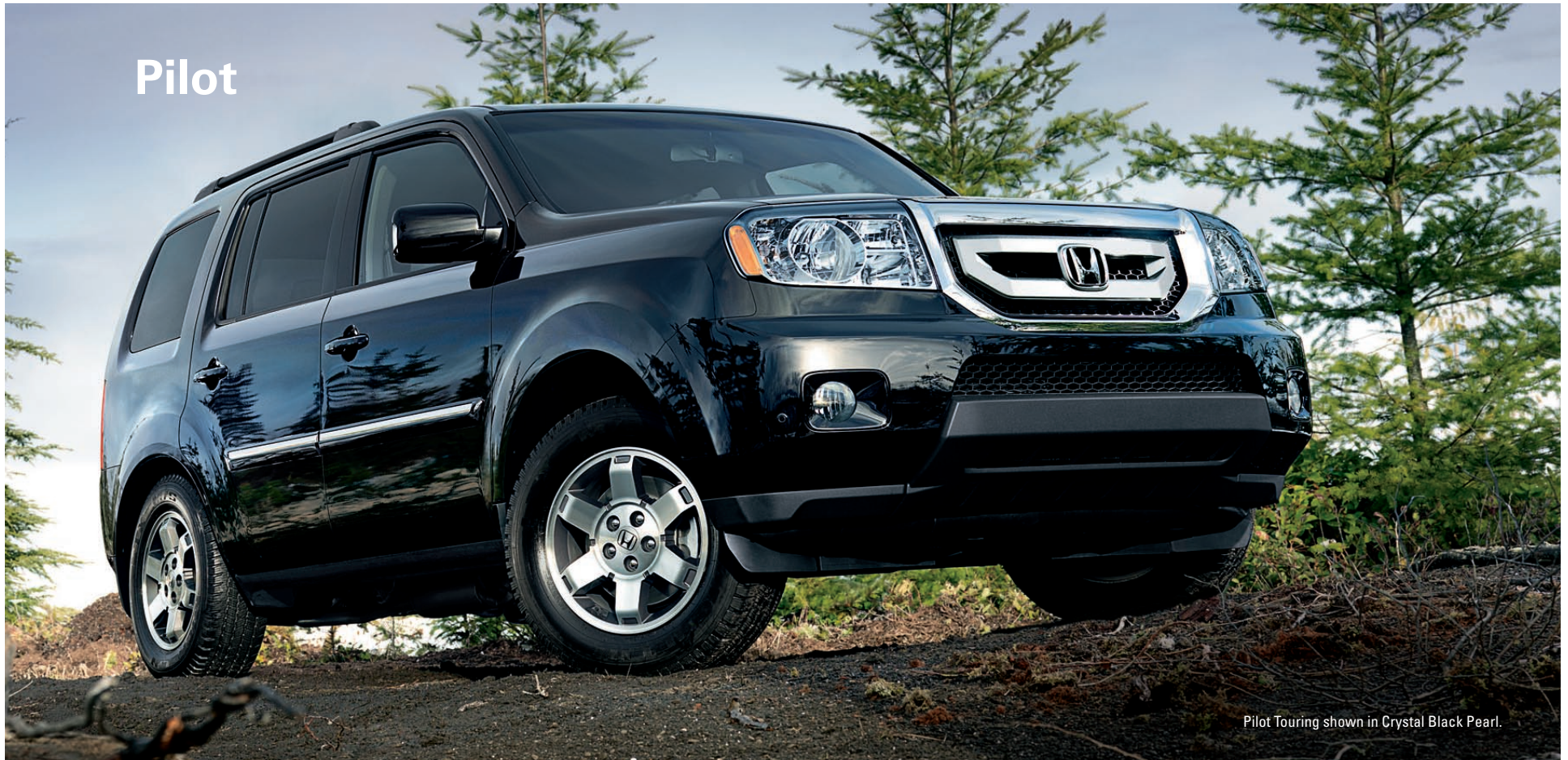
Pilot Touring shown in Crystal Black Pearl.

Ride Ready. It's all about discovering the moment. The instant where everything comes together perfectly. Achieving it is easier when you're ready for anything. With a powerful 3.5-liter V-6 engine, three comfortable rows of seats and up to 87 cu ft of cargo space, 11 the Pilot is definitely your tool of choice. And if your style leans more toward luxury, the Touring model adds features like a power tailgate and navigation system. 8 pilot.honda.com