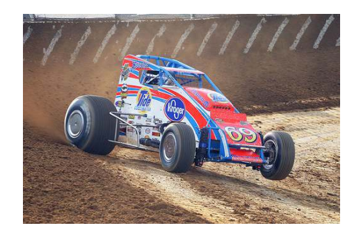
2009 F-5 Only a handful of races on this car. Never crashed. We ran a few races in 2010 with it and 2 races with it in 2011. Has been a good car the few times we have run it.

Frame and Body: $1450 Basic Kit: $1900 Deluxe Kit: $2900 Roller: $9,700