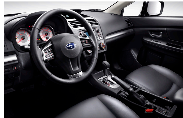
Impreza 2.0i Limited 5-door with Black Leather.