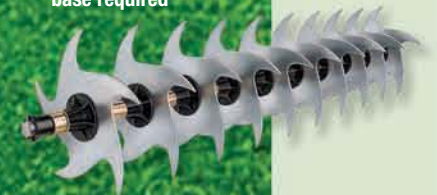
SMARTLINK™ SPIKE AERATOR 45-0458 Ace no. 7207459 • 10 spike discs, quick attach, base required