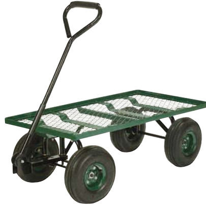
FLAT BED GARDEN CART 6060024