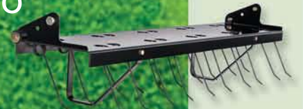
SMARTLINK™ DETHATCHER 45-0457 Ace no. 7204662 • 20 tines, quick attach, base required