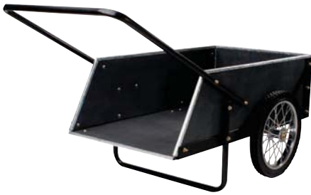
PRECISION® YARD CART WC07