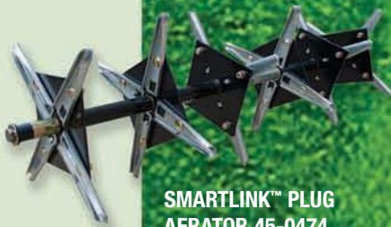
SMARTLINK™ PLUG AERATOR 45-0474 Ace no. 7215478 • 24 tines, 3" depth, quick attach, base required