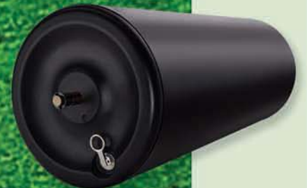
SMARTLINK™ ROLLER 1 45-0459 Ace no. 7204670 • 14" x 42", quick attach, base required

1 platform, 4 easy attachments, and a compact storage design – SmartLINK™ starts with a master platform (base) in which a plug aerator, spike aerator, tine dethatcher, and lawn roller can be quickly swapped in and out depending on the task at hand. This system allows convenient storage design and uses considerably less space than having the tools as separate attachments. The SmartLINK™ system by Agri-Fab® is truly changing the way the world changes attachments.