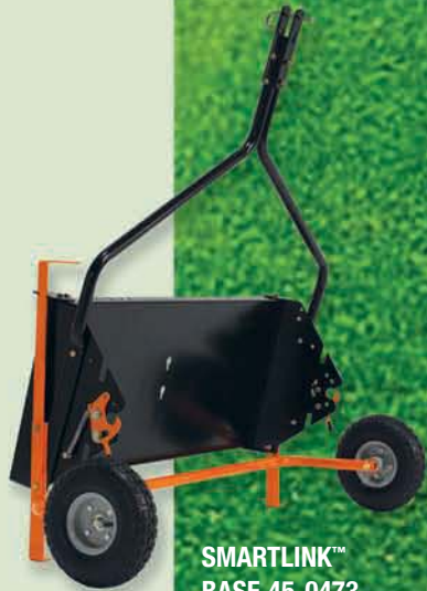
SMARTLINK™ BASE 45-0473 Ace no. 7215460