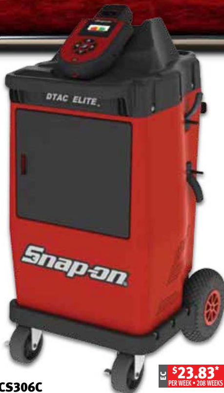
EECS306C $3,799.99 $3,419.99 D-TAC™ Elite Diagnostic Tester And Charger