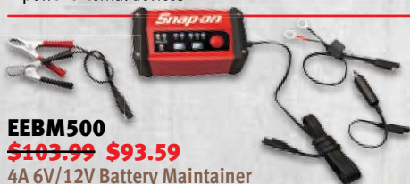
EEBM500 $103.99 $93.59 4A 6V/12V Battery Maintainer