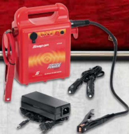
EECS309B $299.99 $269.99 12V Portable Booster Pack