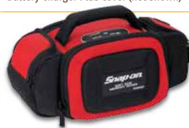
EESM500 $164.99 $148.50 Soft-Side Memory Saver