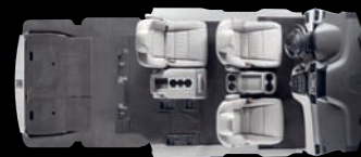
3-passenger cargo mode 2*

With 3 passengers, there's still plenty of room for a surfboard or ladder.