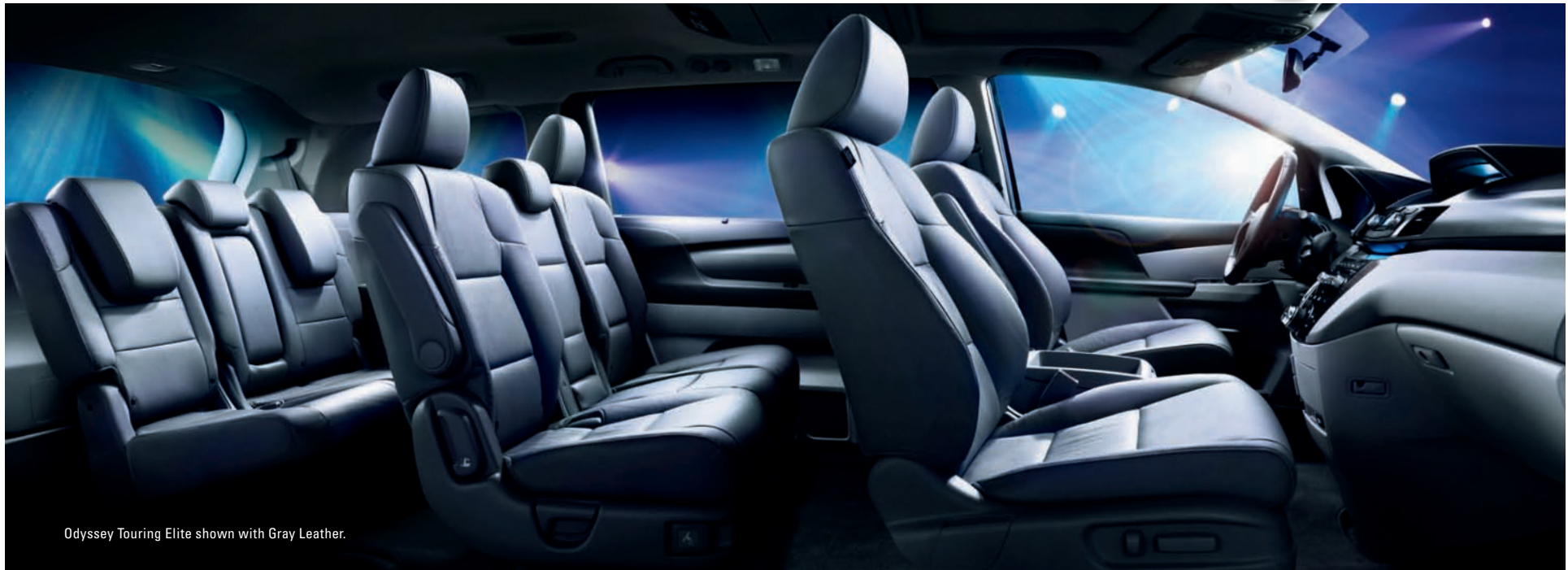
Odyssey Touring Elite shown with Gray Leather.