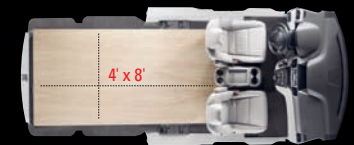
2-passenger cargo mode

4' x 8' sheets of plywood are a breeze to transport.