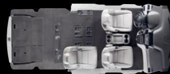
3-passenger cargo mode

The incredibly versatile interior easily adjusts to meet your needs.