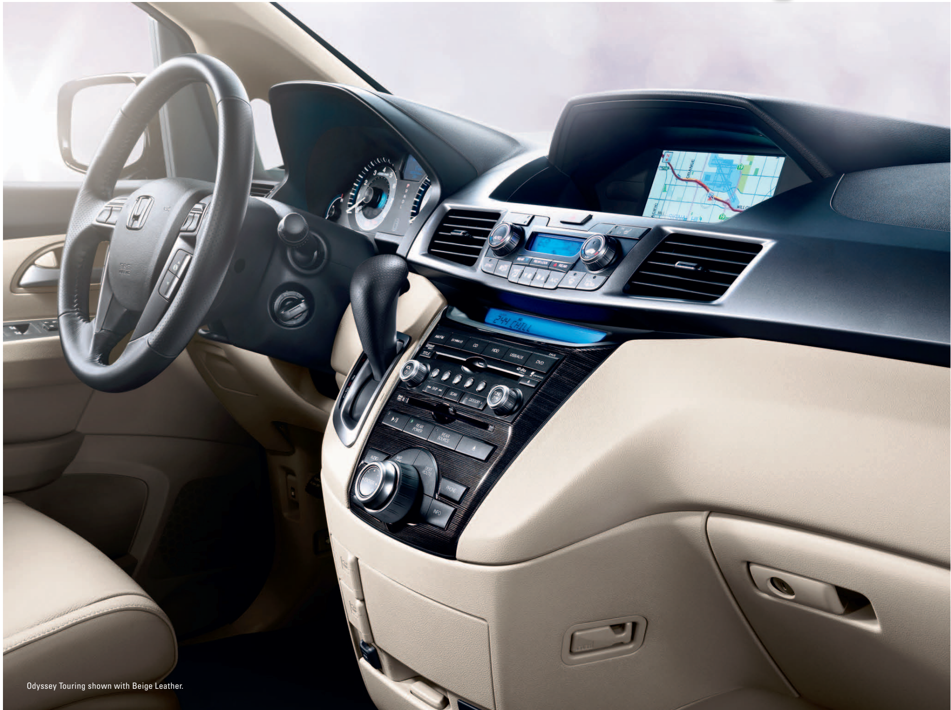
Odyssey Touring shown with Beige Leather.