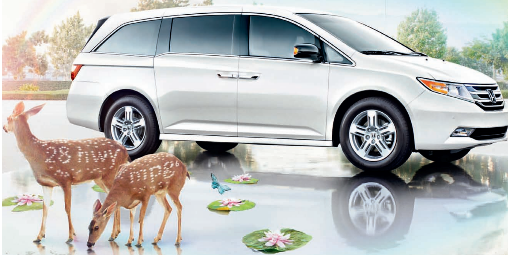
Odyssey Touring Elite shown in White Diamond Pearl.

Every Odyssey is equipped with a powerful 3.5-liter V-6 engine with Variable Cylinder Management™ (VCM®) for brisk acceleration as well as maximized mpg. 6 Combine that with a 6-speed automatic transmission, and Odyssey Touring models achieve an EPA-estimated 28 highway mpg. 6 It's the kind of efficiency most vans only dream of.