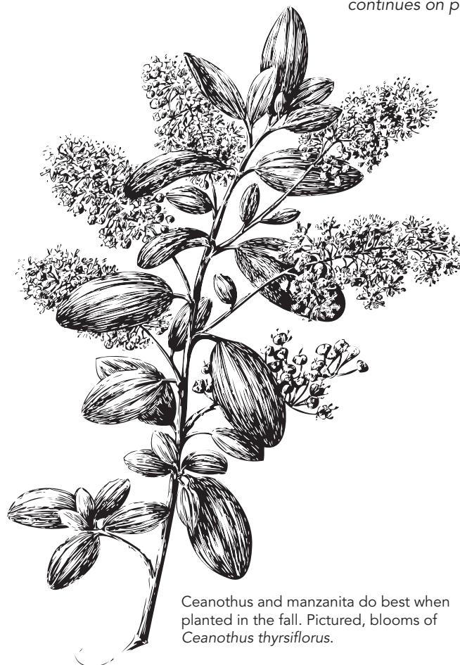
Ceanothus and manzanita do best when planted in the fall. Pictured, blooms of Ceanothus thursiflorus .