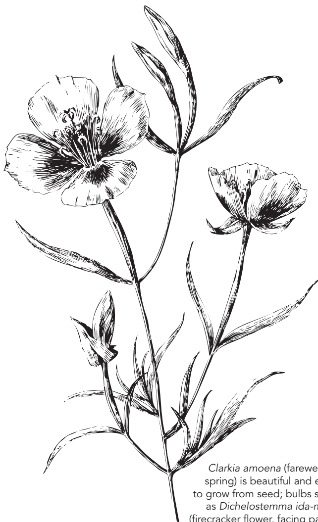
Clarkia amoena (farewell to spring) is beautiful and easy to grow from seed; bulbs such as Dichelostemma ida-maia (firecracker flower, facing page) yield spectacular blossoms.

The Poppy Print is the membership newsletter of the Theodore Payne Foundation for Wild Flowers and Native Plants, Inc. , a nonprofit organization. The Foundation's mission is to promote and restore California landscapes and habitats, to propagate and make available California native plants and wildflowers and to educate and acquire knowledge about California flora and natural history. The Foundation operates a nonprofit nursery where native plants are grown and sold to the public year round. Wildflower and native plant seeds, horticultural and botanical books and information are available at our Sun Valley headquarters and by mail.