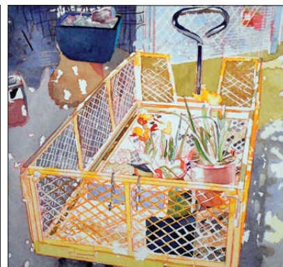
Artworks by Laura Stickney. Clockwise from top: Seed Packet Artist's Book , 2012, mixed media, 3 3/4" x 4" x 3/4" (closed), 3 3/4" x 43" (expanded); Plant Cart , 2012, watercolor on archival paper, 8" x 8"; Matilija Pod , 2012, oil paint on Polaroid metal film canister, 5 1/4" x 3 1/2" x 1/2"