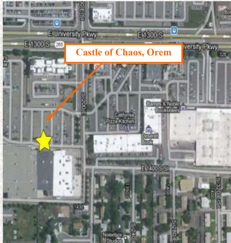
Castle of Chaos.....168 E University Parkway, Orem UT

Head West on 200 N. Turn left onto 400 E, and head south (1 mile) Turnright on 1600 N in Orem (stop light), and get into the left turn lane. Turn left on State, and head south (5 miles) Turn right onto University Parkway, and head west. Turn left on 200 E, and head south. Turn into the parking lot of the strip mall on your right. The Castle of Chaos is the second store from the end on your right (you should see the sign).