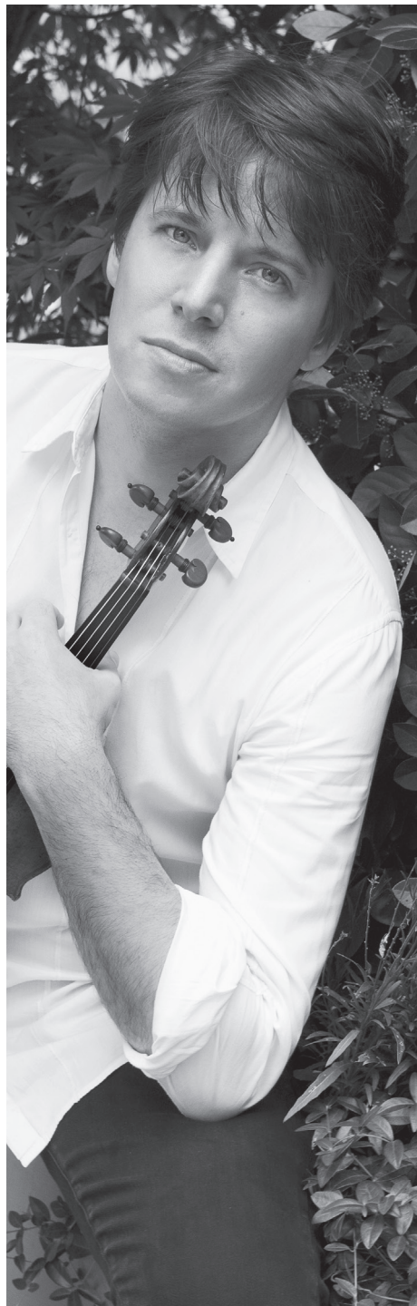
JOSHUA BELL VIOLIN

Joshua Bell is one of the most celebrated violinists of his era. His restless curiosity, passion and multi-faceted musical interests have earned him the rare title of “classical music superstar.” Recently named the music director of the Academy of St Martin in the Fields, Bell is the first person to hold this post since Sir Neville Marriner formed the orchestra in 1958. Their first recording under Bell’s leadership of Beethoven’s Fourth and Seventh symphonies from Sony Classical debuted at #1 on the Billboard Classical chart. Bell’s recording of the Bach violin concertos with the orchestra will be released Sept. 29, 2014 to coincide with the airing of the HBO documentary special Joshua Bell: A YoungArts MasterClass .