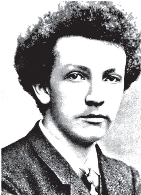
RICHARD STRAUSS (1864-1949)

Though Glazunov composed in most every major classical form except opera, his only concerto was for the violin. It demonstrates his deep feeling for European romanticism and his admiration of Franz Liszt, from whose template he adapted a structure of three movements played without pause and a rich olio of virtuoso effects; without a cadence to separate them, the first and second movements give the impression of a single movement, with the second movement taking the place of the first movement's development section. The concerto's slow interior section is broken by an exciting, breakneck theme. In the third-movement finale, a sporting "hunt" theme is resolved in a blaze of bravura playing.