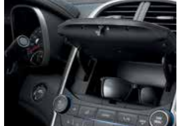
Convenient hidden storage area behind the touch-screen.

CONVENIENCE THROUGHOUT Malibu features an easily accessible hidden storage area behind the available 178 mm (7-in.) diagonal colour touch-screen. You can also organize the icons on the screen to best fit your needs. The available 120-volt AC household power outlet keeps your portable devices charged and ready. The centre console includes a pair of cupholders, an armrest and dedicated pockets for two mobile phones.