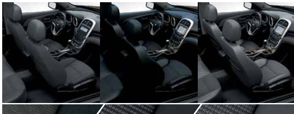
Jet Black/Titanium-Colour Cloth 1