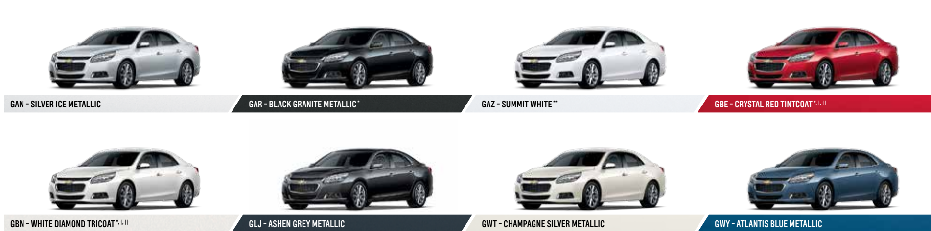
GAN - SILVER ICE METALLIC