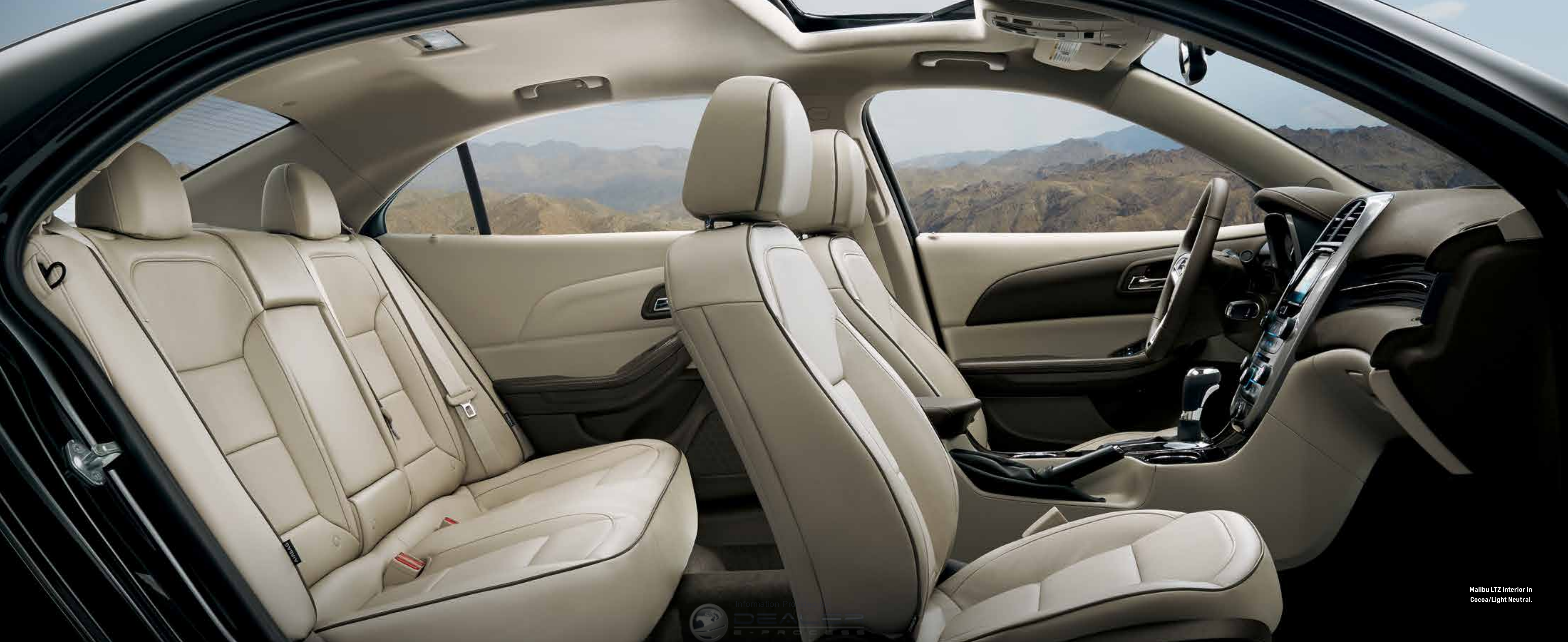
Malibu LTZ interior in Cocoa/Light Neutral.