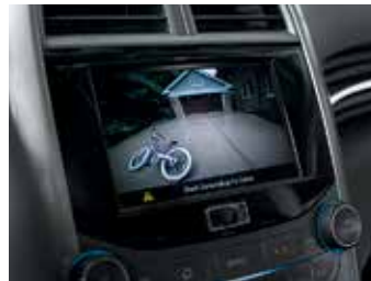
Available rear vision camera.