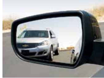
Available Side Blind Zone Alert 1