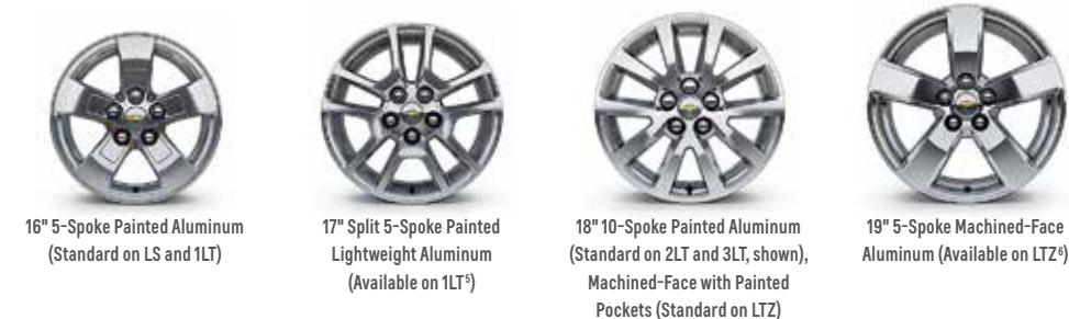
16" 5-Spoke Painted Aluminum (Standard on LS and 1LT)