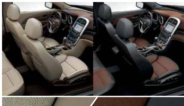
Cocoa/Light Neutral Leather Appointments/Vinyl Perimeter Accents 3,4