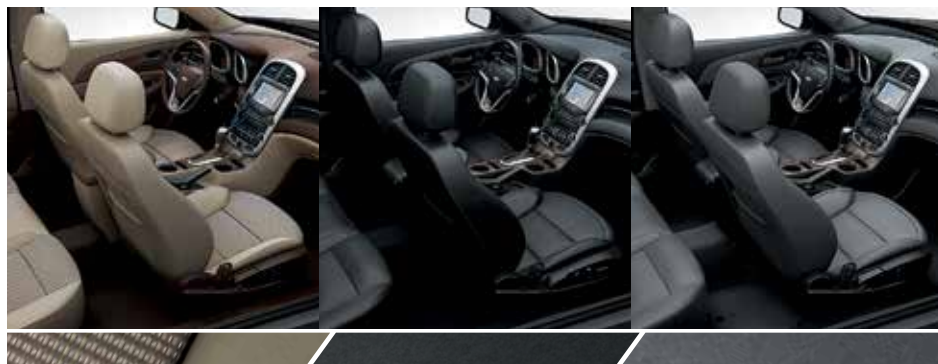
Cocoa/Light Neutral Premium Cloth/Leatherette Bolsters 2