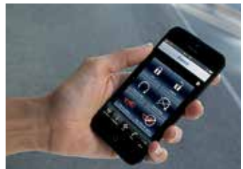
Available OnStar RemoteLink 7 mobile app.