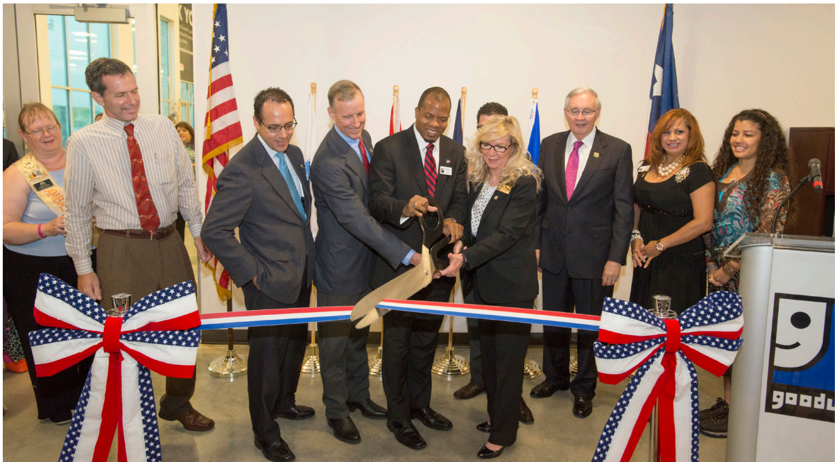
TOP The Veterans Resource & Career Center grand opening took place on June 25, 2014.

Goodwill has a long and proud history of serving our country's Veterans and their families as they transition to civilian life.