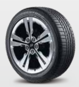
Veloster with Tech Package 18" Rim