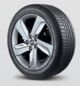
Veloster Turbo 18" Rim

Lettering denotes available exterior and interior colour combinations.