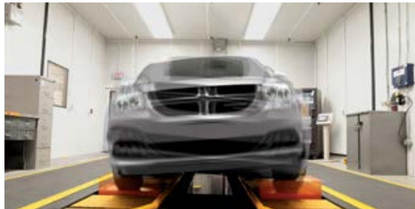
FOUR-POST SHAKER — SUSPENSION TESTING