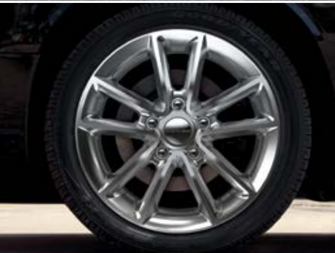
17-inch Satin Carbon aluminum (standard on SE 30 th Anniversary Edition* and R/T)