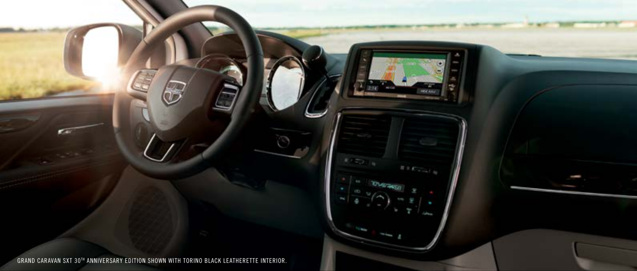
GRAND CARAVAN SXT 30 TH ANNIVERSARY EDITION SHOWN WITH TORINO BLACK LEATHERETTE INTERIOR.

INTUITIVE, DRIVER-FRIENDLY TECHNOLOGY. It starts with the standard Uconnect ® 130 radio/CD player with auxiliary jack and builds up to the available Uconnect 430N system with 6.5-inch touch screen and Garmin ® Navigation that lets you launch a playlist from your MP3 player, request directions and make a call, all without taking your hands off the wheel. From the simple to the fully advanced, Grand Caravan and Uconnect offer technology that keeps you connected.