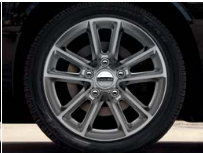
17-inch polished aluminum with Satin Carbon pockets (standard on SXT 30 th Anniversary Edition)