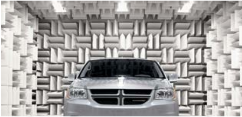
ANECHOIC CHAMBER — NOISE, VIBRATION AND HARSHNESS (NVH) TESTING