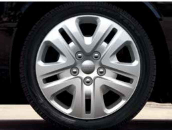
17-inch wheel cover (standard on AVP and SE)