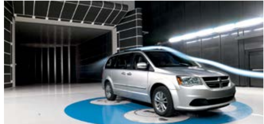
WIND TUNNEL TESTING