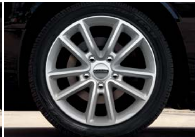
17-inch Tech Silver aluminum (standard on SXT)