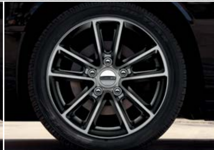
17-inch polished aluminum with Gloss Black pockets (included in Blacktop Package on SE and SXT)