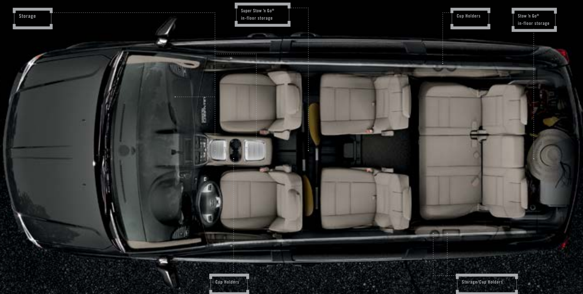
GRAND CARAVAN SXT SHOWN WITH SANDSTORM CLOTH INTERIOR.