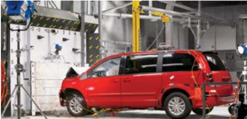
CRUSH ZONE TESTING