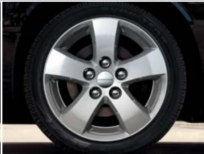
17-inch aluminum (optional on SE)