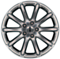
18" Polished Aluminum Included with Premium Package