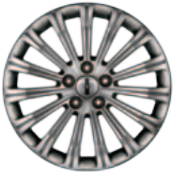
18" Premium Painted Aluminum Standard

Voice-activated Navigation System with SD card for map and POI storage; integrated SiriusXM Traffic and Travel Link with 6-month trial subscription (includes THX II Certified Audio System and HD Radio Technology) 9