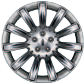
20" Polished Aluminum Available; Included with Limited Edition Package