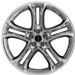
22" Polished Aluminum Available