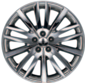
20" Chrome-Clad Aluminum Available