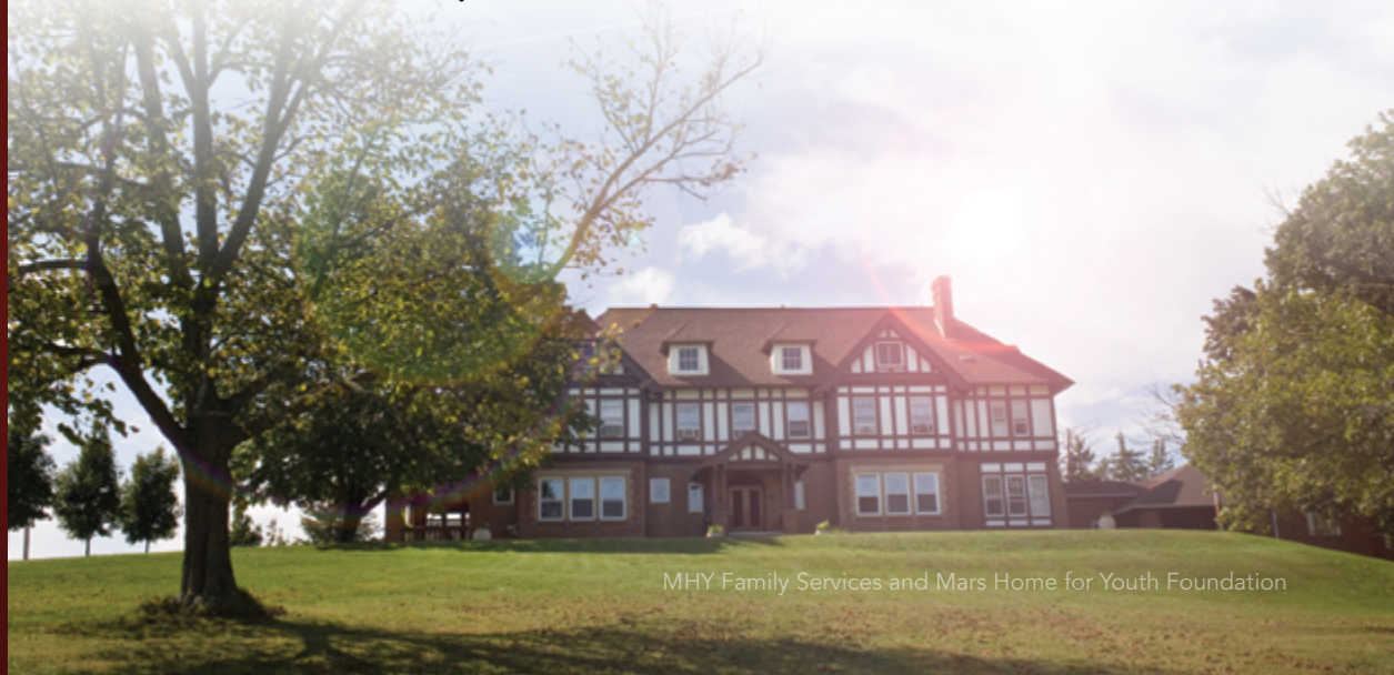
MHY Family Services and Mars Home for Youth Foundation

Energy, sparked by staff and fanned by our clients, is illuminating a path to a brighter tomorrow for MHY and the youth and families we serve.