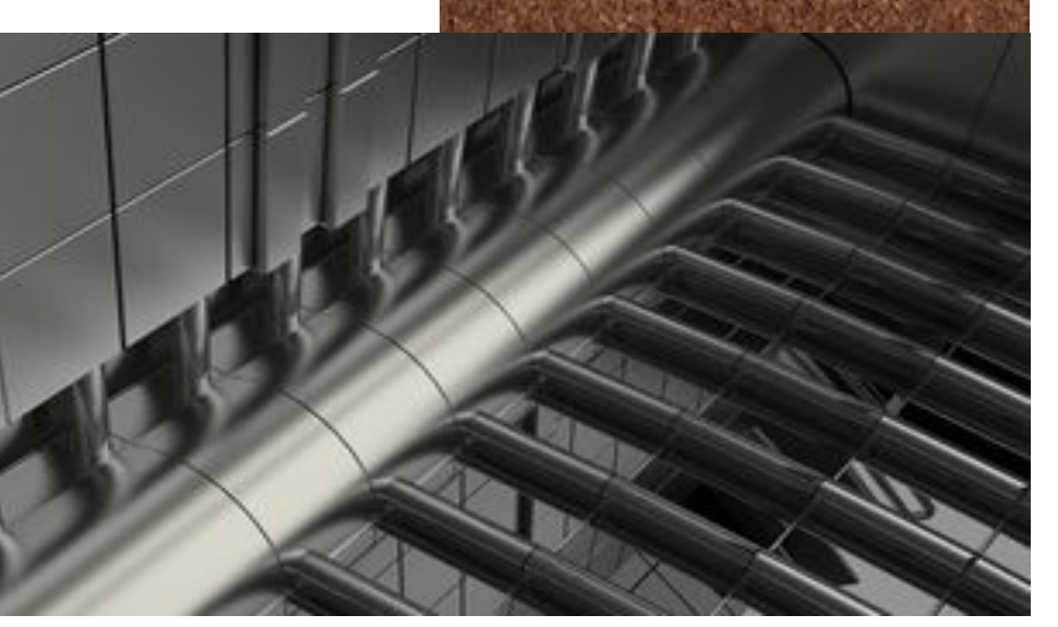
Building model, texture, rer