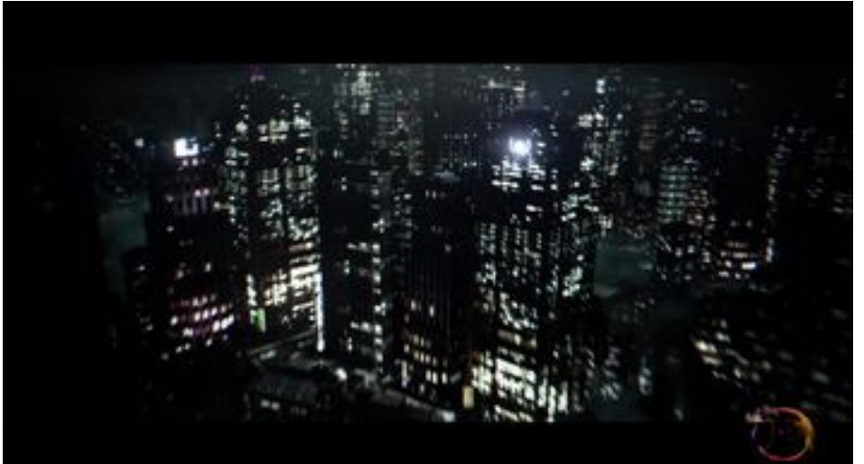
Aston Martin Com I light the buildings scene.