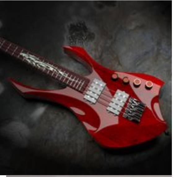
Crow Bass Guitar Modeled, textured, scene layout and re