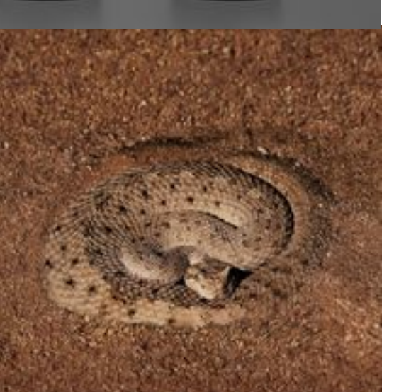
Snake modeled, mapping animation, renderi