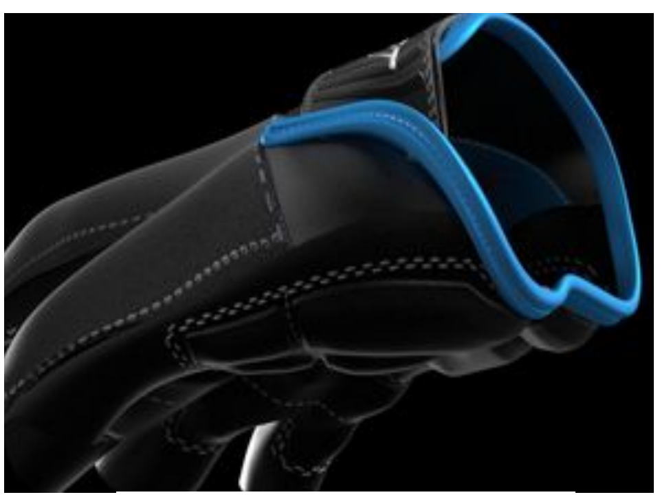
Specialized Cycling Modeling, texture, rendering.