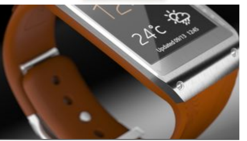
Samsung Gear S2 This was modeled a modo. I also textur the scene.