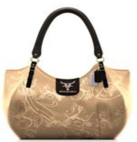
Fashion Handbag modeling, texturing animation.