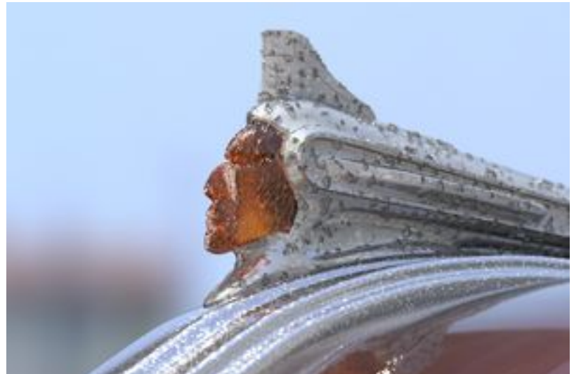
Hood Orniment Model, texture, ligh