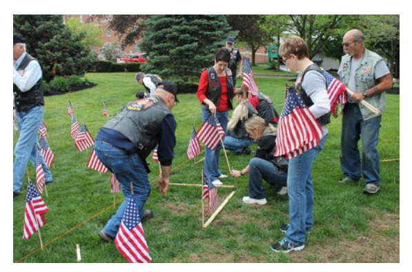
Members of the Wellsville American Legion and Auxiliary, the Legion Riders, and the Sons of the American Legion, teamed up with JMH to put up a Field of Flags in memory of deceased veterans.

The proceeds from these annual events are earmarked for community wellness projects. Last year, the Wellness Committee was able to donate $10,000 in lumber to repair two bridges along the WAG Trail, a multi-use recreational trail that is open to the public. The repair of these bridges means that the trail now extends from the Village of Wellsville to the Pennsylvania state line.