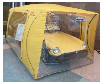
About $1,300 for inside storage, framed models for drive in access, no window models for outside use.

Filtered air pumped into the storage tent using a small light bulb amount of energy fan.