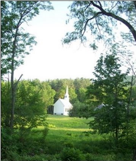
Little White Church