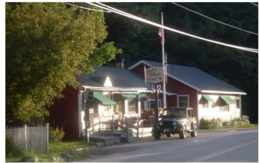
Eaton Village Store & Post Office