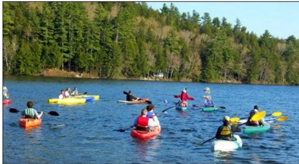
Boating on Crystal Lake