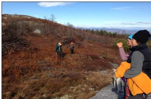
Hiking on Foss Mountain