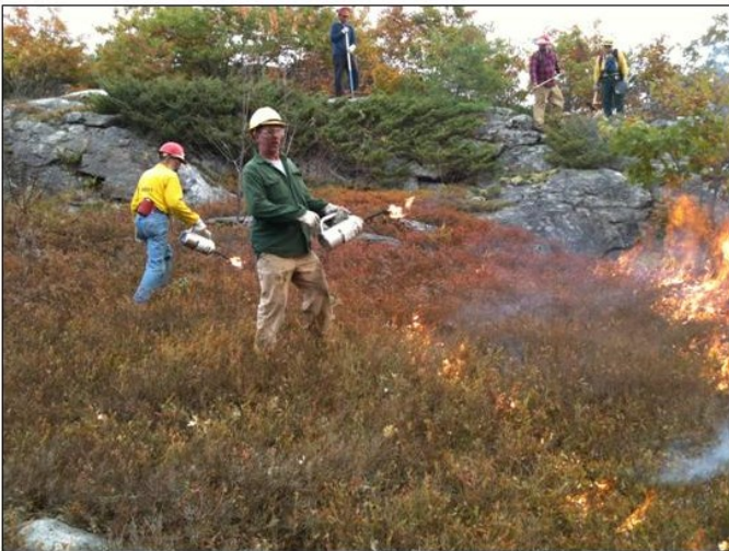
Managing Foss Mountain Blueberries