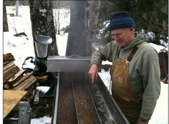
Maple Syrup anyone?