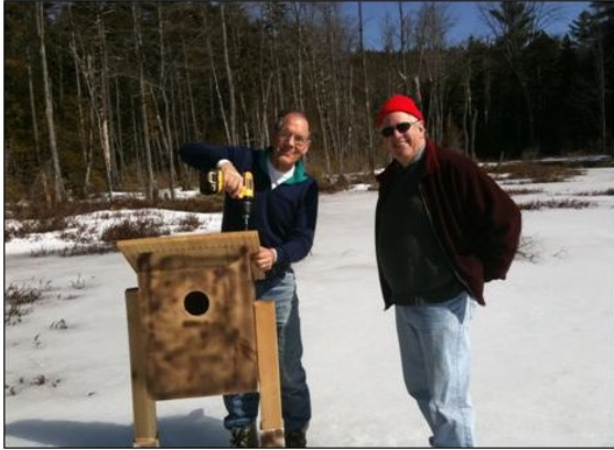
Spring prep for the birds