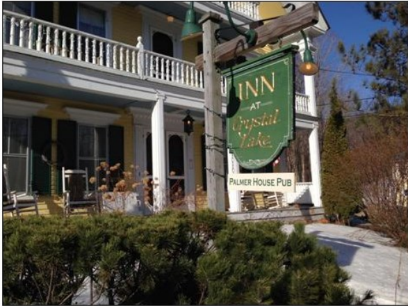
Inn at Crystal Lake