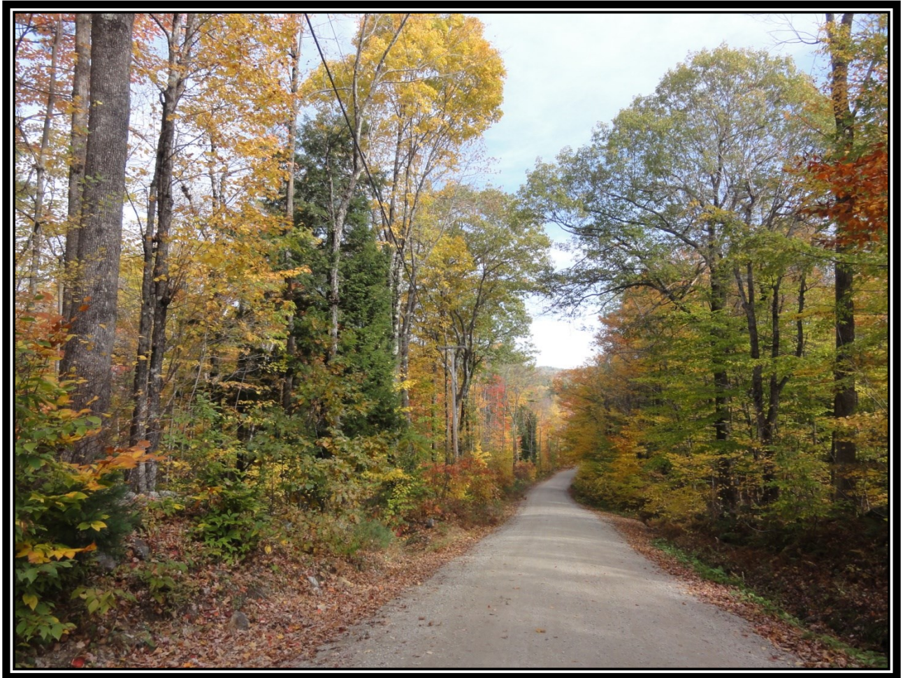
Foss Mountain Road