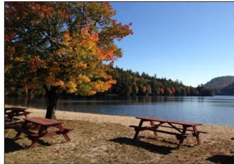
Autumn picnic time