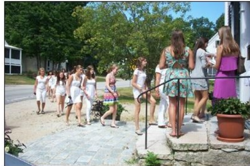
Camp Waukeela Girls at the Little White Church