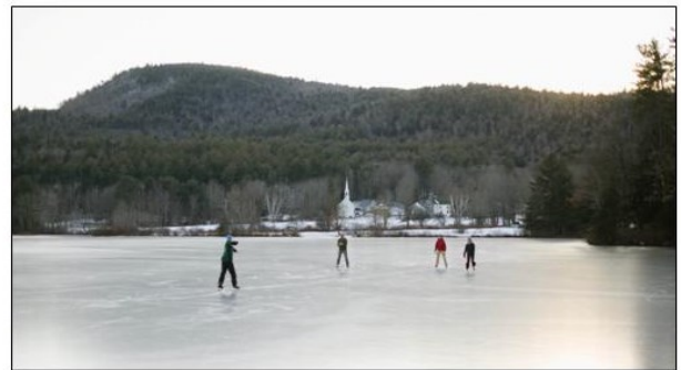
Skating on Crystal Lake