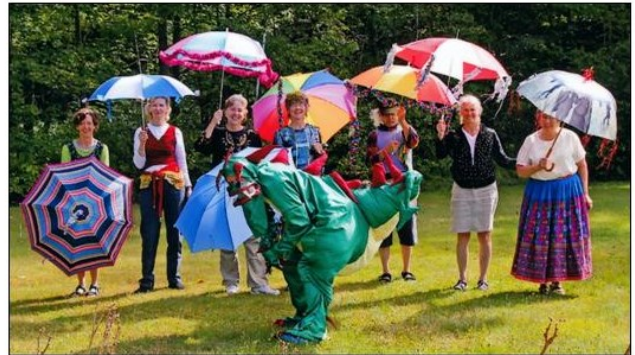
Eatonfest Umbrella Brigade