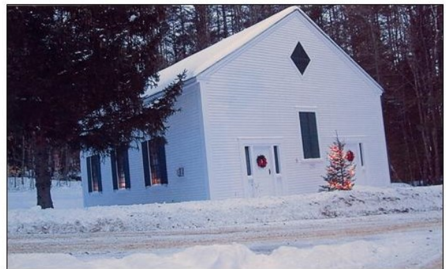
South Eaton Meetinghouse