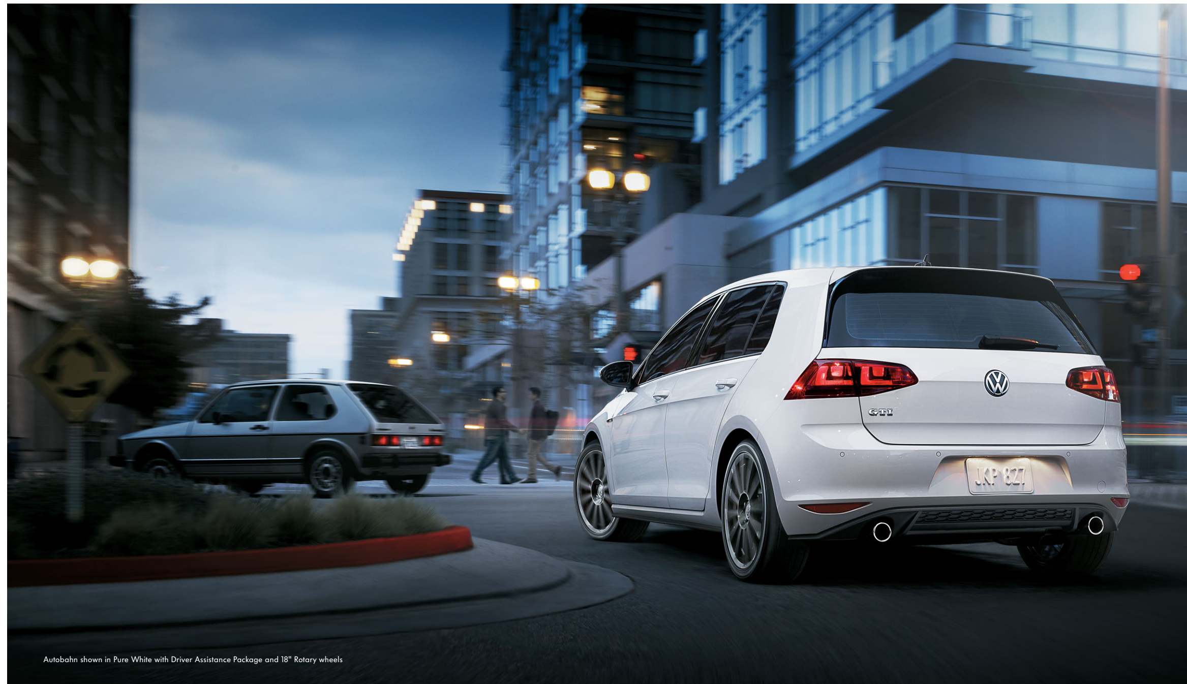
Autobahn shown in Pure White with Driver Assistance Package and 18" Rotary wheels