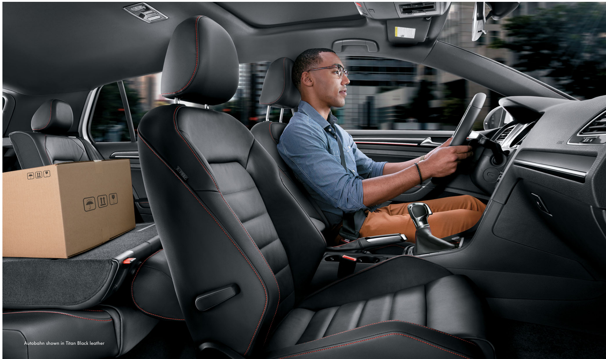
Autobahn shown in Titan Black leather