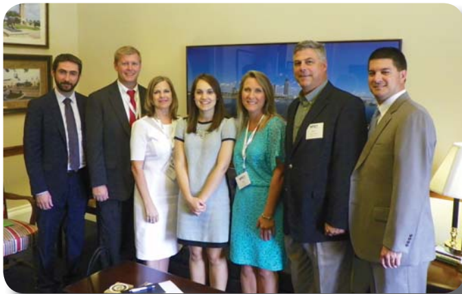
Congressman Byrne's Office