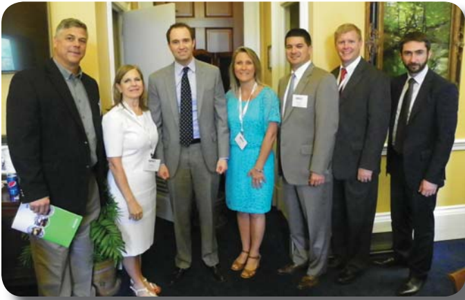
Congressman Aderholt's Office