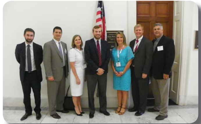
Congressman Palmer's Office