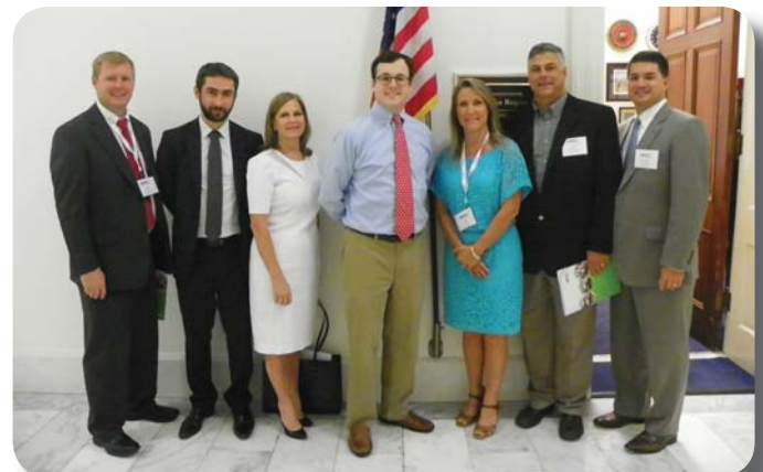
Congressman Rogers' Office