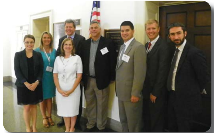
Congressman Brooks' Office