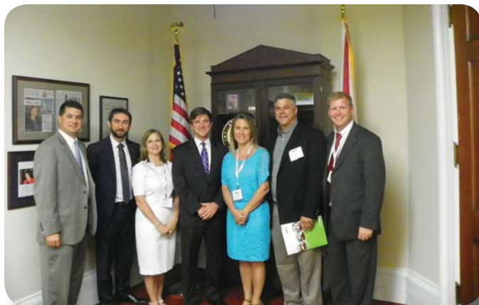
Congresswoman Roby's Office