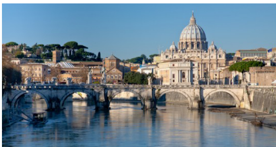
The bridge that crosses the Tiber River is a well-worn path. All those who would come to give honor to Rome must first cross this river. Below are masses of people making their way to St. Peter’s Basilica to honor the Pope of Rome.

was during this time that the Protestant Reformers began to identify the Papacy as the antichrist. The Anglican Church was also excommunicated by Rome in 1570. And since this time hundreds of churches have sprung up outside the fellowship of Roman Catholicism. Rome knows this and she has been anxious to bring all of these religious bodies back under one roof. Rome’s plan has nearly accomplished this through ecumenism. One by one all the churches have been crossing the Tiber River in their journey “back home” to Rome.