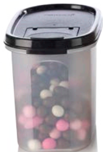
Oval 2 12 x 18,5 cm