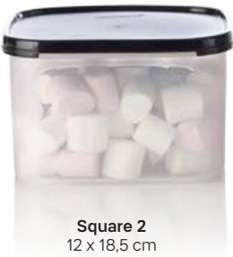
Square 2 12 x 18,5 cm