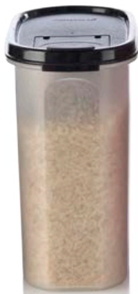
Oval 3 17 x 18,5 cm