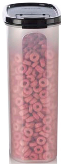
Oval 4 23 x 18,5 cm