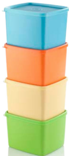
114504 Four Large Square Rounds (800 ml)

Designed to be modular, stackable and space saving.