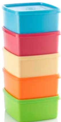
111944 Five Small Square Rounds (400 ml)