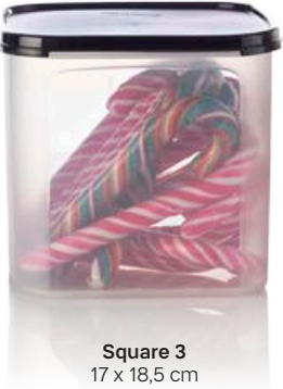
Square 3 17 x 18,5 cm