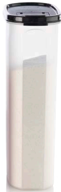
Oval 5 28 x 18,5 cm