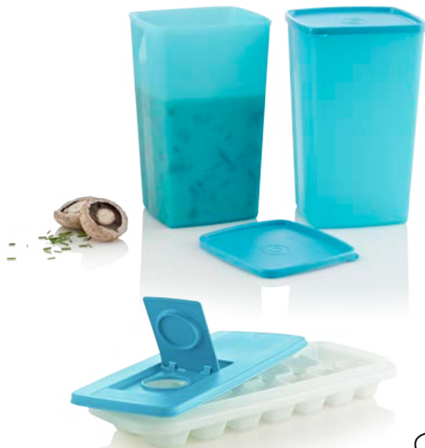
114471 Ice Cube Tray (300 ml) R110