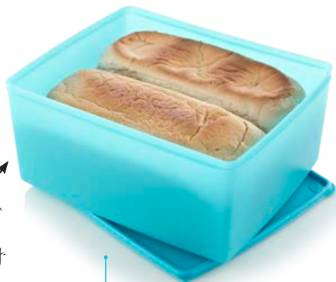
114661 Stor n Freeze (6,5 L) R255