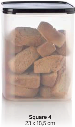
Square 4 23 x 18,5 cm