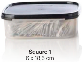
Square 1 6 x 18,5 cm

Shape makes it easy to scoop contents out