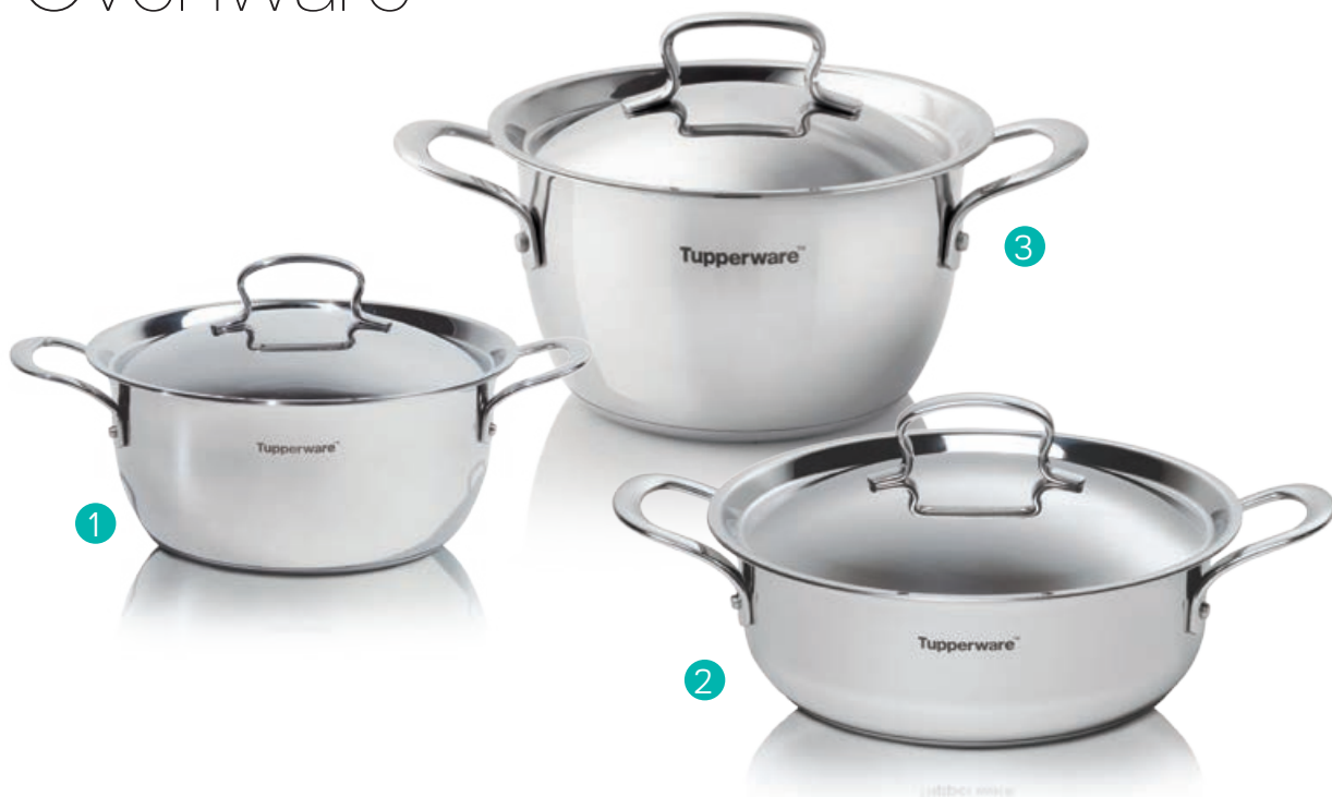
1 055267 Mirage Casserole (2,5 L) R1 410