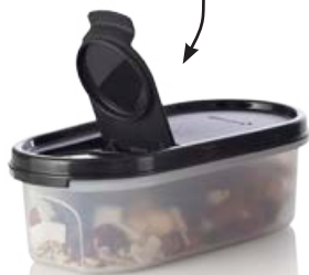
Oval 1 6 x 18,5 cm