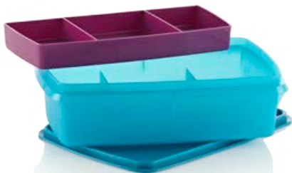
117923 Stow n Go R155