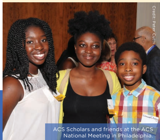
ACS Scholars and friends at the ACS National Meeting in Philadelphia.