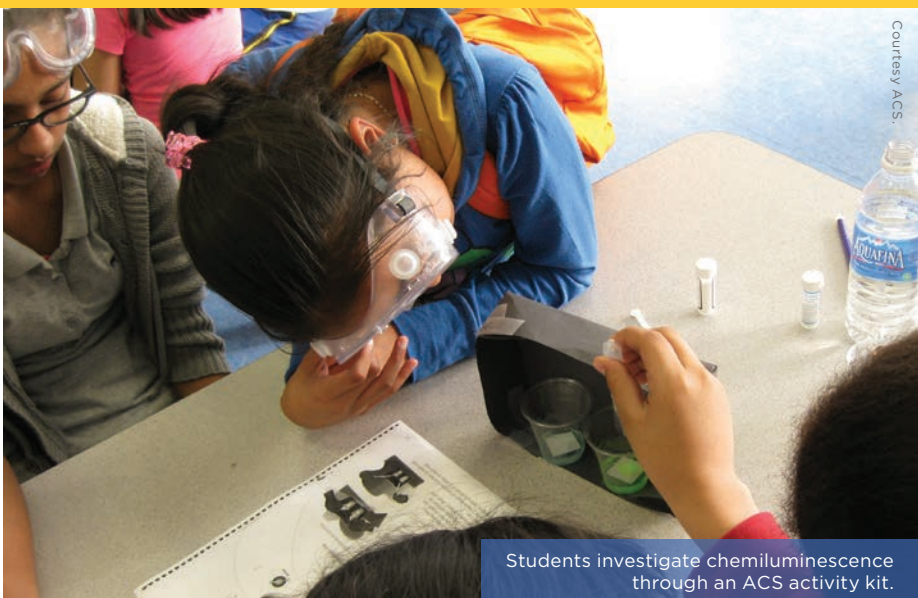
Students investigate chemiluminescence through an ACS activity kit.

250 Science Coaches in classrooms in the 2016–2017 school year