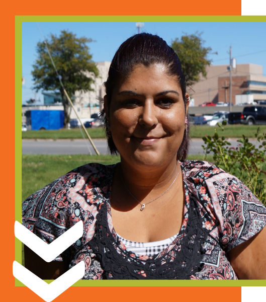
Earning her degree