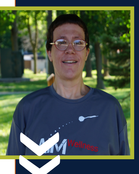
Lost more than 100 pounds