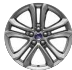
18" Polished Aluminum Available: SEL