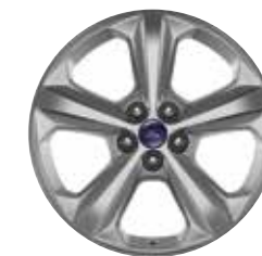
18" Sparkle Silver-Painted Aluminum Standard: SE

Voice-activated Navigation System with pinch-to-zoom capability (requires 201A)