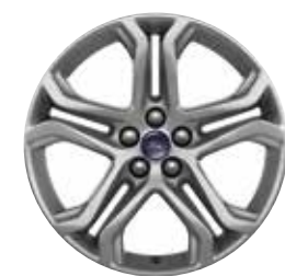
19" Luster Nickel-Painted Aluminum Standard

Voice-activated Navigation System with pinch-to-zoom capability