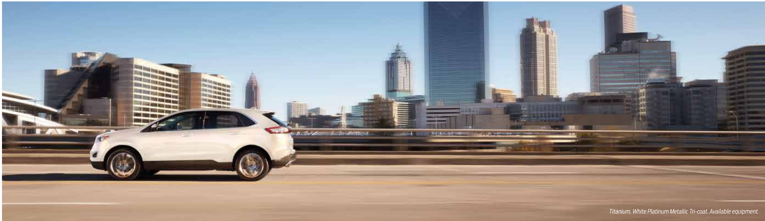
Titanium. White Platinum Metallic Tri-coat. Available equipment.