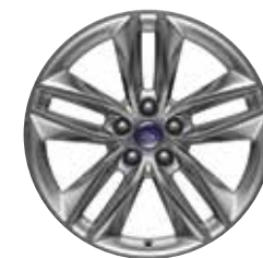
18" Sparkle Silver-Painted Split-Spoke Aluminum Standard: SEL