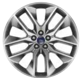
20" Polished Aluminum with Dark Stainless-Painted Pockets Optional