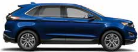
Kona Blue Metallic