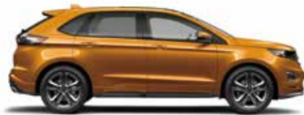
Electric Spice Metallic