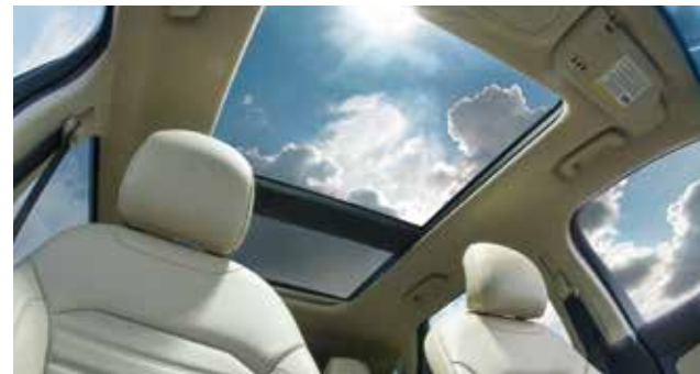
SEL, Magnetic Metallic. Available equipment.