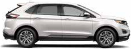
White Platinum Metallic Tri-coat

Exteriors This helpful guide is intended for selecting an exterior colour – not features, options or a trim level.