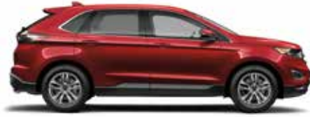
Ruby Red Metallic Tinted Clearcoat