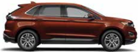
Bronze Fire Metallic Tinted Clearcoat