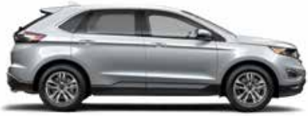
Ingot Silver Metallic