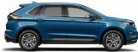
Too Good to Be Blue Metallic