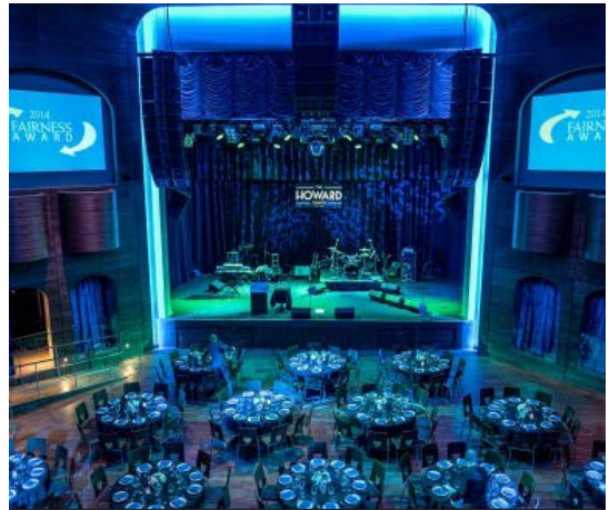
The Howard Theatre—Home to the Fairness Award