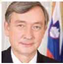
HE Danilo Türk, Board Chair President of Republic of Slovenia (2007-2012) Slovenia