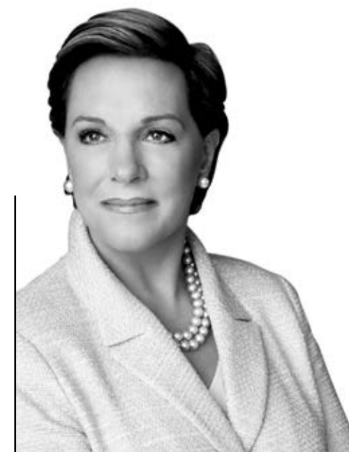
Photo: Dame Julie Andrews

Sydney Opera House Previews August 30 – September 4 Opening night September 6 (sold out) Through to November 5 Wednesday – Saturday at 7:30pm Tuesday, Wednesday and Saturday at 1pm Sunday at 3pm (Please note the performance schedule differs on certain dates.)