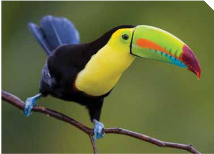
FAR LEFT: Israel LEFT: Costa Rica BELOW: Kyrgyzstan

→ classic two-week tour-plus-beach trip – and for those staying longer, the price of a three-month visa has been cut from $95 to $50. Viewed alongside Vietnam Airlines’ introduction of B787-9 Dreamliner flights from Heathrow to Hanoi and Ho Chi Minh City, which increases to a daily service next summer, and this snowball effect shows no signs of slowing.