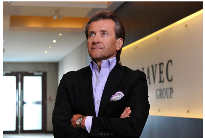
Herjavec Group Founder & CEO, Robert Herjavec

The Yahoo hack was recently recalculated to have affected 3 billion user accounts, and the Equifax breach in 2017 — with 143 million customers affected — exceeds the largest publicly disclosed hacks ever reported. These major hacks alongside the WannaCry and NotPetya cyberattacks which occurred in 2017 are not only larger scale and more complex than previous attacks, but they are a sign of the times.