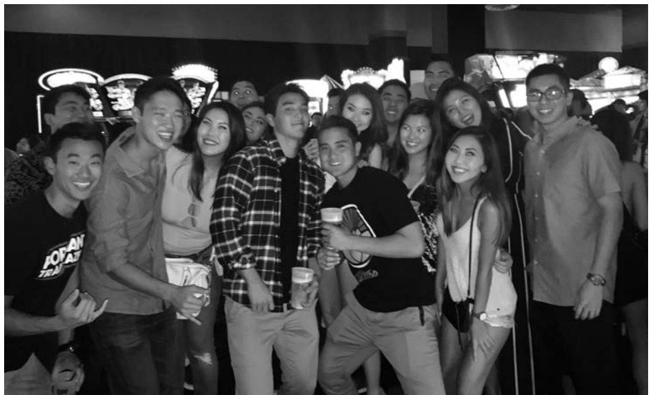
Over the holidays, alumni from the Class of 2011 gathered at Dave & Buster's in Honolulu.