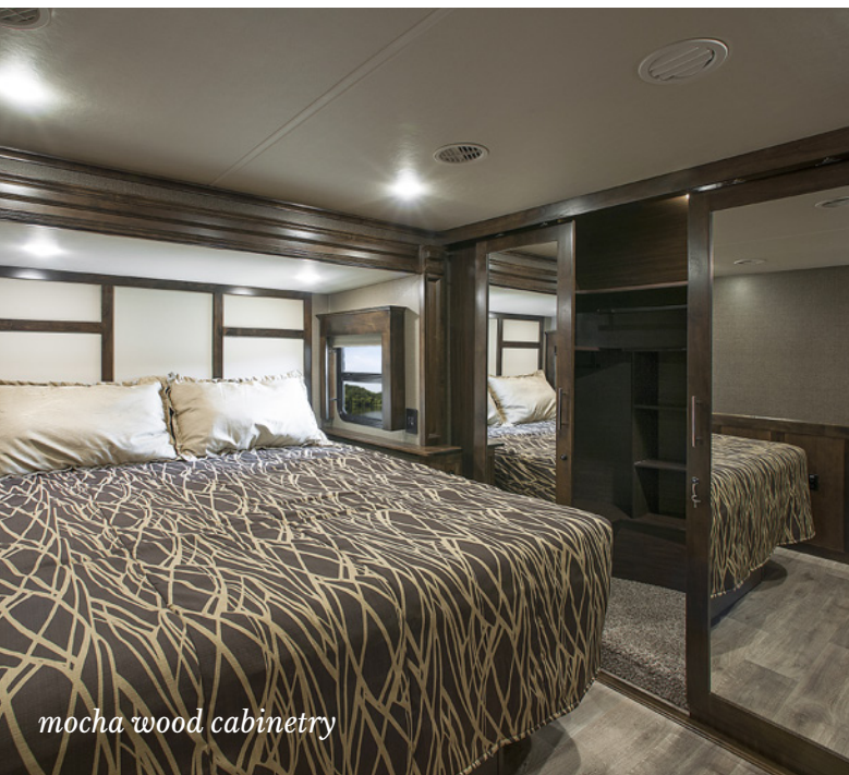
mocha wood cabinetry