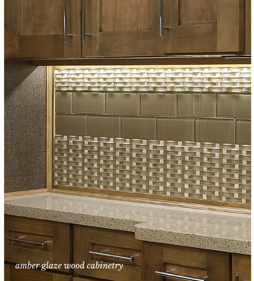
amber glaze wood cabinetry