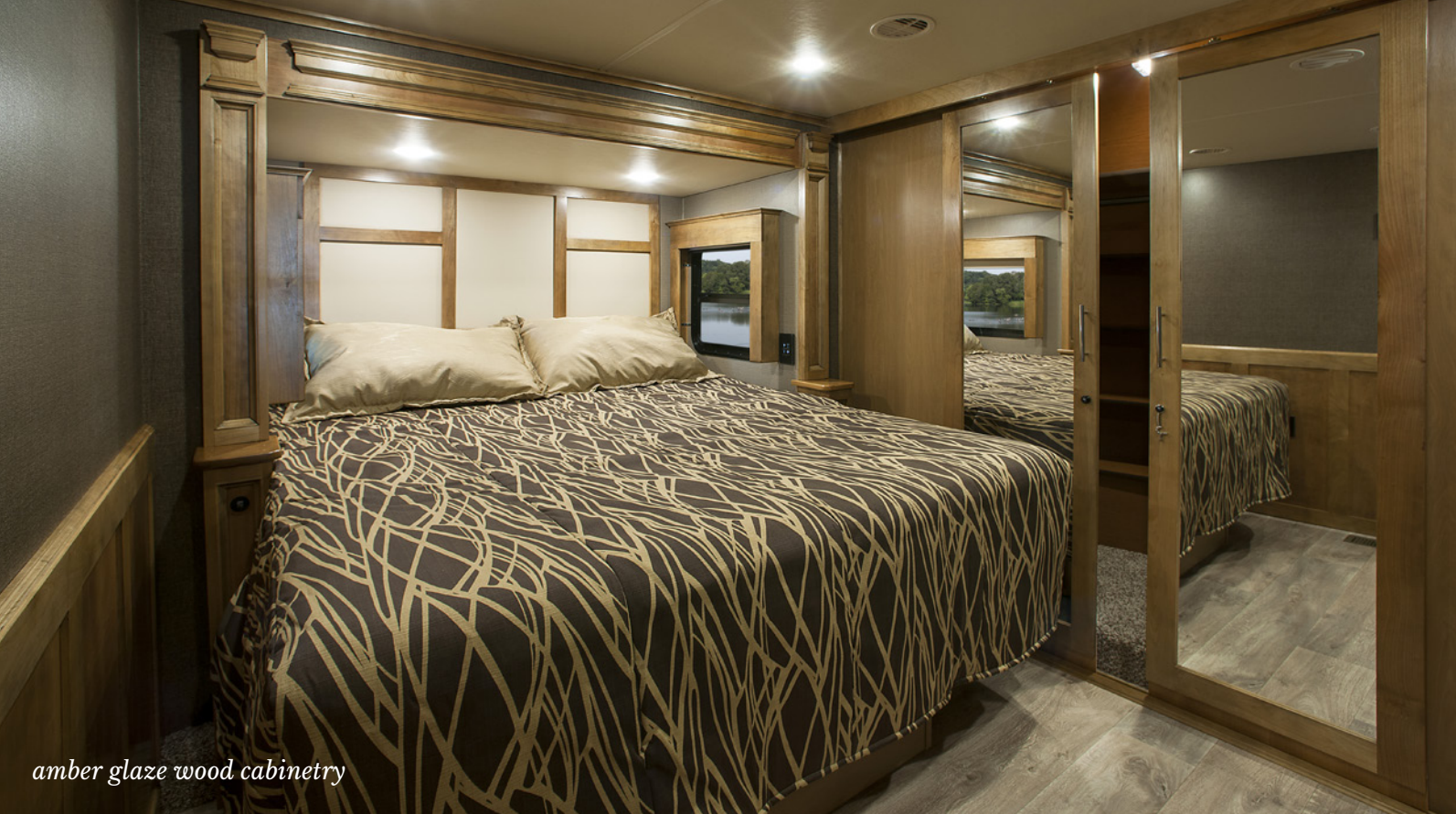
amber glaze wood cabinetry