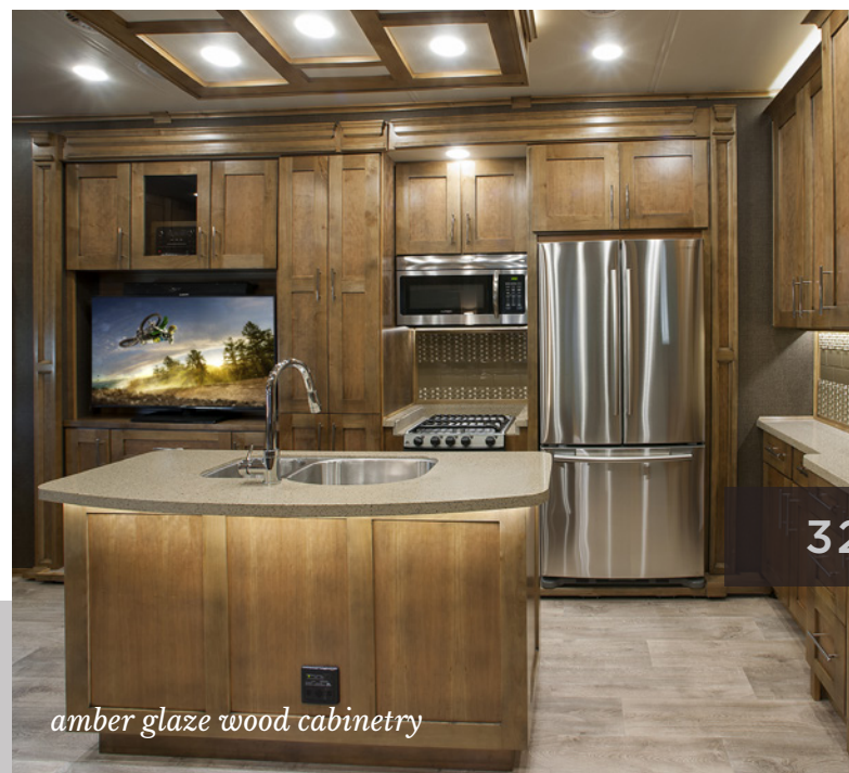
amber glaze wood cabinetry