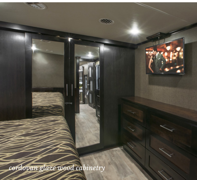
cordovan glaze wood cabinetry

**** unloaded and based off of an average