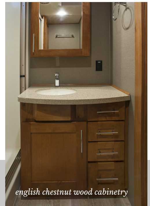
english chestnut wood cabinetry