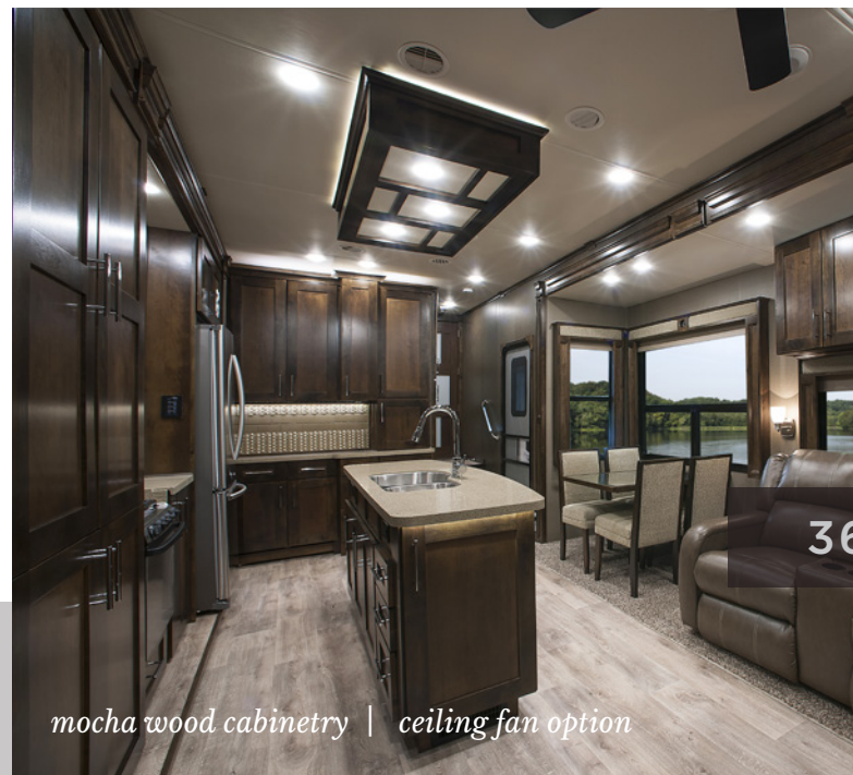
mocha wood cabinetry | ceiling fan option