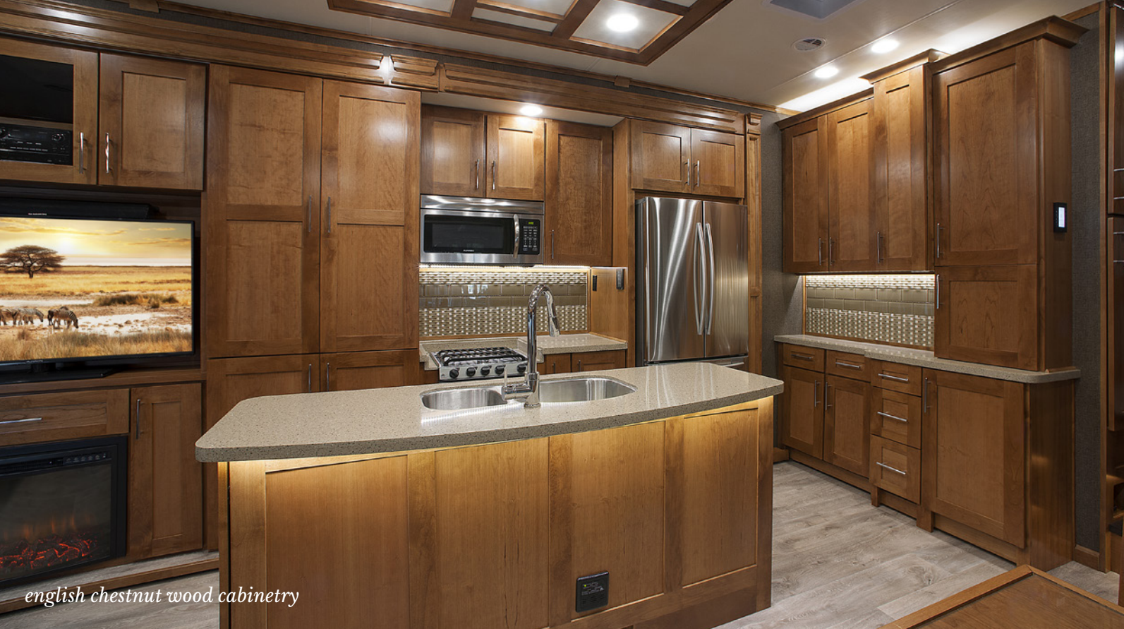
english chestnut wood cabinetry