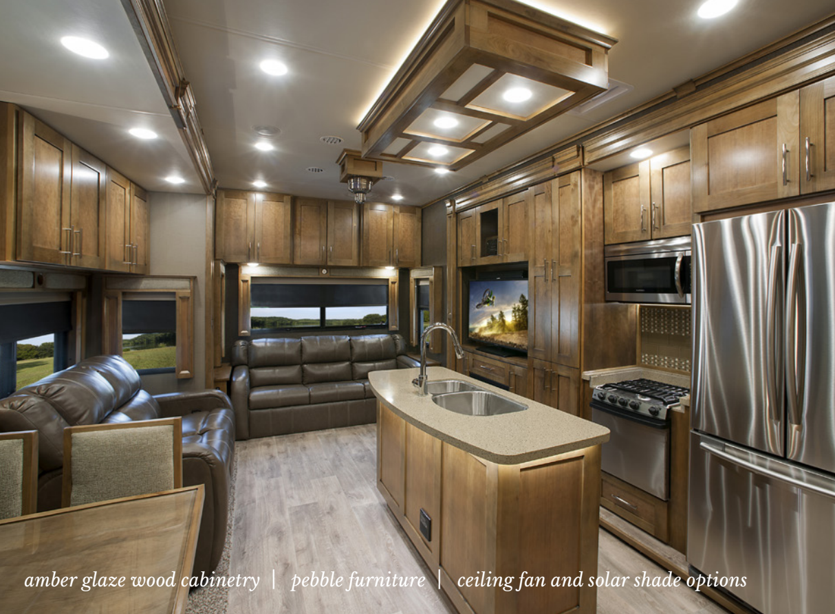
amber glaze wood cabinetry | pebble furniture | ceiling fan and solar shade options