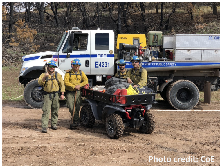
Figure 6—The DFPC Montrose Engine Crew working with the Honda Autonomous Work Vehicle