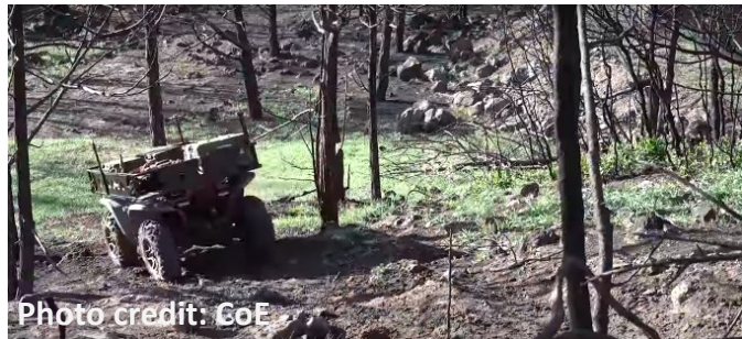
Figure 4—Honda Autonomous Work Vehicle navigating terrain on the Lake Christine Fire in Basalt, CO

The first day of field testing started with area familiarization. The CoE showed Honda the equipment storage location and