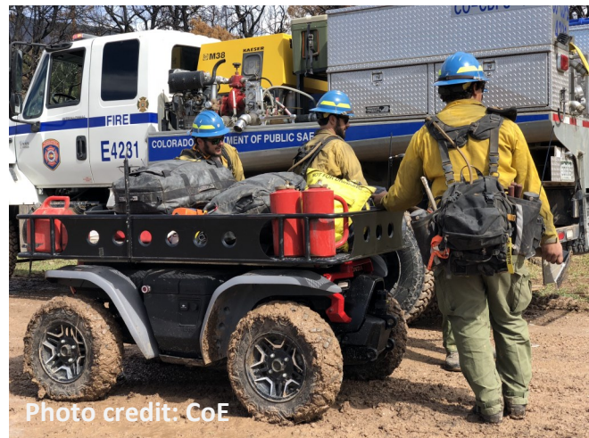
Figure 9— DFPC Montrose Engine Crew loading the Honda Autonomous Work Vehicle for a test run carrying equipment

The Honda Autonomous Work Vehicle showed great potential to assist firefighters with carrying equipment and supplies, thus reducing fatigue and injuries associated with those tasks; it also showed potential as a remotely deployed communications repeater. Honda was able to test the Autonomous Work Vehicle in terrain that they have never tested before, which led to Honda's observation that the data gathered in the CoE tests was extremely valuable and unique. In fact, Honda took lessons learned and data collected from the tests at the Lake Christine Fire site and is using it to develop the next prototype to test in Colorado. The conclusion was that since the Autonomous Work Vehicle is capable of accomplishing wildland firefighting missions in Colorado, that it could handle almost anything.