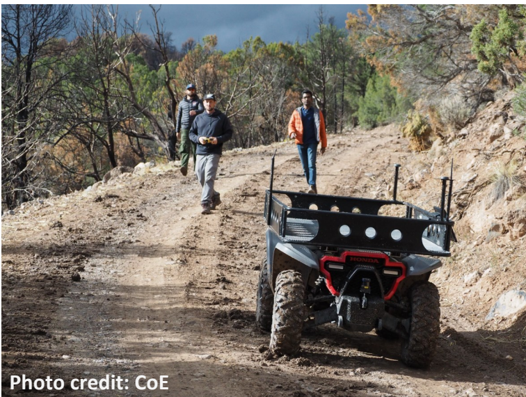
Figure 8—Honda Autonomous Work Vehicle operating in autonomous mode on a dirt road at the Lake Christine Fire burn area

The principle of the Autonomous Work Vehicle navigating wildfire terrain to assist firefighters is an exciting one. The apparatus can be operated in four different modes: remote control, learning, follow me, and autonomous mode. During the field testing, the Autonomous Work Vehicle was operated by using a remote control to navigate. While in remote control mode, data was collected to teach the software what it is able to navigate. The Honda R&D team was able to demonstrate the learning mode, in which they taught a route to the