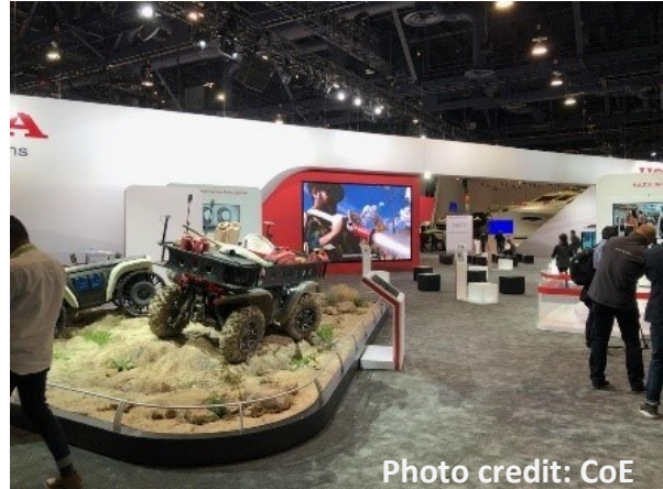
Figure 3—Honda Autonomous Work Vehicle at the 2019 Consumer Electronics Show in Las Vegas, NV

In the fall of 2018, Honda brought two Autonomous Work Vehicle prototypes to Colorado to test in the state’s wildland fire environment. Four team members from Honda R&D in Ohio and two from Honda R&D in Japan visited the CoE and the organizations jointly performed test missions at the Lake Christine Fire site. The CoE coordinated with the Lake Christine Incident Command and with Colorado Parks and Wildlife regarding testing in the Lake Christine Fire area. All testing was performed on State lands and in areas closed to the public. The goal was to test and understand the capability of the Honda Autonomous Work Vehicle in conditions as close as possible to actual wildland fire conditions, albeit after fire operations had concluded.