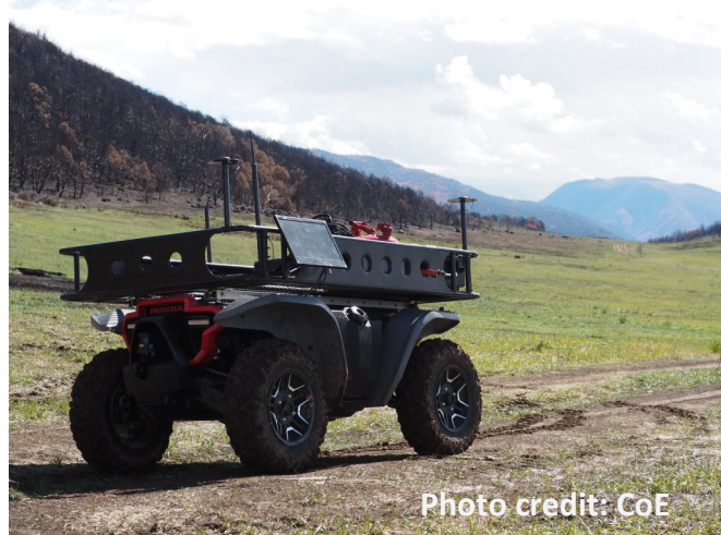
Figure 7— Honda Autonomous Work Vehicle at the Lake Christine Fire burn area

Autonomous Vehicles have been around for a while, whether it is in reference to machines performing tasks, self-driving cars, or unmanned aerial systems. Not many companies are focusing on autonomy for ground vehicles in off-road situations. In most cases, the task being performed by a robot autonomously is in a controlled environment with minimal variables. When it comes to automobiles, more variables do exist, but they have more infrastructure in place to help the cars make decisions (such as painted lines or shared information from other automobiles). Choosing a path with fewer obstacles and navigating uneven terrain autonomously is more of a challenge than is present in the current autonomous vehicle environment. Honda’s Autonomous Work Vehicle is trying to overcome this challenge.