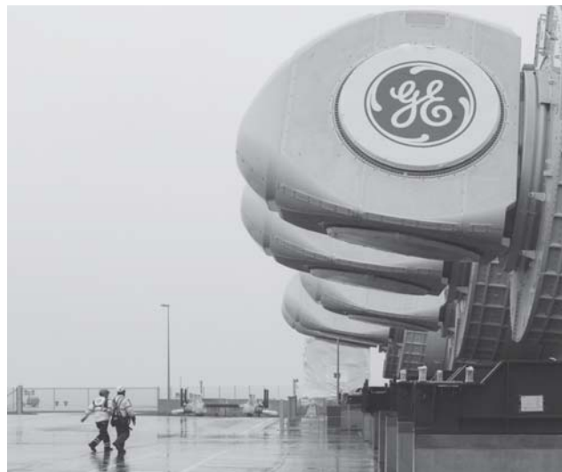
At Merkur Offshore Wind Farm, 66 Haliade 150-6 MW wind turbines will power a half million German homes.

We also need to run Power better, improving how we manage our inventory and material management, product development and delivery, and billings and collections. For example, by moving responsibility for collections closer to the customer relationship managers, Power was able to improve its visibility to cash and collect it earlier in the quarter. Where we used to get just 35 percent of our cash in the first two months of the quarter, in the fourth quarter, Power increased this to 50 percent. This kind of operational improvement takes hard work, and it is a multi-year journey, but I'm encouraged by the Power team's dedication and progress.