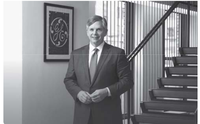
H. Lawrence Culp, Jr. Chairman of the Board and Chief Executive Officer

Thank you for the opportunity to earn your confidence and trust.