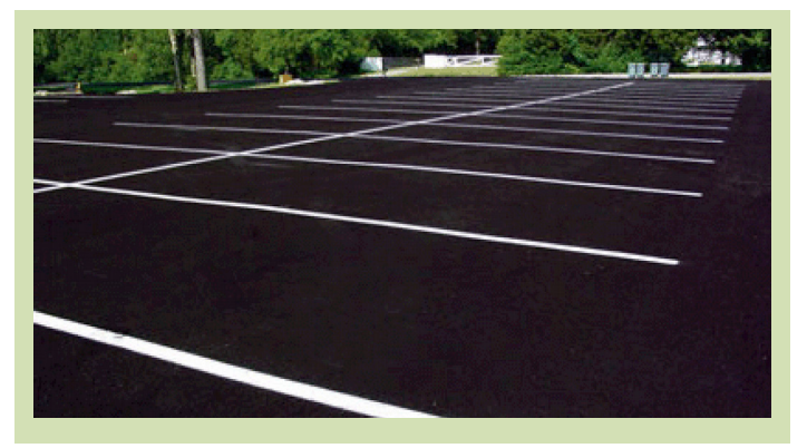
Figure 1.1. 90° Stalls

The 90° angle (Figure 1.1) achieves the highest parking stall capacity. This type of parking is more suited for all-day parking (such as employee parking) because it has the highest degree of difficulty for entering and leaving parking stalls. It is generally not preferred for "in and out" lots such as fast food restaurants and banks.