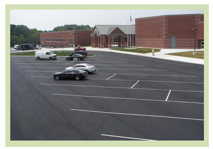
Figure 1.2. 45° Stalls

With limited paving real estate, 45° stalls (Figure 1.2) are sometimes preferred. The small change in angle also permits the use of narrower aisles. This angle further reduces the parking stall count.