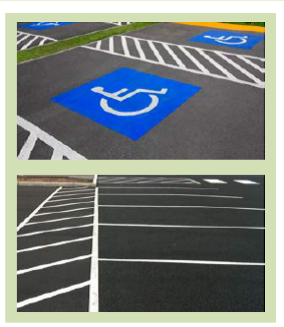
Figure 1.4. ADA Pavement Markings

It is noted that often local ordinances dictate stall and aisle dimensions.