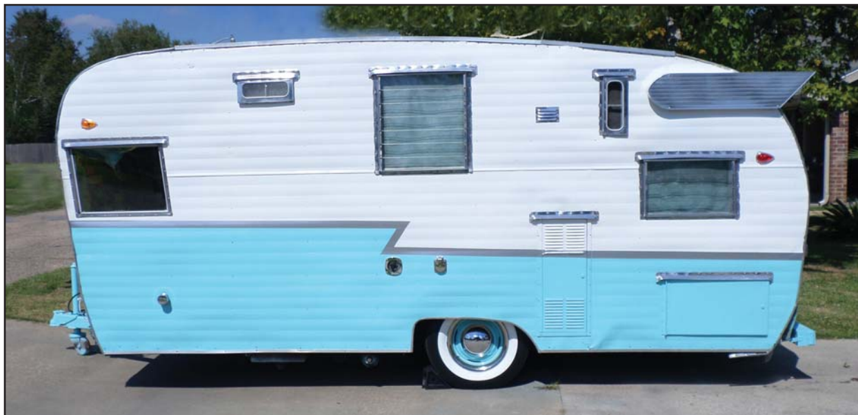
1960 Shasta Deluxe 19