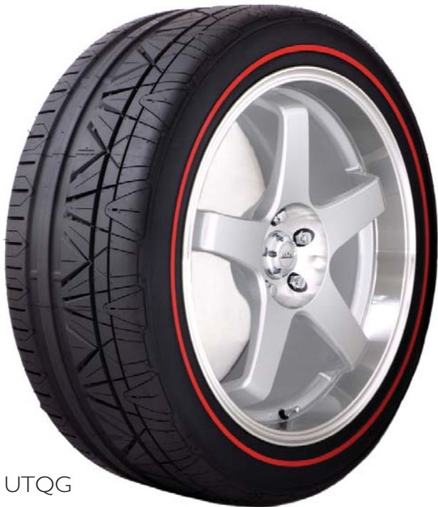
UTQG 260 AA A

The inner shoulder has a continuous rib formed from a single, solid block. This design increases the tire's rigidity and stability. This rigid design keeps you connected to the road during hard braking and acceleration.