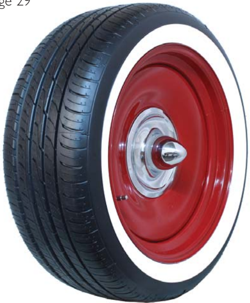
Rim Courtesy of Mobsteel www.mobsteel.com

TIRE SIZE HEIGHT V.W. WIDTH SECTION WIDTH LOAD INDEX* APPROVED RIMS PRICE