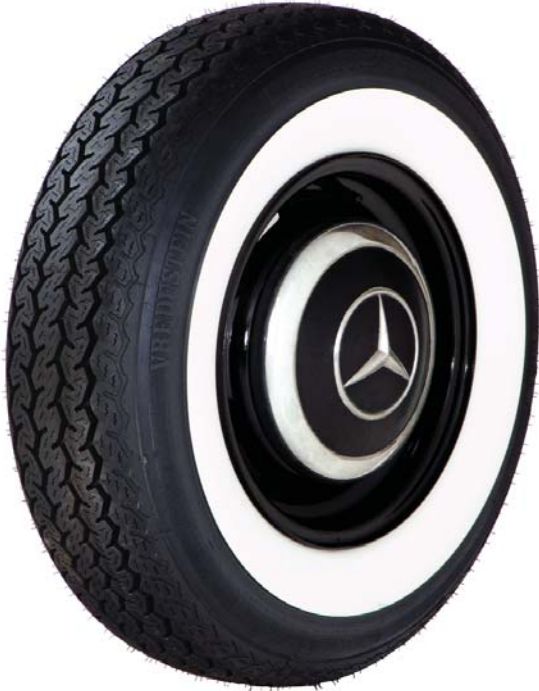
Early Mercedes' were equipped with a 65mm - 2 5 / 8 " white wall.

Brand: Vredestein Sprint Classic Built in Europe for European Cars