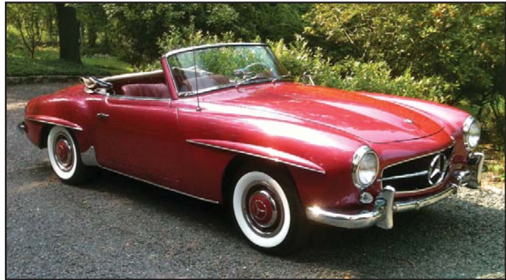
The 640X13 is a European size - 24.7". The 640/700X13 at 25.3" is an excellent fitment for many classic Mercedes and many U.S. cars.