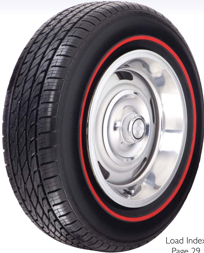
Load Index Page 29