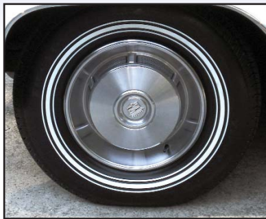
Style C - Triple Stripe