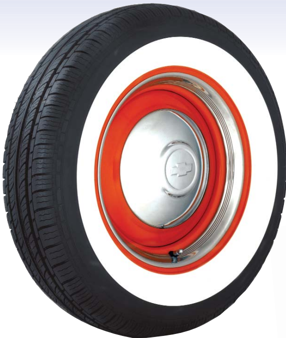
Brands May Vary With Availability