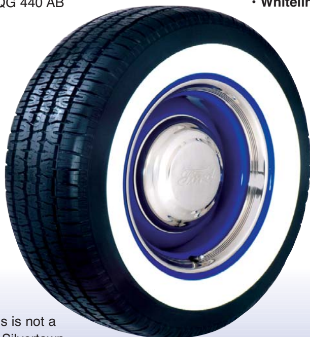
This is not a BFG Silvertown.

Also Available: • Goldline • Blueline • Whiteline