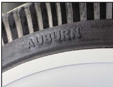
Authentic Beauty Ring Available $19.50