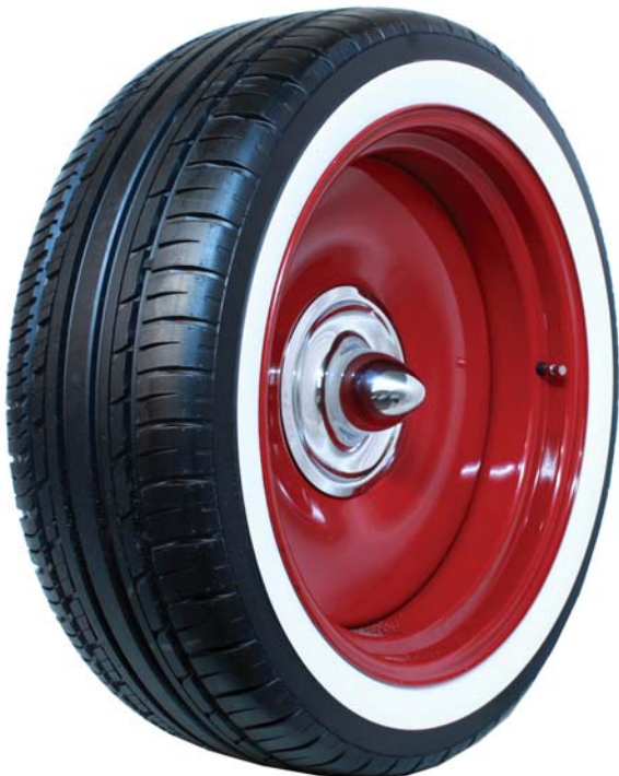
20" Rim

TIRE SIZE HEIGHT WWW WIDTH TREAD WIDTH SECTION WIDTH LOAD INDEX * RIM WIDTH PRICE