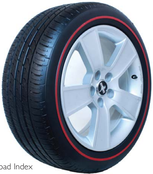
* Load Index Page 29