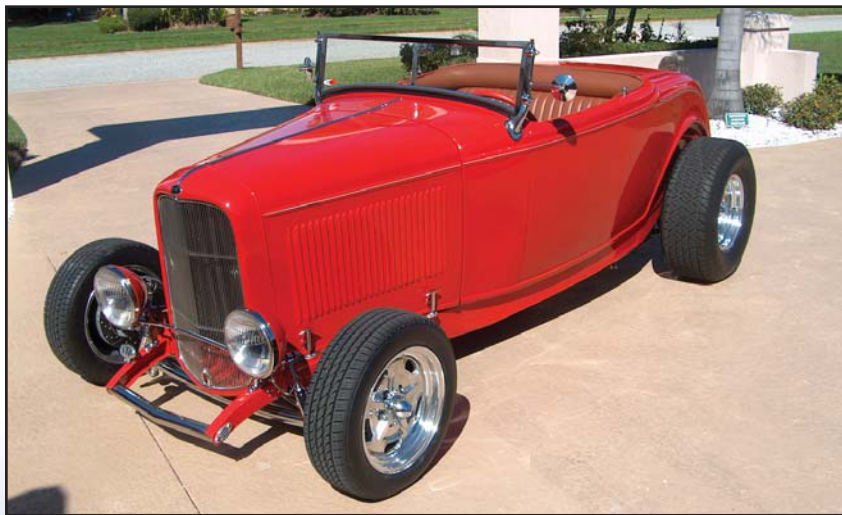
Odd Rodd Creations, Builder Rusty Jackson

Smoothies are designed for pre 1948 cars. For cars after 1948, Federal law requires that we leave all required DOT information on the tire's sidewall. This information will be located in the lower bead area.