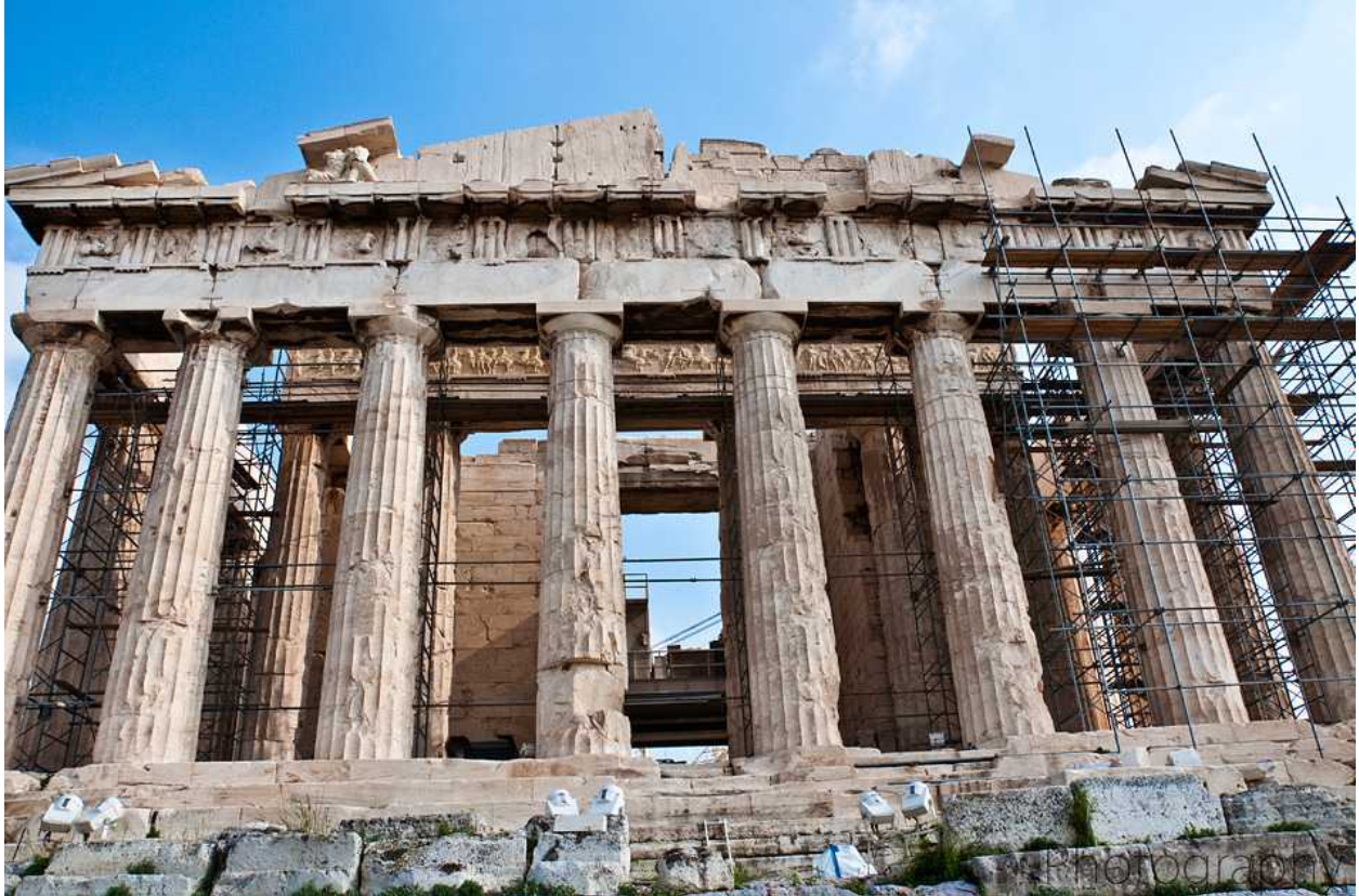
The Acropolis, Athens

https://www.youtube.com/watch?v=xP-FsX0QW88