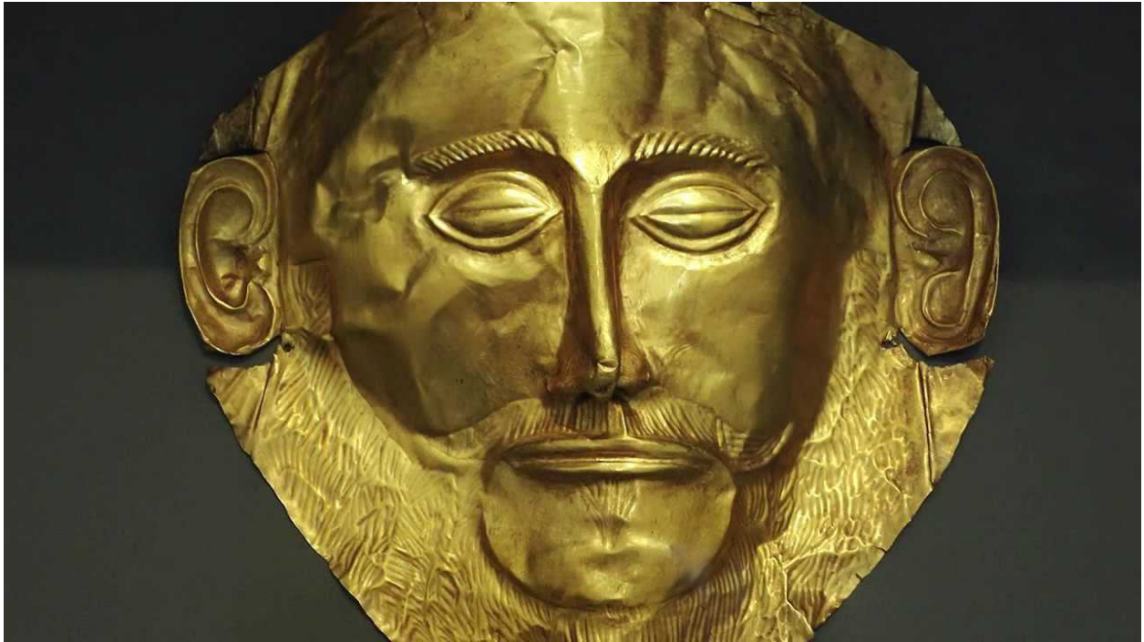
The Golden Mask of Agamemnon, Temple of Mycenae