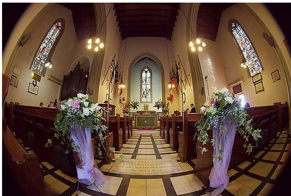
St. Paul's Anglican Church, Athens http://anglicanchurchathens.gr