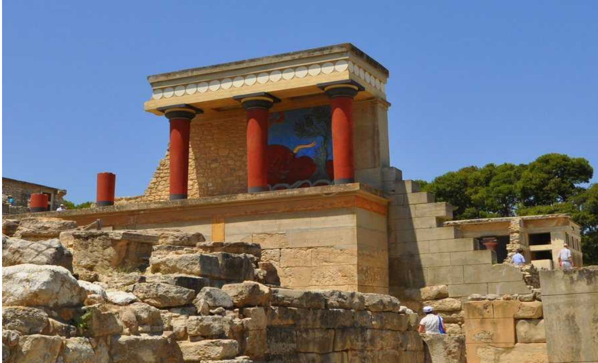
Minoan Temple, Crete