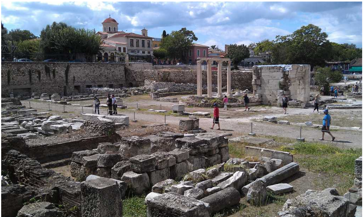
Ancient Market (Agora), Athens