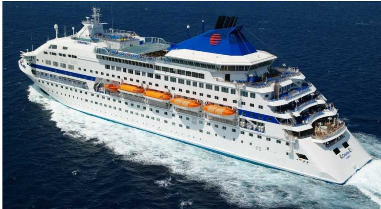
The Celestyal Crystal

https://www.youtube.com/watch?v=mIFwG05n2-k Ship https://www.youtube.com/watch?v=sO03n149A1U Cruise