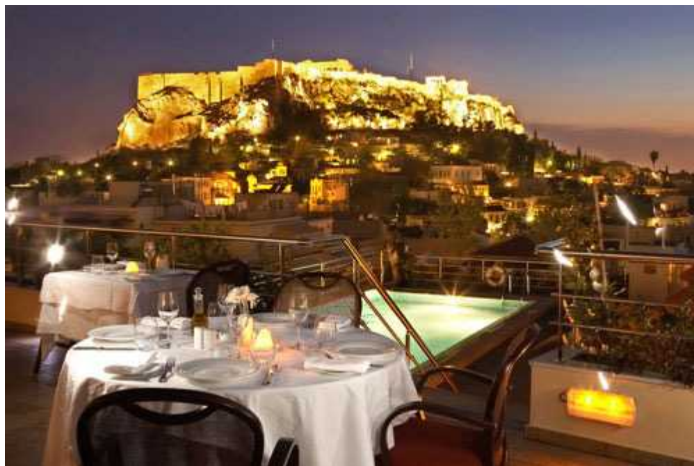
The Tour Banquet at the Electra Palace Hotel