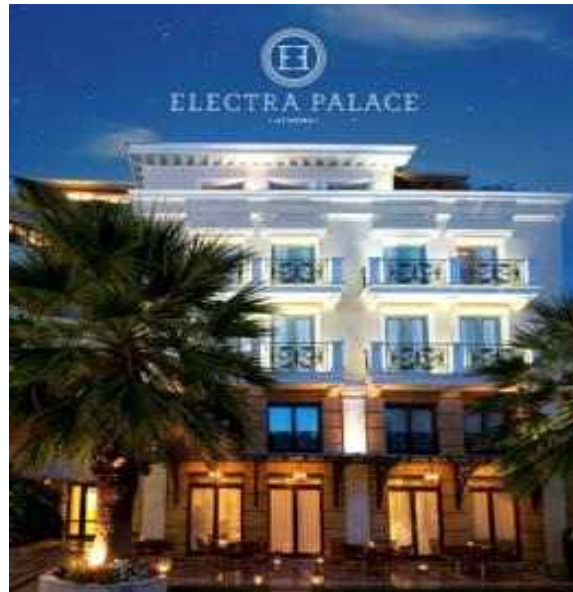
The Electra Palace

http://electrahotels.gr/en/athens/electra-palace-athens Hotel website