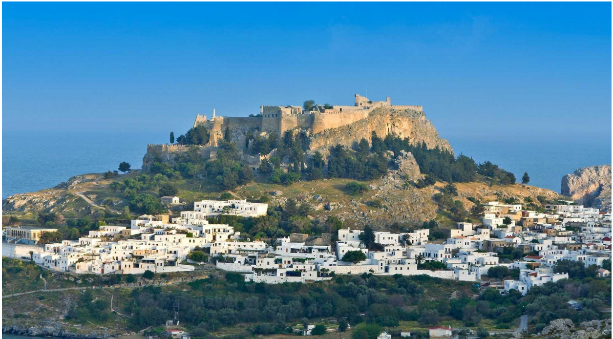
Patmos, where St. John wrote the book of Revelation