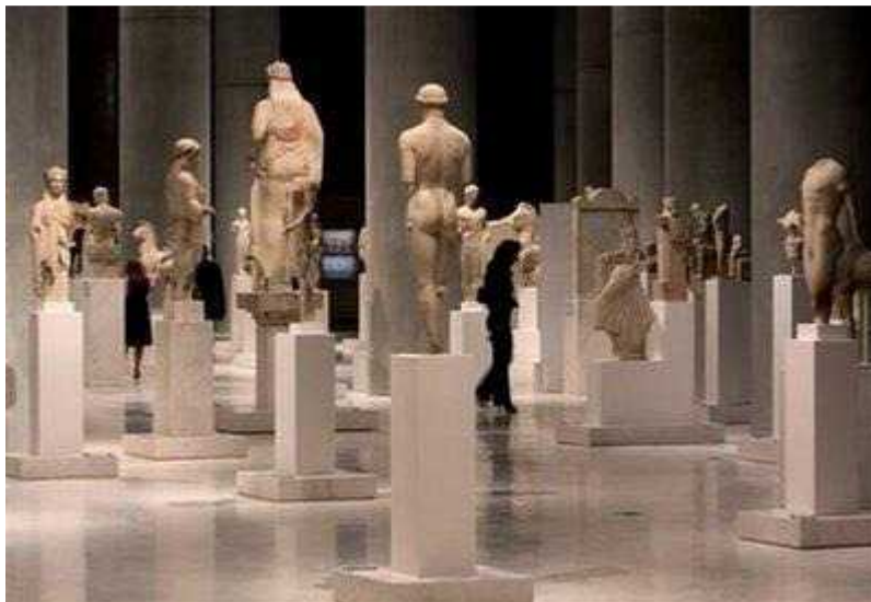
New Acropolis Museum, Athens

https://www.youtube.com/watch?v=xP-FsX0QW88