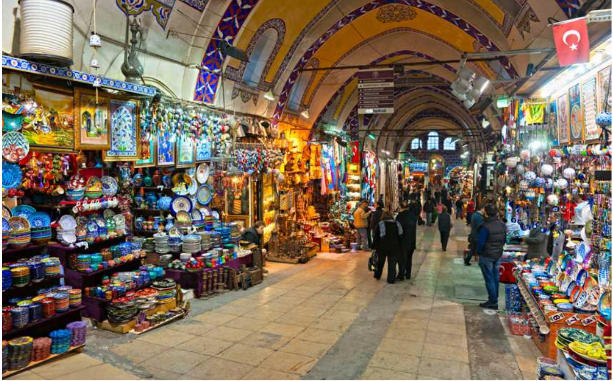
Central Market, Athens https://www.youtube.com/watch?v=hbG8kJgClmo