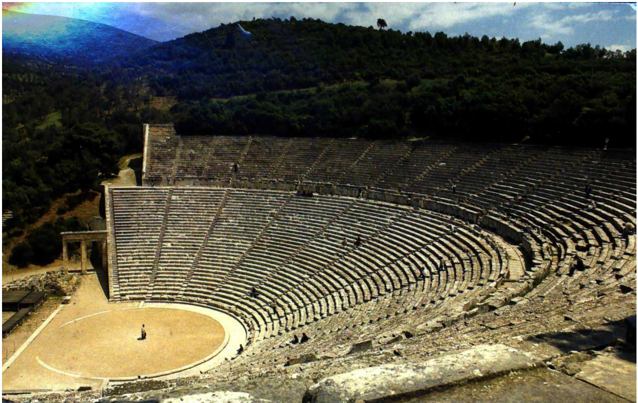
The Amphitheater at Epidaurus