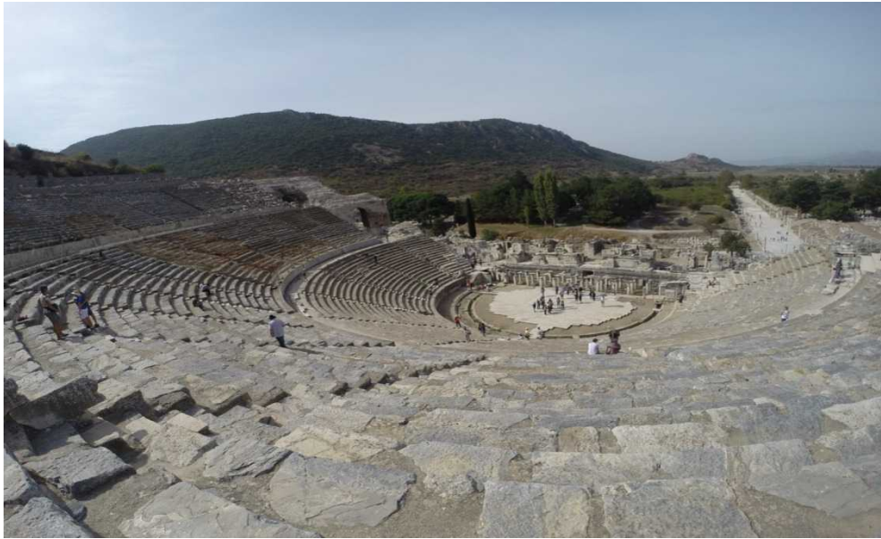
The Amphitheater at Ephesus