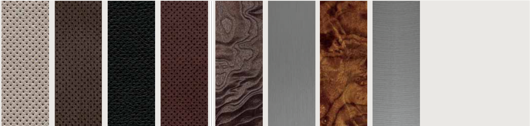
Cappuccino Hazelnut Ebony Terracotta Espresso Ash Swirl Brushed Aluminum Brown Swirl Walnut Sonata Spin Aluminum