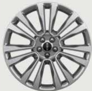
21" Premium Painted and Bright-Machined Aluminum RESERVE Optional