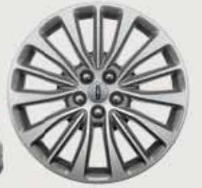
18" Premium Painted Aluminum SELECT