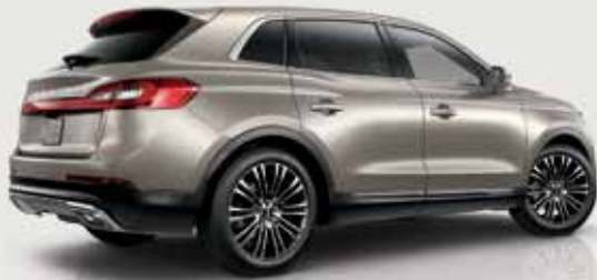
20" Premium Painted and Bright-Machined 20-Spoke Aluminum RESERVE (FWD models; AWD with 3.7-liter)