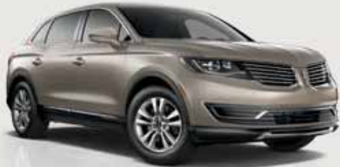
18" Painted Aluminum BASE/PREMIERE / SELECT & RESERVE 1 Available