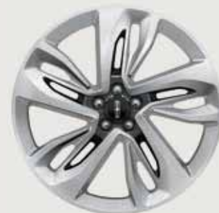
21" Polished Aluminum RESERVE Optional