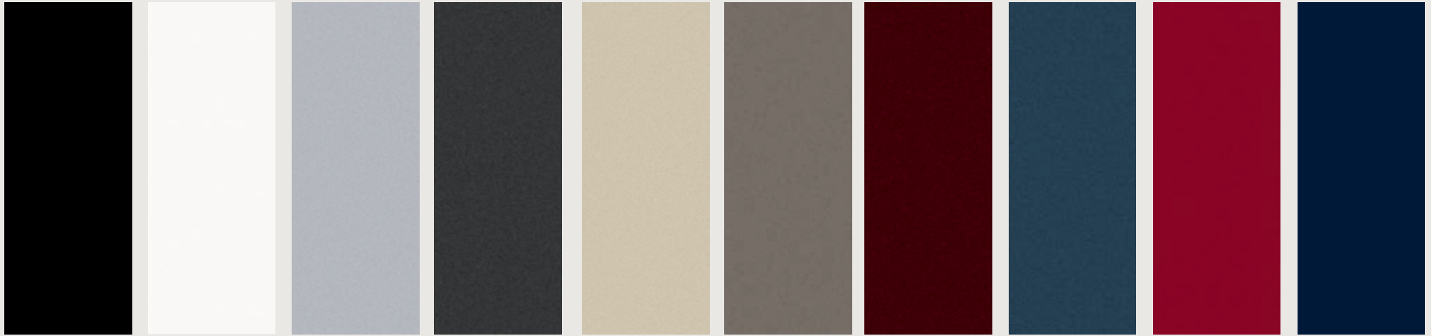
1 Black Velvet 2 White Platinum Metallic Tri-coat 1 3 Ingot Silver Metallic 4 Magnetic Gray Metallic 5 Ivory Pearl Metallic Tri-coat 1 6 Iced Mocha Metallic 1 7 Burgundy Velvet Metallic Tinted Clearcoat 1 8 Blue Diamond Metallic 9 Ruby Red Metallic Tinted Clearcoat 1 10 Rhapsody Blue 1