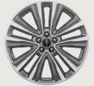
20" Premium Painted and Bright-Machined 10-Spoke Aluminum RESERVE (AWD with 2.7-liter)