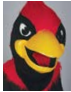
Big Red Team Mascot