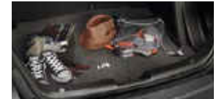
Carpet trunk mat