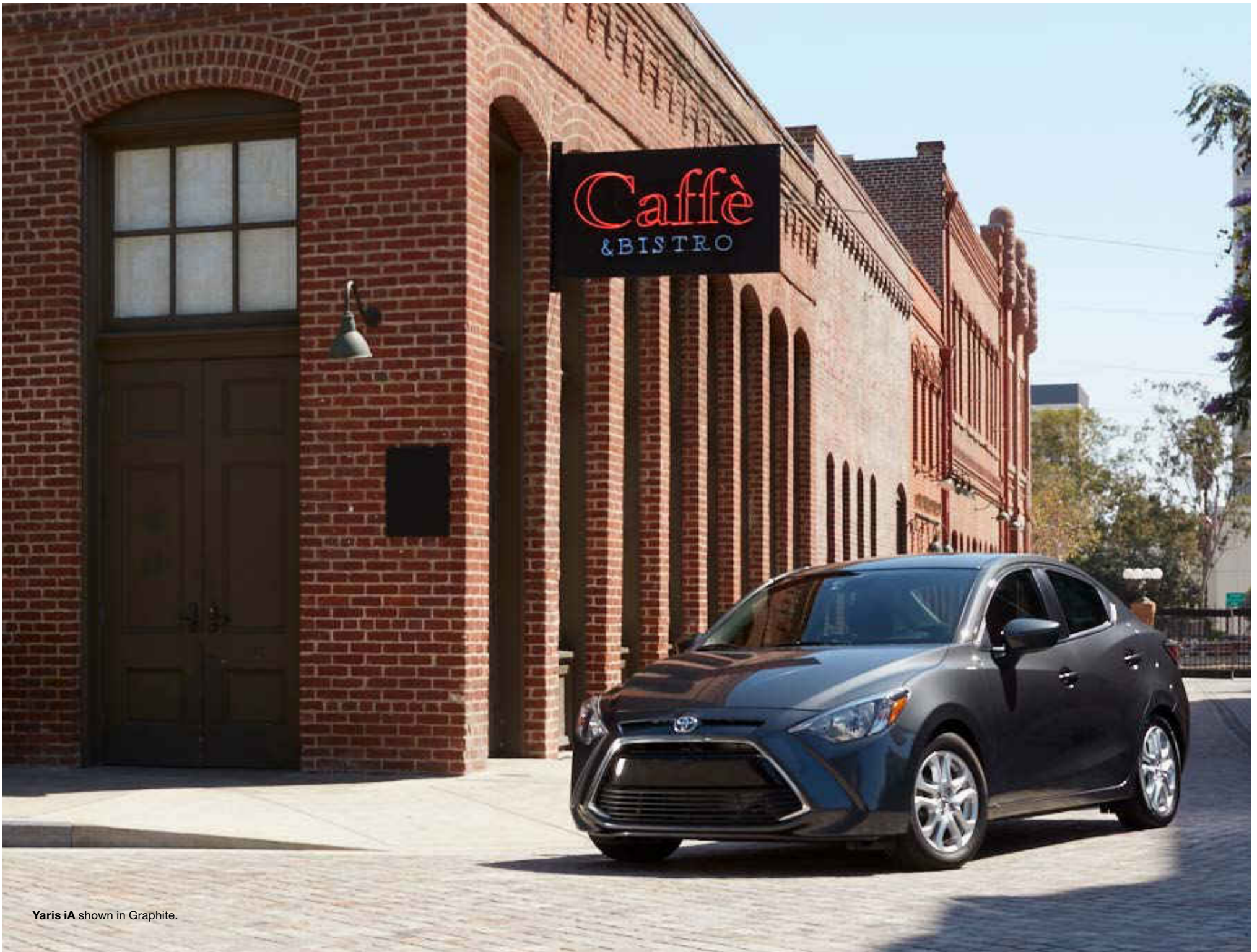
Yaris iA shown in Graphite.