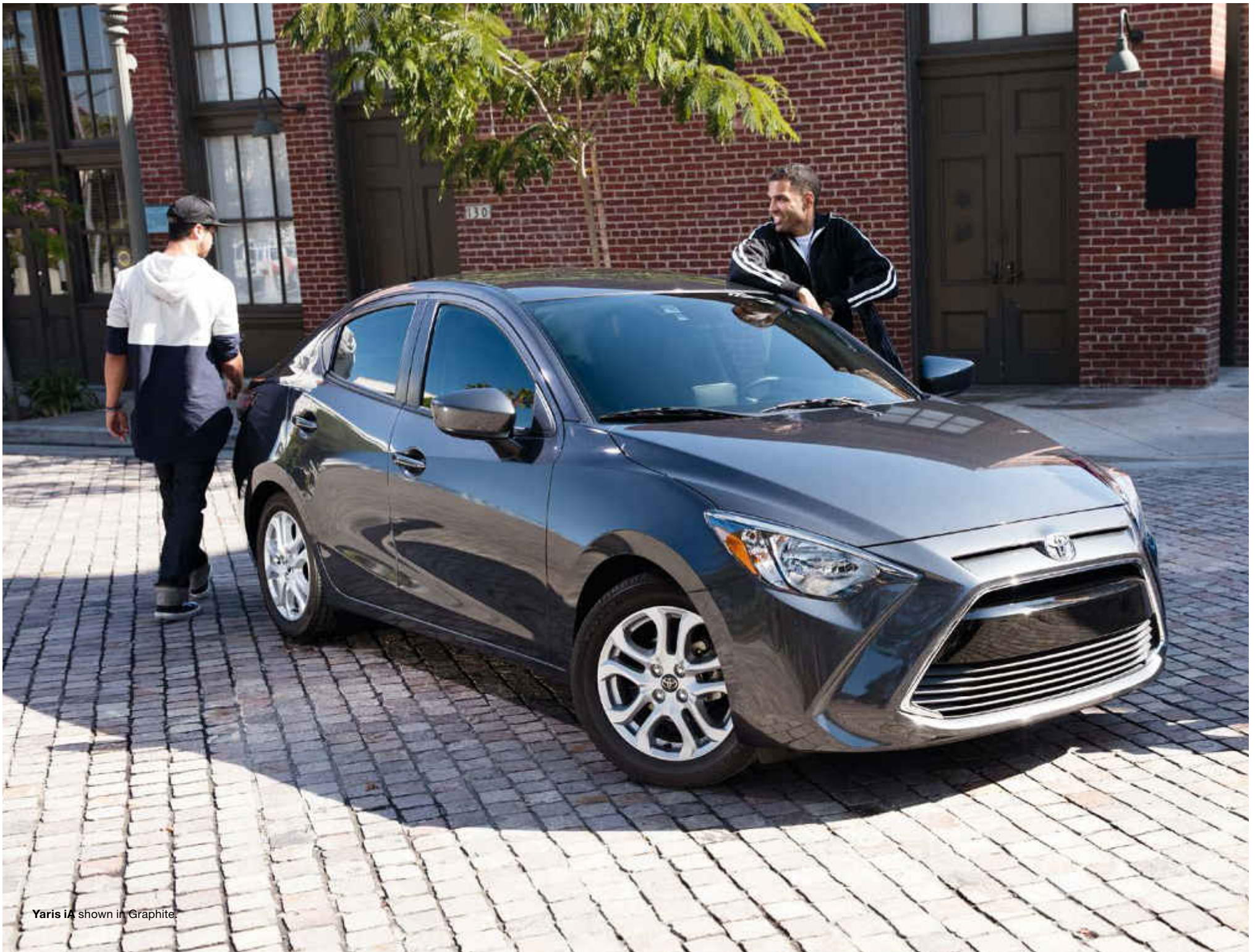
Yaris iA shown in Graphite.