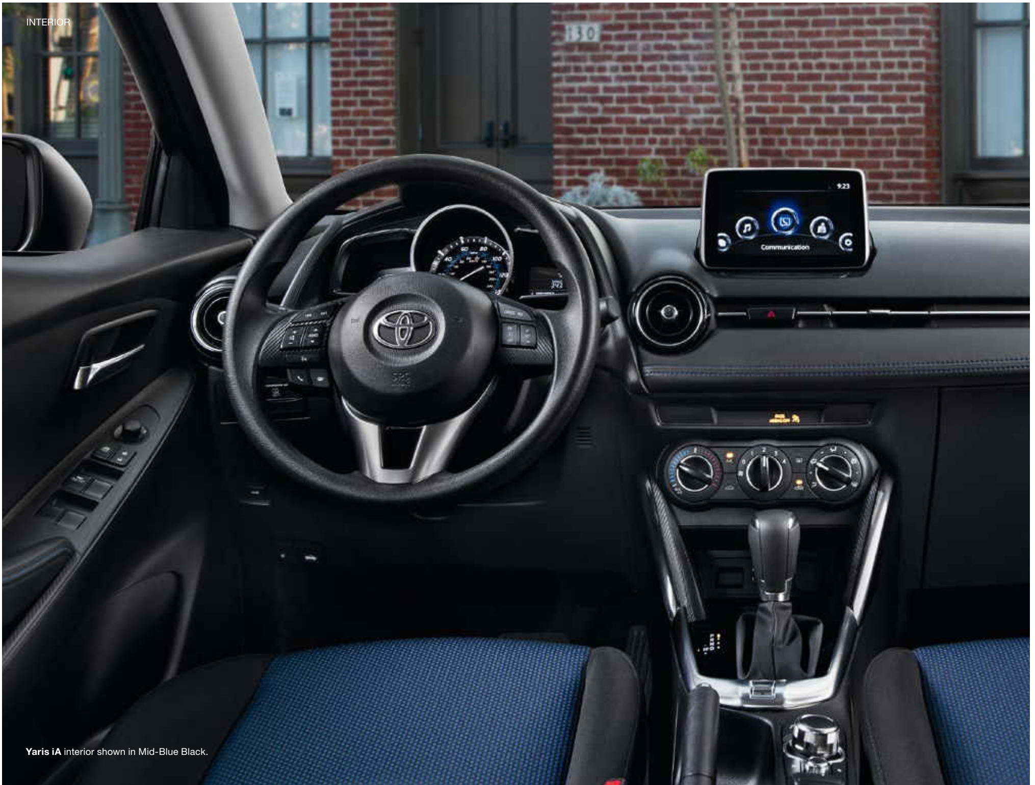
Yaris iA interior shown in Mid-Blue Black.