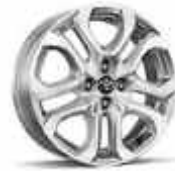
Split-spoke alloy wheel