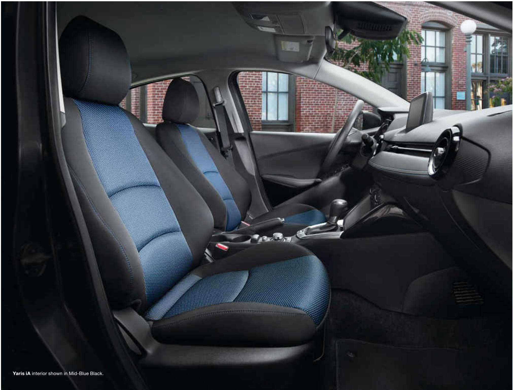
Yaris iA interior shown in Mid-Blue Black.