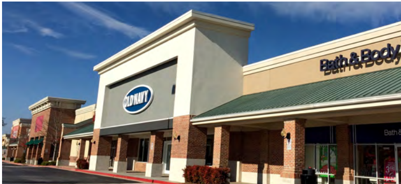
Conyers Crossroads (Atlanta MSA)

465,993 sq ft Kohl's, AMC, TJMaxx, Best Buy, HomeGoods