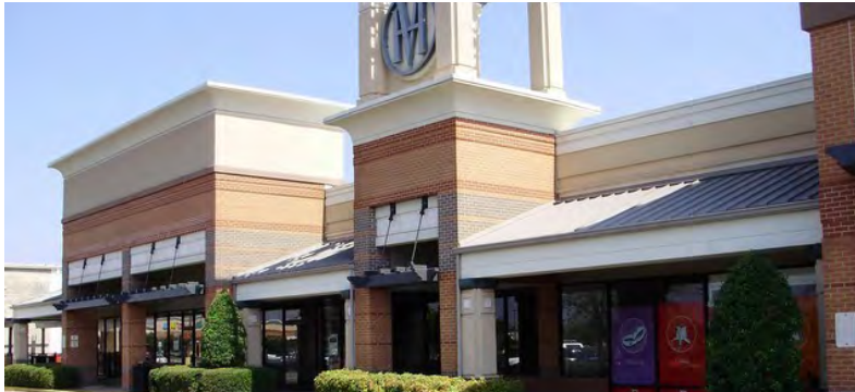
Hamilton Village (Chattanooga, TN)