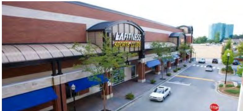
Buckhead Place (Atlanta, GA)

Sprouts, Zoes Kitchen, Chipotle, Hollywood Feed