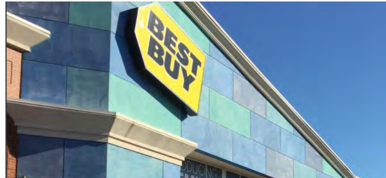
Mall of GA Crossing (Buford, GA)

465,993 sq ft Kohl's, AMC, TJMaxx, Best Buy, HomeGoods