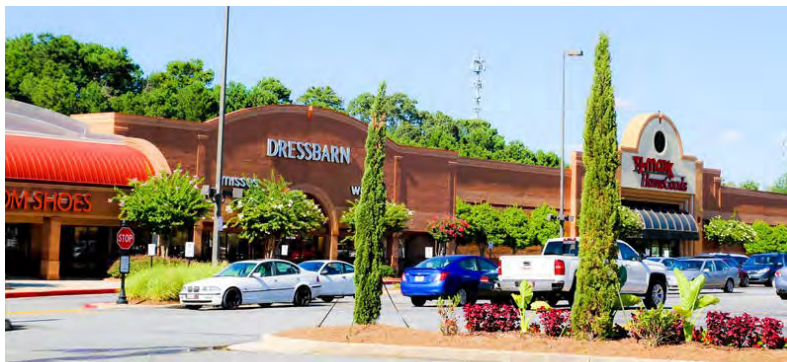
Providence Square (Marietta, GA)

960,269 sq ft Bed, Bath & Beyond, Marshalls, JC Penney, Target, Ross, Stein Mart