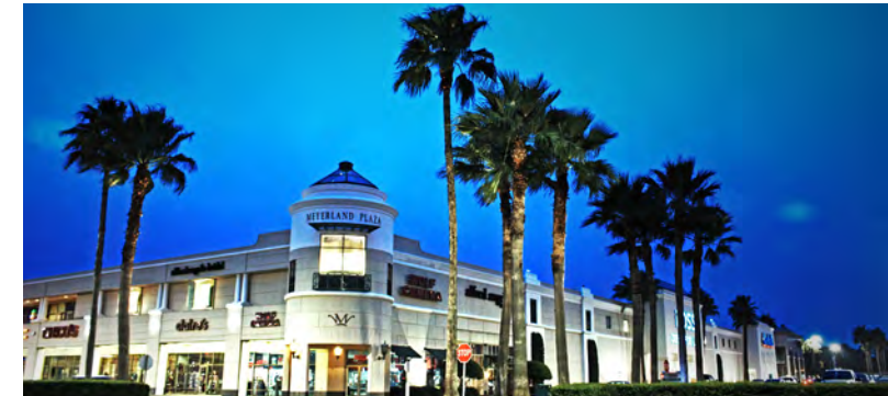
Meyerland Plaza (Houston, TX)

436,765 sq ft Target, Nordstrom Rack, TJ Maxx, HomeGoods