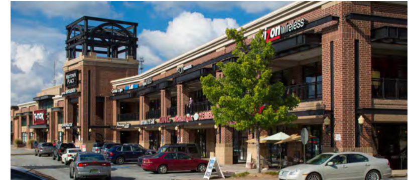
Midtown Place (Atlanta, GA)

Mixed use urban lifestyle center Crate & Barrel, REI, Barnes & Noble