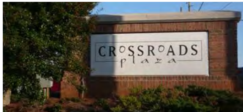
Crossroads Plaza (Cary, NC)

206,823 sq ft Home Depot, TJ Maxx 'n More