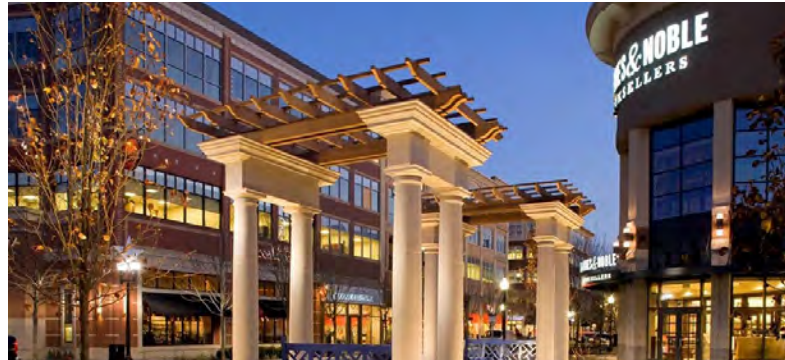
Blue Back Square (West Hartford, CT)

Stein Mart, Dick's Sporting Goods, Walmart Supercenter