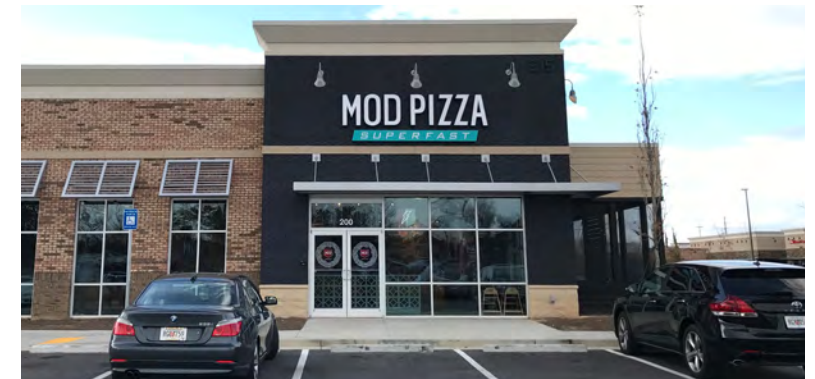
Dawson Marketplace (Atlanta MSA)