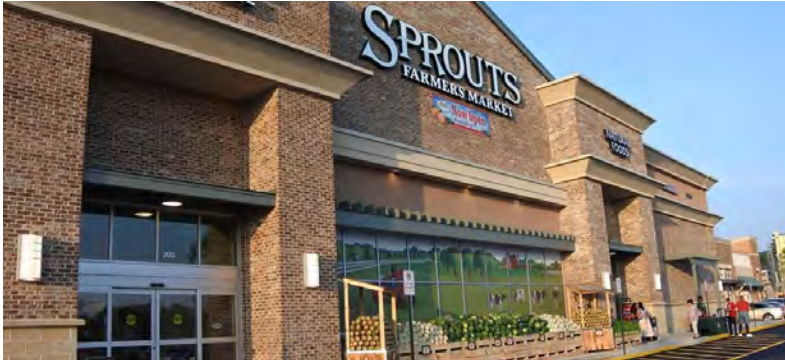
Sugarloaf Marketplace (Atlanta MSA)