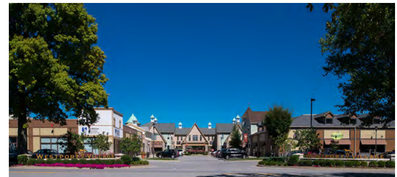
Westport Village (Louisville, KY)

670,871 sq ft Bed, Bath & Beyond, Stein Mart, Marshalls, Total Wine, Best Buy, Michaels, Old Navy, Petco