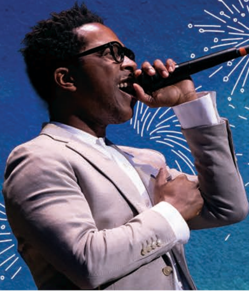
Leslie Odom, Jr., Guest Artist