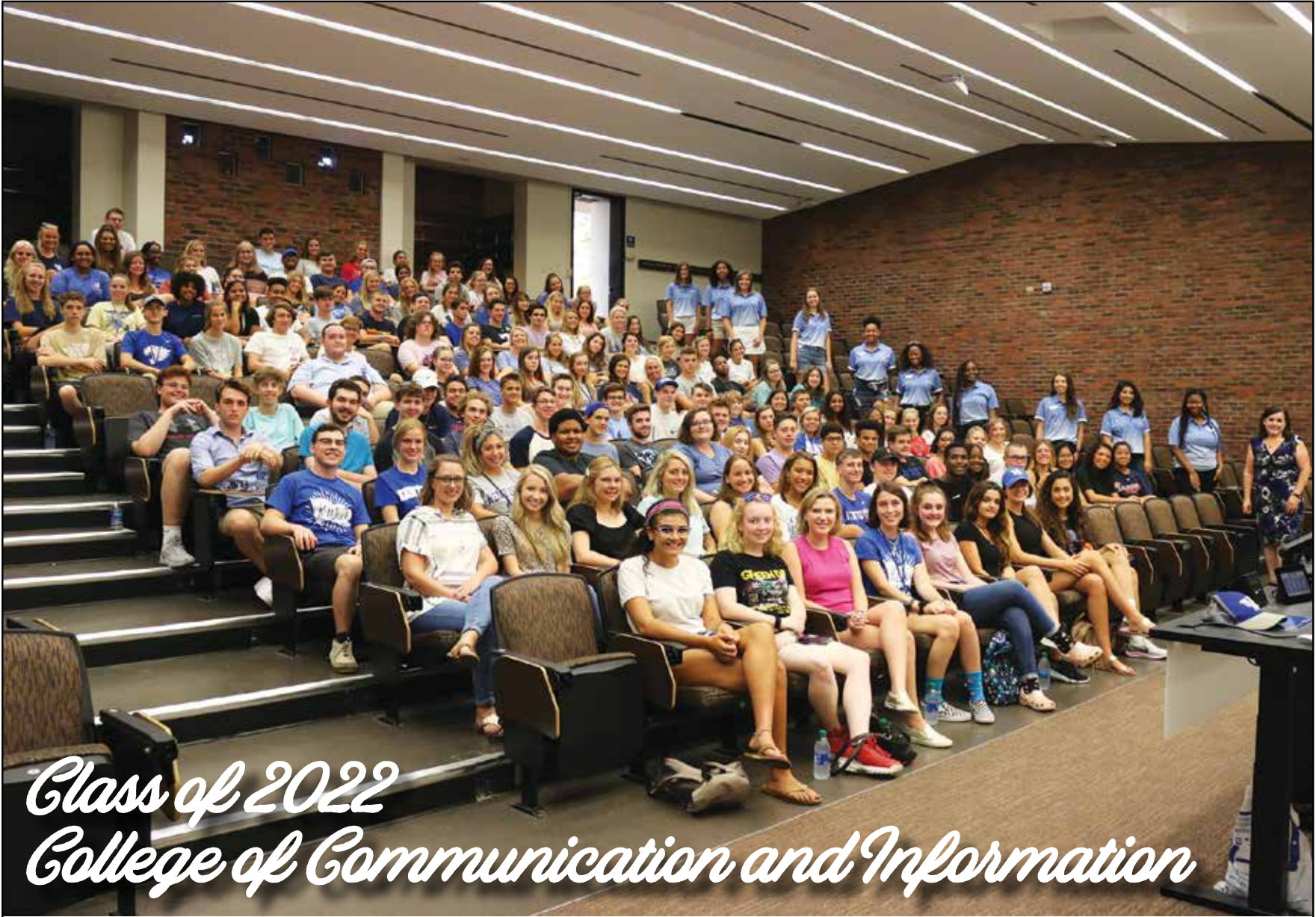
Class of 2022 College of Communication and Information