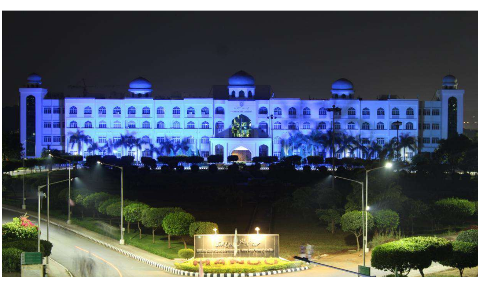
Access to Quality Education through Urdu Medium